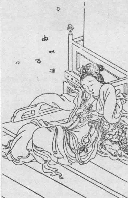
• 明刻本《历代百美图》——寿阳公主 Princess Shouyang in the Ming Dynasty block-printed Beauties in All Ages (1368-1644)

During the Southern and Northern Dynasties (420-589), the fashion prevailed to appreciate and laud the plum blossom in poetic forms. According to historical records, one day Princess Shouyang, daughter of Emperor Wu of the Song Dynasty in the Southern Dynasties (363-422), was resting under the eaves of Hanzhang Palace in the imperial garden. Then a sudden breeze rustled the plum trees, and among all the fallen plum blossoms, several by chance drifted down onto her fair face, leaving a faint yet indelible floral imprint on her forehead that enhanced her beauty further. Since the queen was also very fond of it, from then on our young princess who loved beauty so much often picked a few plum blossoms to paste on her forehead. The court ladies were said to be so impressed, that they started decorating their own foreheads likewise. Very soon this cosmetic design known as plum blossom makeup became popular in the palace, then widespread among the folk and won great favor among girls. Niu Qiao, a Chinese poet in the Tang Dynasty (618-907) once alluded to this story in a poem, "As the plum blossom happened to decorate Princess Shouyang's forehead and add to her charm, all court ladies strived to learn this plum blossom makeup."