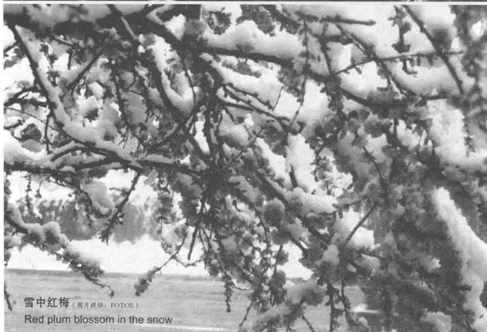
• 雪中红梅 Red plum blossom in the snow