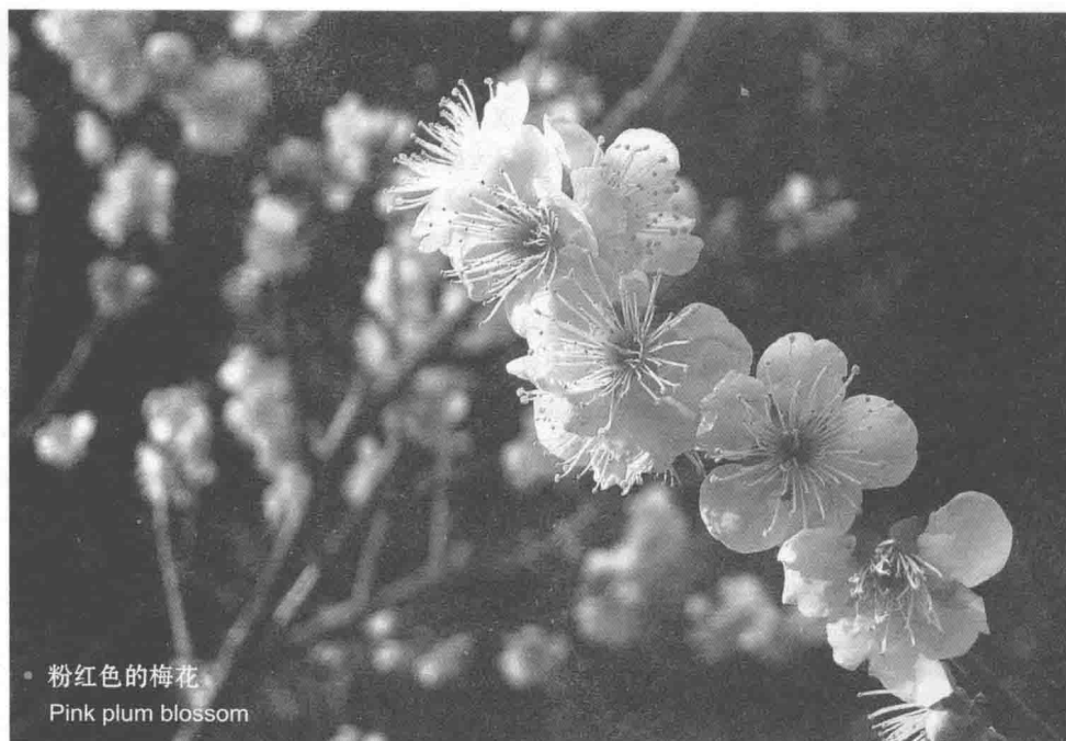
• 粉红色的梅花 Pink plum blossom