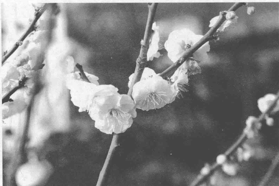
• 直枝梅花中的玉蝶梅 Upright jade butterfly plum blossom

Plum trees grow best in a warm and slightly humid climate, so people usually cultivate them around the Yangtze River and in the southwest of China. Although tradition has it that the plum can blossom defying cold and snow, still the plant has its own temperature range. Generally it cannot tolerate temperature lower than minus 15^{\circ}\text{C} — 20^{\circ}\text{C} ( 59^{\circ}\text{F} — 68^{\circ}\text{F} ), whereas its flowering needs an average temperature up to at least 6^{\circ}\text{C} — 7^{\circ}\text{C} ( 42.8^{\circ}\text{F} — 44.6^{\circ}\text{F} ).