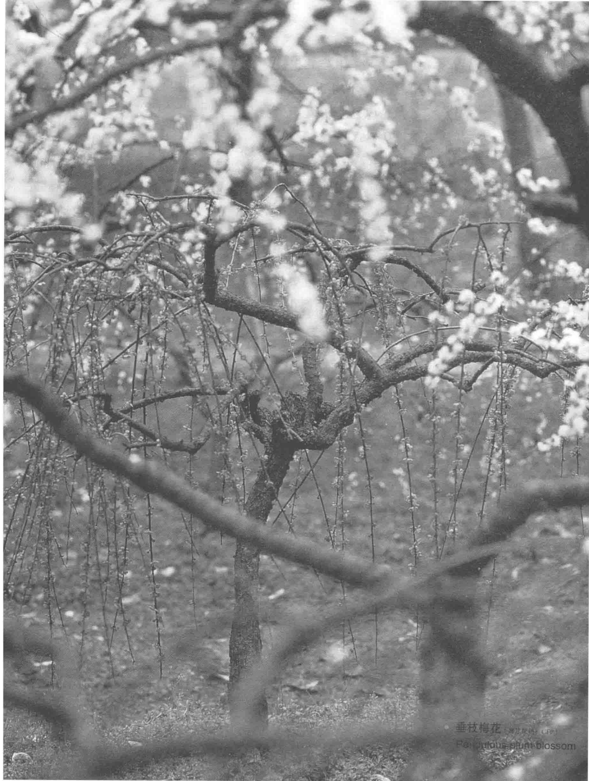
垂枝梅花 (Weeping plum blossom)