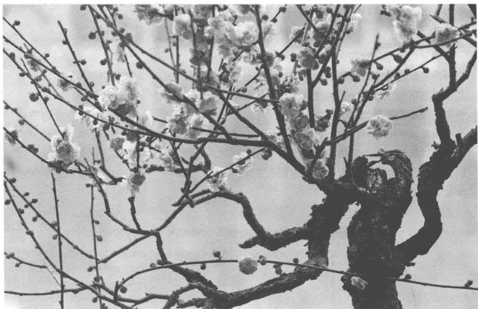
• 枝条扭曲的龙游梅 Tortuous plum with twisted branches

红梅等，用于食用；而花梅则以观赏为主，生长姿态各不相同。按照梅枝的姿态不同，花梅又可分为直枝类、垂枝类和龙游类三种。直枝梅是中国梅花中最常见、品种最多、变化最广的一类；垂枝梅的枝条自然下垂或斜出，形成独立的伞状树态；而龙游梅的枝条扭曲，姿态奇特，富有韵味。