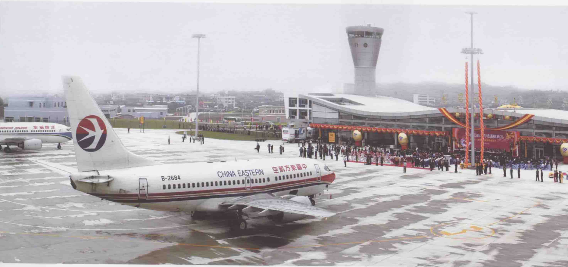
龙岩冠豸山机场 Longyan Guanzaishan Airport