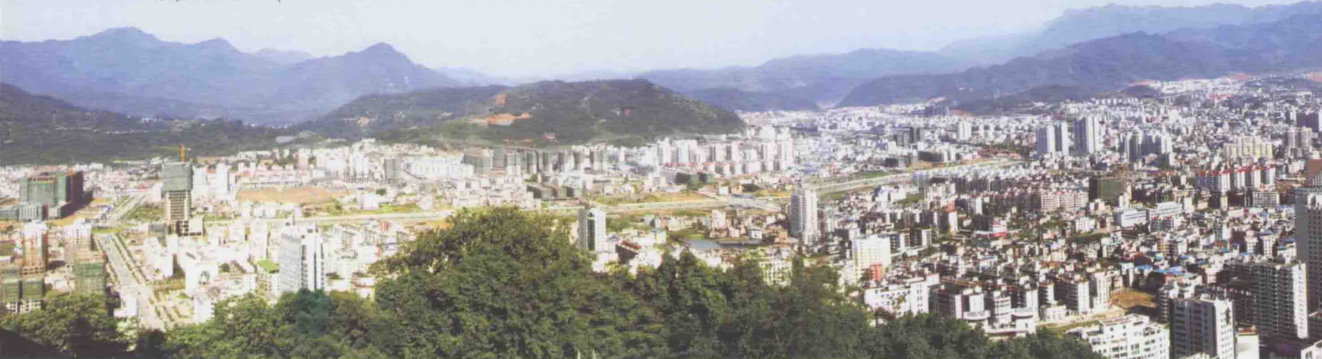
龙岩中心城市一瞥 A glimpse of Longyan City Centre

龙岩是一块红色的土地，英雄辈出、红旗不倒。 这里是当年中央苏区的重要组成部分，所辖7个县(市、区)均为中央苏区县，是全国赢得“二十年红旗不倒”光荣赞誉仅有的两个地方之一。毛泽东、周恩来、刘少奇、朱德、陈毅等老一辈无产阶级革命家都曾在这里从事过伟大的革命实践，毛泽东同志写下了《星星之火、可以燎原》、《才溪乡调查》等光辉著作，著名的红四军第九次党代会(古田会议)，是我党我军建设史上的重要里程碑。这里是红军长征出发地之一，当年十万闽西儿女踊跃参加红军，为新中国的建立作出了巨大牺牲和重大贡献。全市在册革命烈士23600多名，占全省烈士人数的一半多。1955—1965年间，闽西籍的优秀子弟中有68人被授予少将以上军衔，占福建省籍将军总数的82%，成为全国著名的“将军之乡”。这块土地诞生了陈丕显、邓子恢、张鼎承、杨成武等国家领导人。