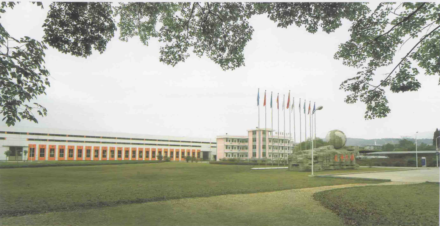
龙岩首家上市公司“龙净环保”花园式厂区 Longking Factory, the 1 st Listing Company of Longyan