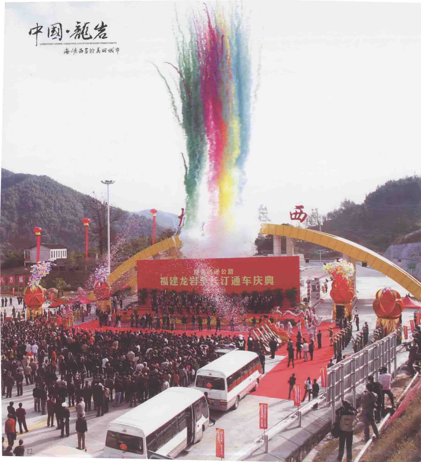
龙长高速公路2007年 12月通车庆典情景 Opening Ceremony of Longyan to Changting Expressway in December 2007