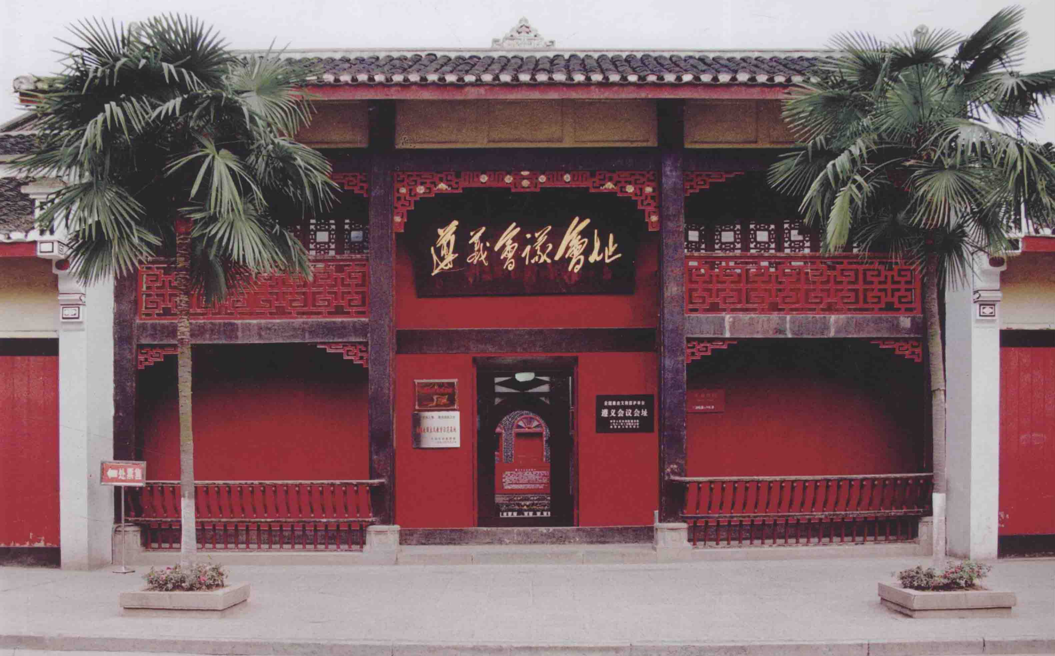
遵义会议会址大门 | The Gate of Zunyi Meeting Site