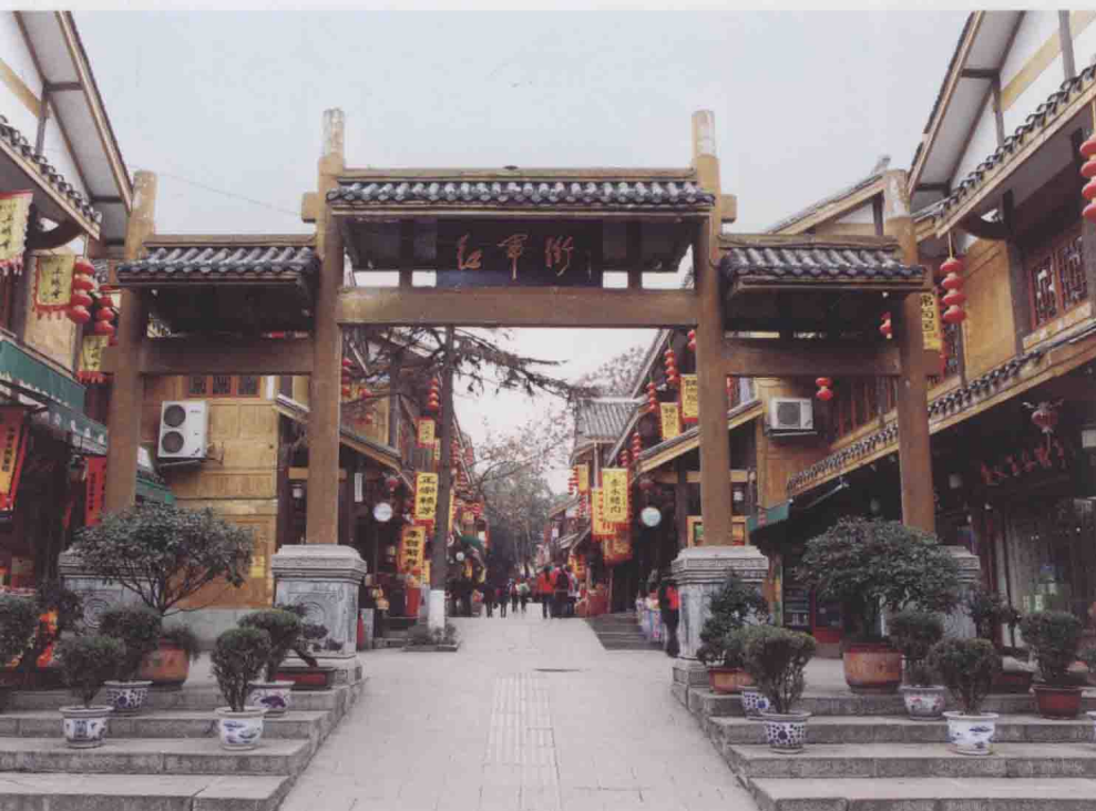
遵义红军街 Red Army Street

GouBa Meeting Site, Where held an important meeting. In March 1935, the Gouba conference was held at the New House by the Political Bureau of the Central Committee of the CPC, which marked Mao Zedong's leadership was consolidated.