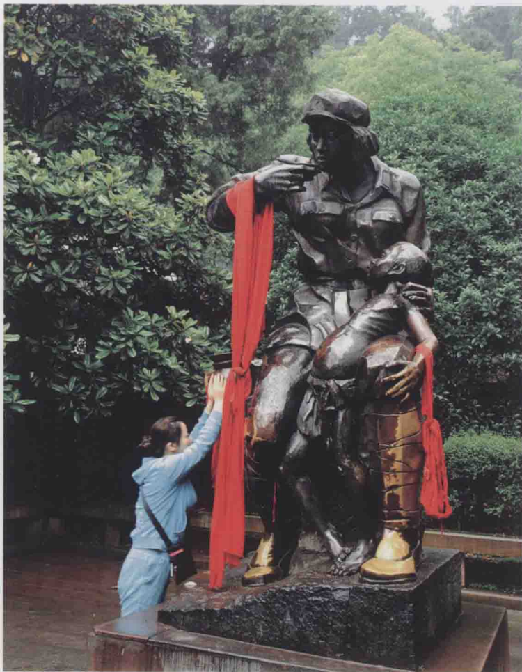
红军女卫生员塑像 Bronze statue, featuring a medical orderly in the Red Army treating a sickly child