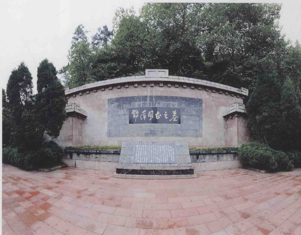
遵义红军烈士陵园内的邓萍（红3军团参谋长，长征途中牺牲的红军最高级别将领）之墓 Dengping's tomb, who was the famous gengeral during the Long March