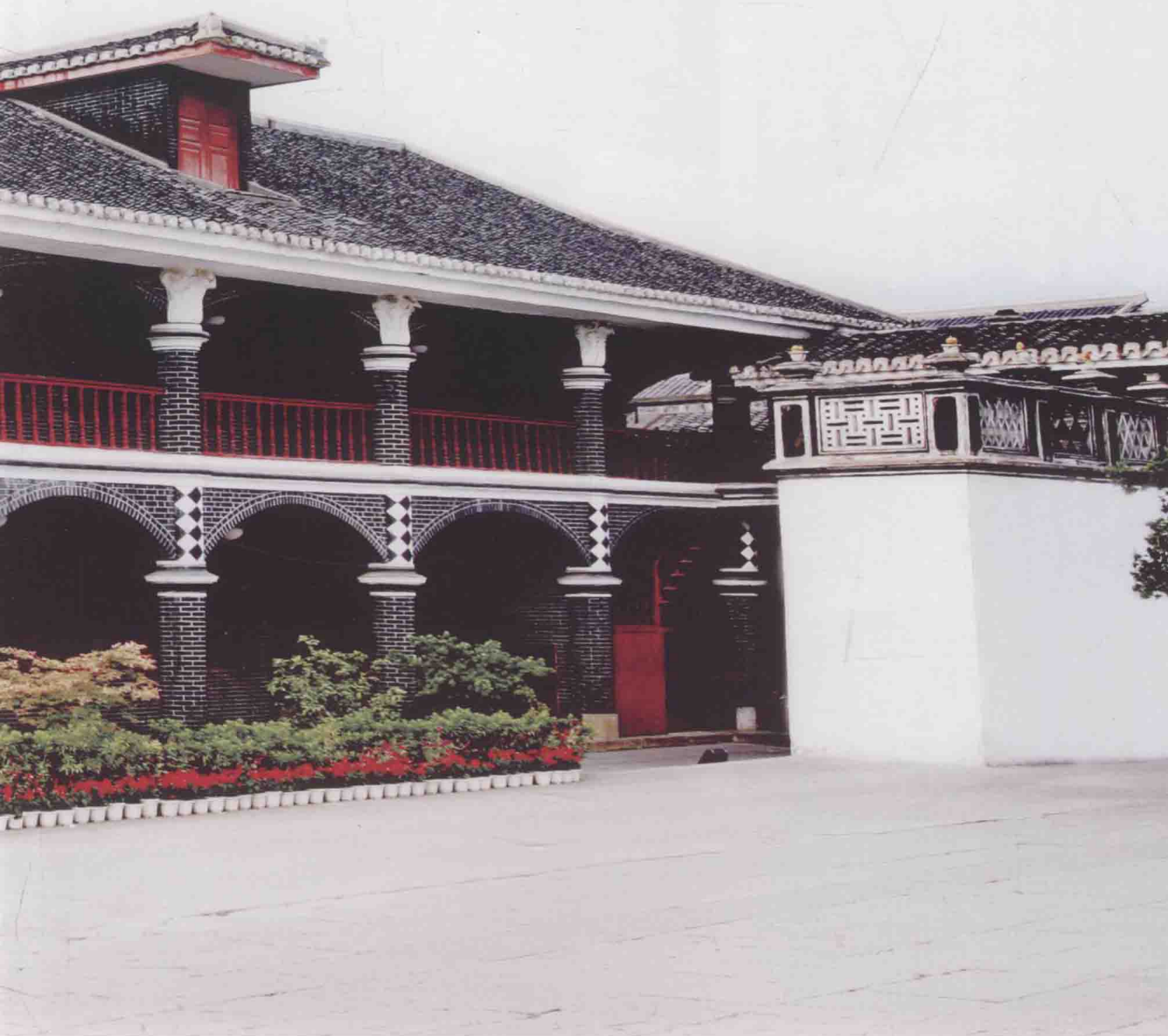
遵义会议会址 | Zunyi Meeting Site