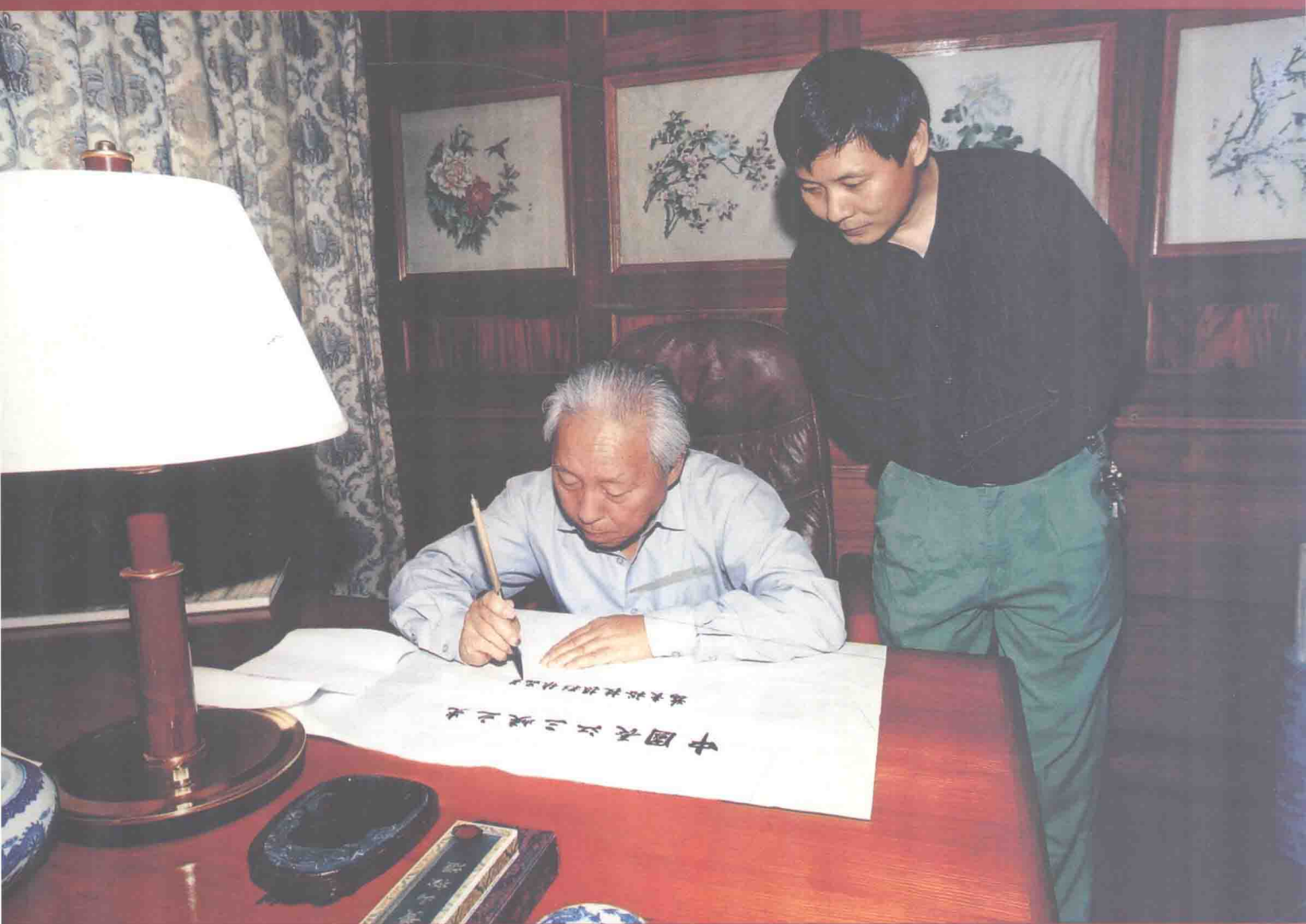
全国政协副主席杨汝岱在宜昌桃花岭饭店为作者题字 The vice president of Chinese People's Political Consultative Conference Yang Rudai was signing for author at TaoHuaLing Hotel in Yichang