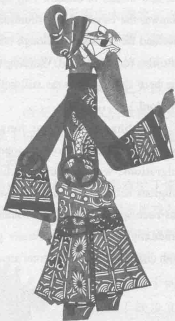
• 老生人物（河北省唐山市） Senior Main Male ( Lao Sheng ) Figure (Tangshan City, Hebei Province)