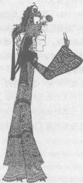
• 妖旦（陕西省富平县） Demon Female ( Yao Dan ) Figure (Fuping Prefecture, Shaanxi Province)

can be used in all kinds of plays. A complete shadow figure is generally composed of 11 parts ranging from the head, arms (upper arms and forearms), hands, body, legs (with the upper parts substituted by the dress or skirt, and the lower parts connected with the feet) and so on. Since the shoulder joints, elbow joints, wrists, knees and the waist are all movable, the performance is lifelike. The shadow figures are cast in various characters according to the content of and roles in the script. Different places have developed their own styles, making the repertoire of the shadow figures rich and colorful.