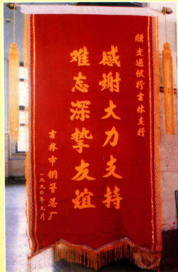
客戶贈送錦旗 Silk banner of award sent by the customers