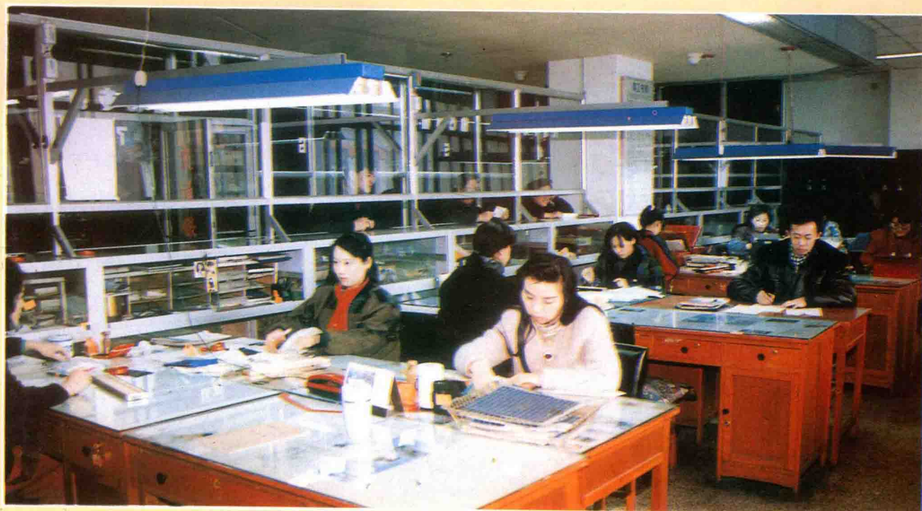
船營辦事處 Chuanying Office