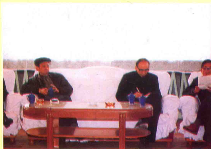
► 中共吉林市委書記吳廣才（左三）副市長李萬良 （左二）原中共吉林市委書記方建宇（右一）來行視察。

Liu Zhenxin, deputy mayor of Jilin City, inspecting the work