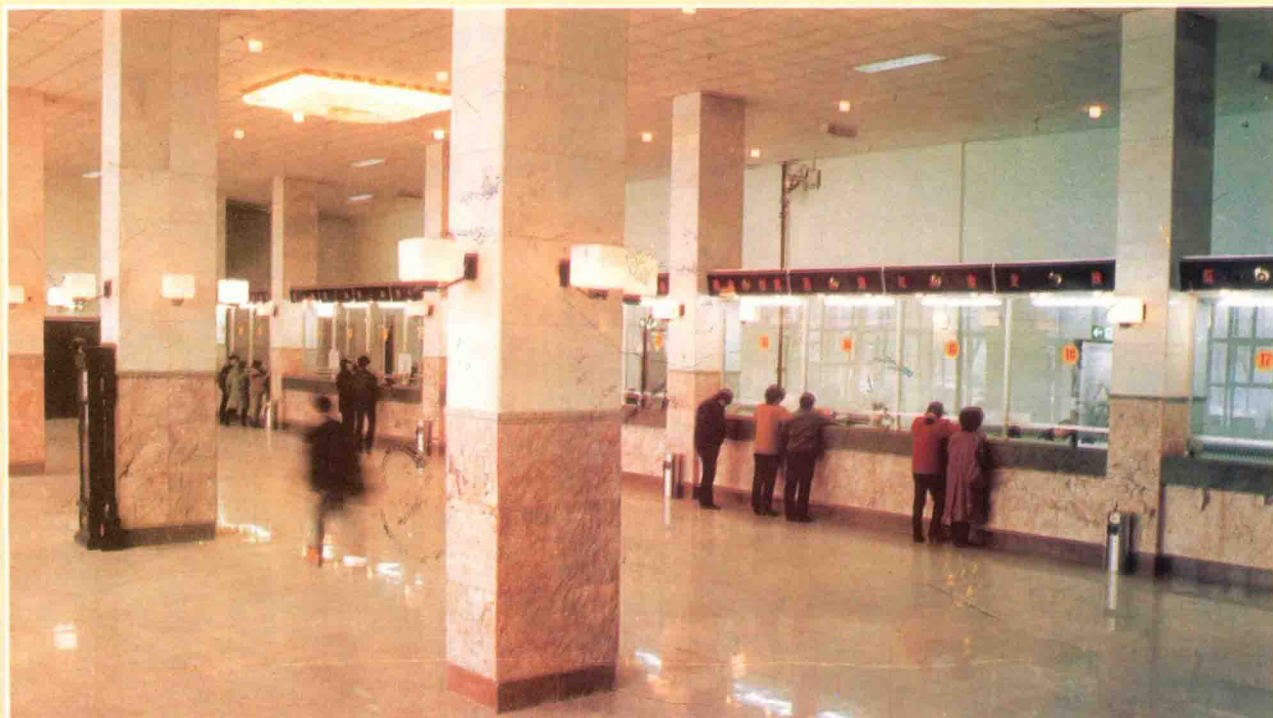
吉林分行營業大廳 The branch bank's business hall