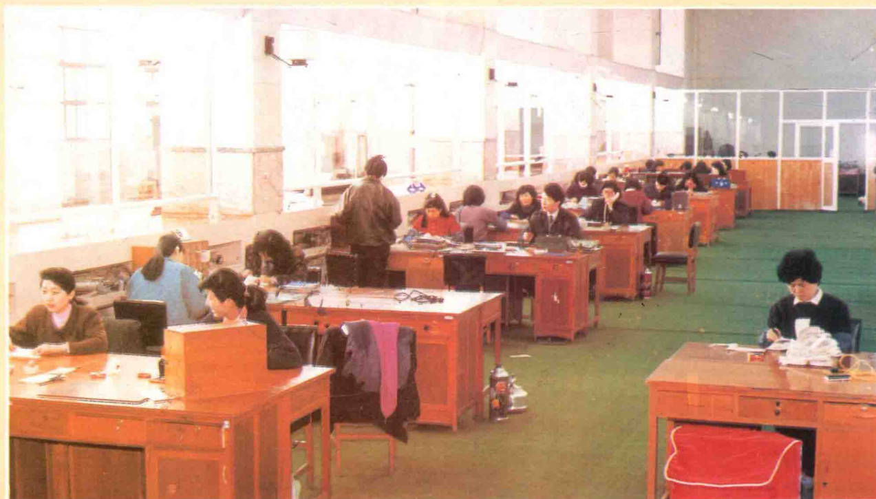
營業人員正在緊張的工作 Bank clerks busy at the work