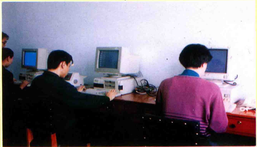
微機結算 Computerised settling accounts