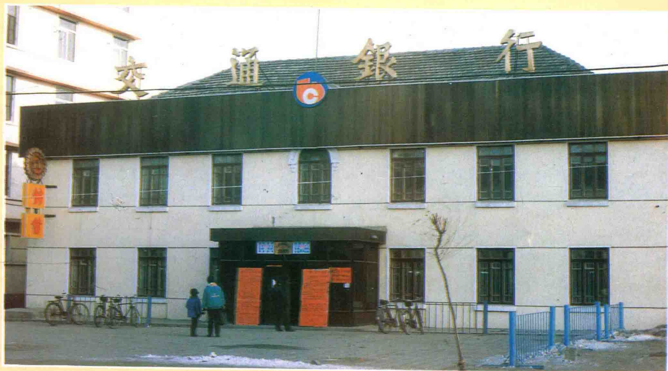
龍潭辦事處 Longtan Office