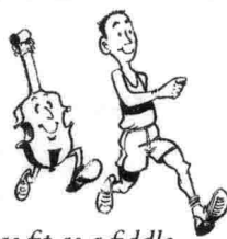
as fit as a fiddle