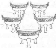
卿大夫五鼎 Officers' Five Tripods