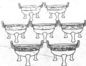
诸侯七鼎 Seigneurs' Seven Tripods