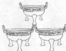
士三鼎 Bachelors' Three Tripods