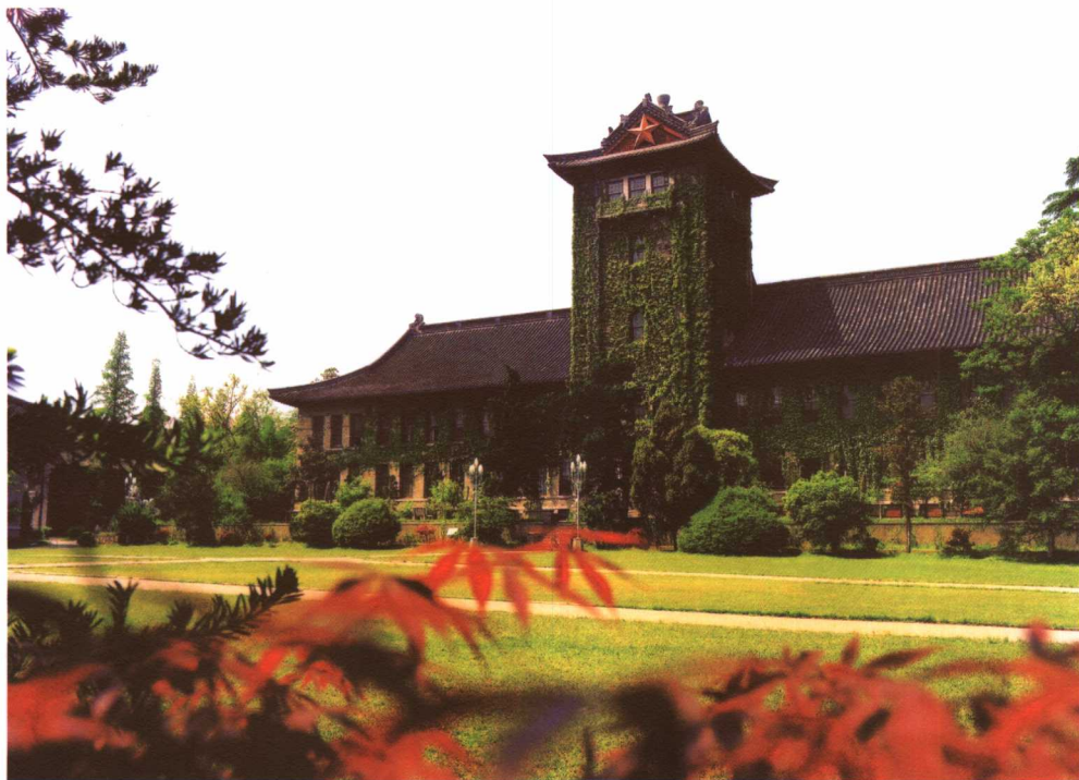
北大楼,建于1919年,南京大学标志性建筑。 The Northern Building was put up in 1919 as the symbolic architecture of Nanjing University.