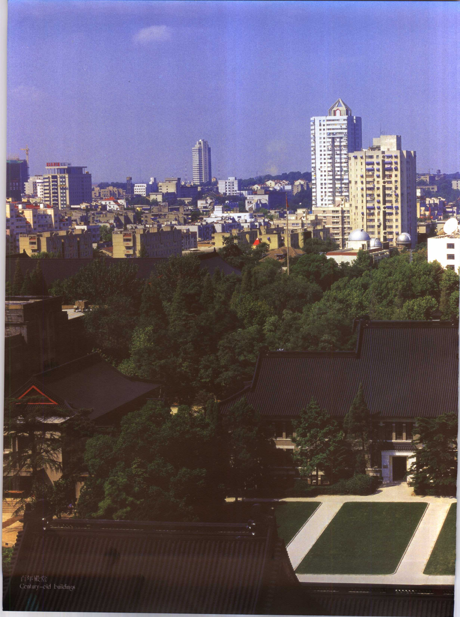
百年殿堂 Century-old buildings