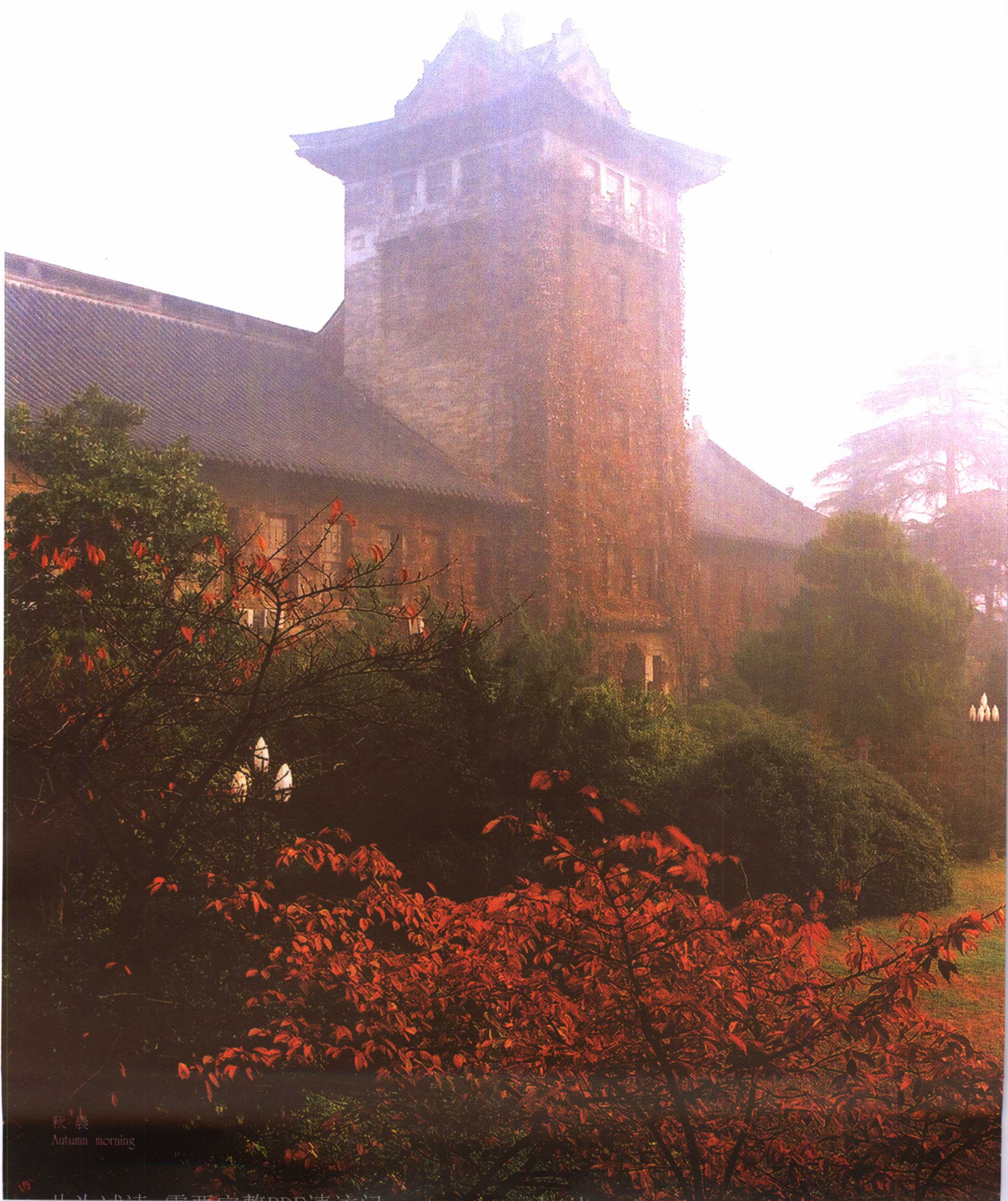
秋晨 Autumn morning