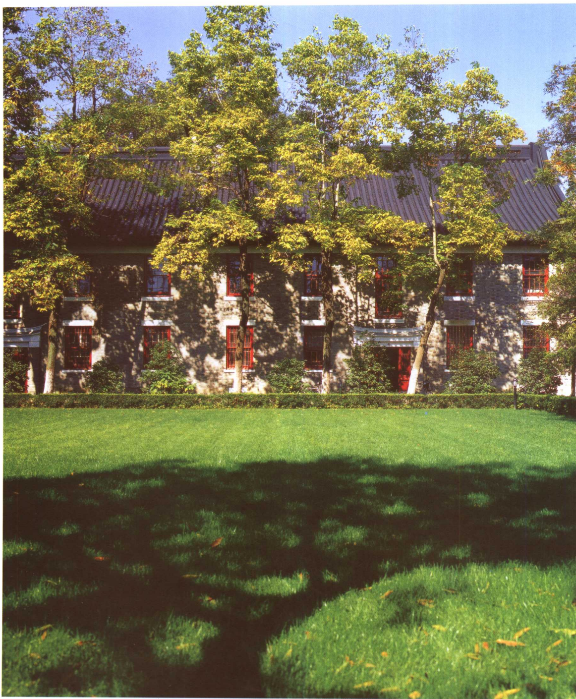
仲夏魅影 Midsummer view