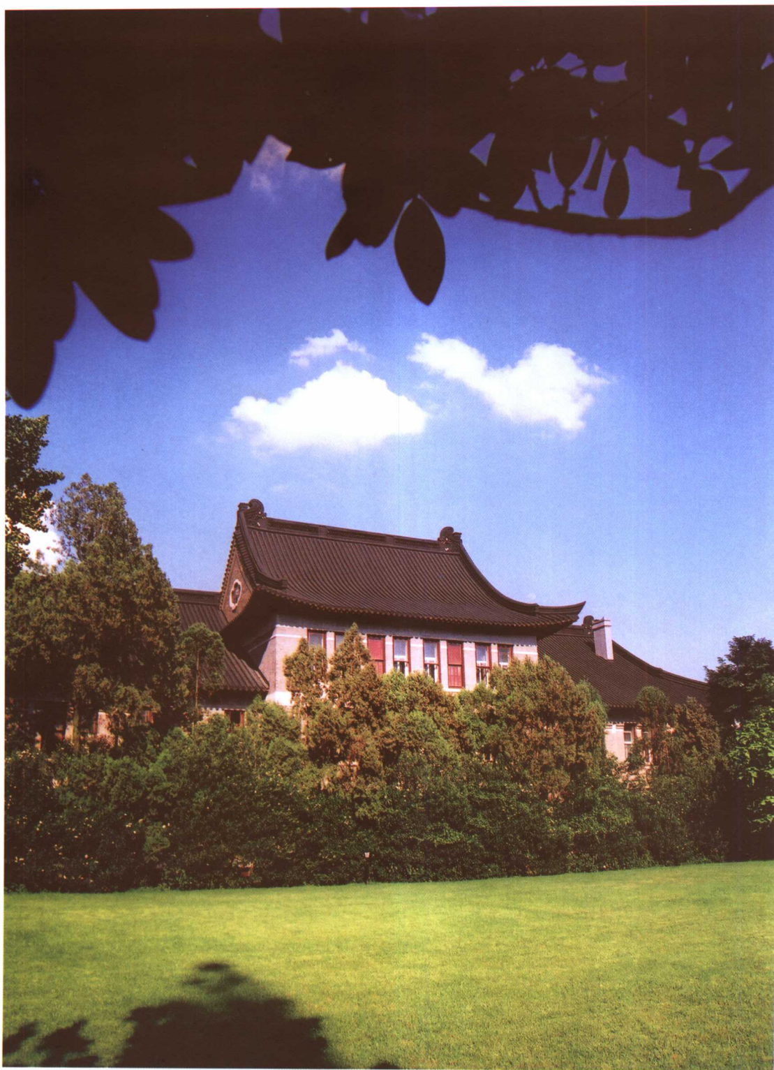
云上西楼 Clouds over the western building