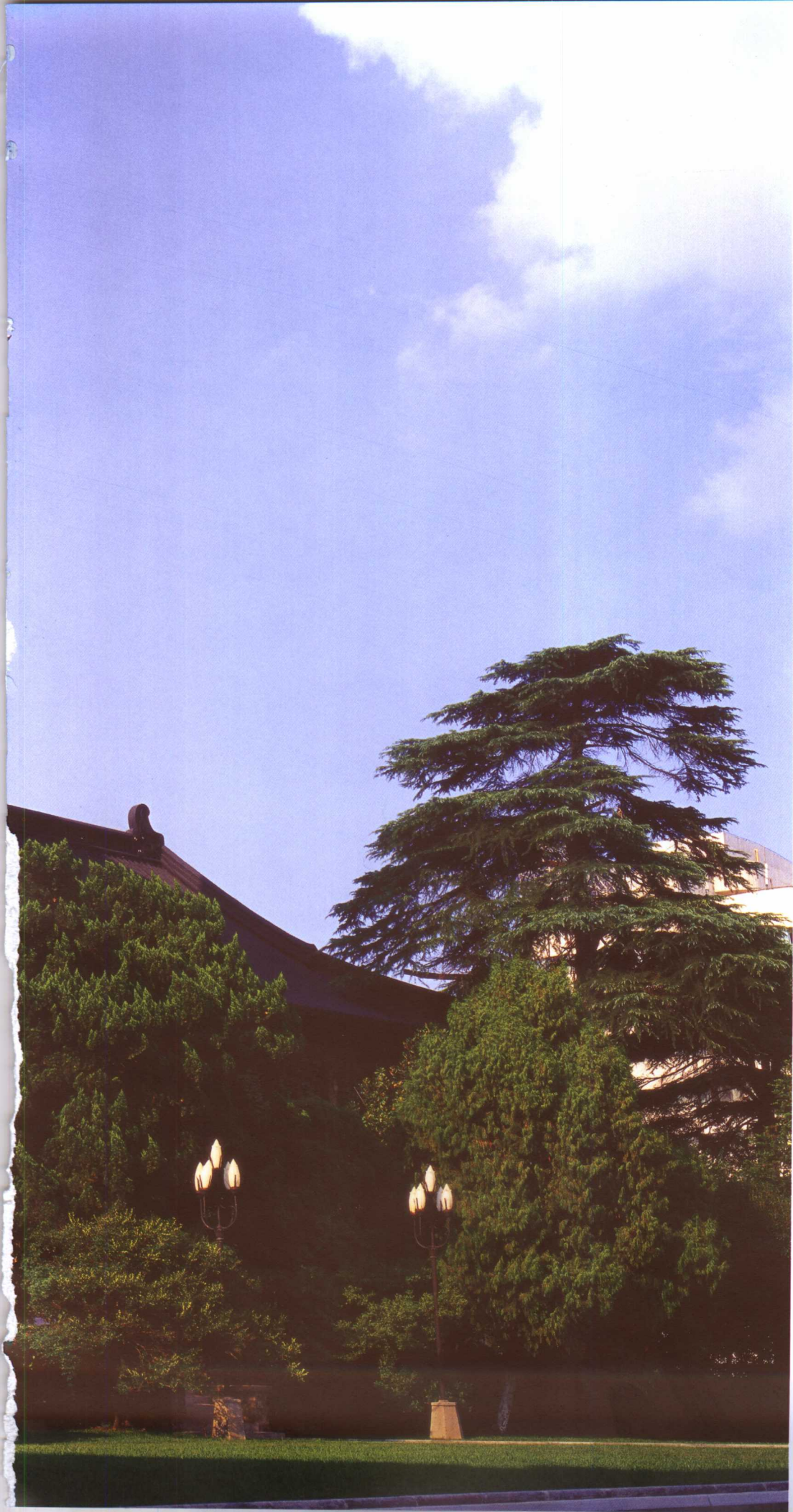
顶苍穹,披青萝。 With the vault of heaven and blue sky overhead.