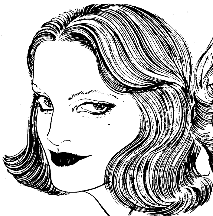
27 頭髮中長，由自然中分線向兩側電作軟滑的大波浪形。風度嫵淑。 Soft wavy hair for medium-length, flicks slightly around edges.