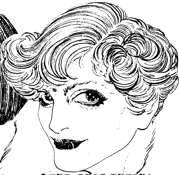
2 短髮型, 靠側分界, 兩鬢部分鬆曲。 豐容雅量, 風姿可人。 Hair is cut short, and permed for volume on sides of head.