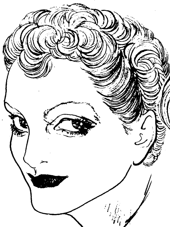
17 大量髻曲之幽雅型式，兩鬢以髮夾直線地定止。 Cute short style with mass of curls.