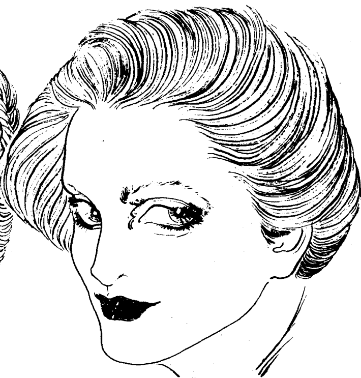
18 髮勢上捲柔美而雅致。 Elegant off-the-face style for evening.