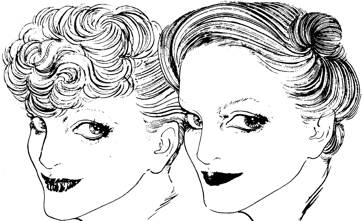
21 前額電髻，蓬鬆隆起，髻部平滑梳刷向後，形成強烈對比，柔中帶剛，紅粉而帶男子氣的髮型。 Hair is smoothly swept back at sides with soft curls tumbling on to forehead.