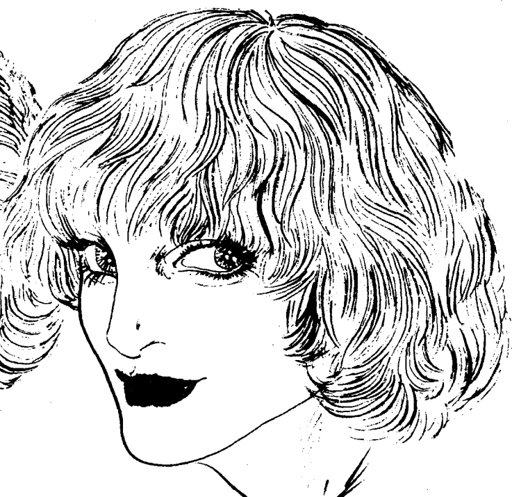
20 用輕淺電法電成微曲，髮長度中等，自然風乾後，呈野烈粗獷之狀。 Medium-length Coupe-Sauvage with gentle perming. Left to dry naturally.