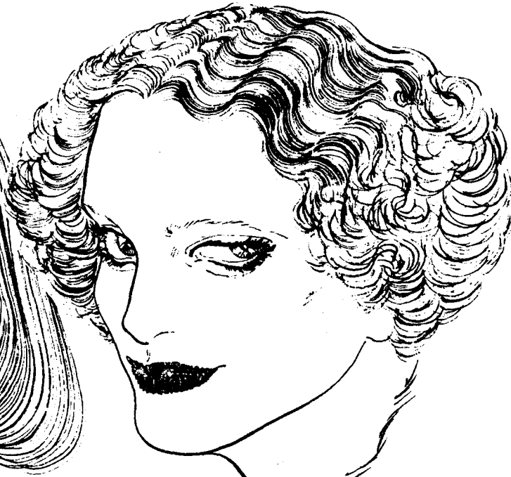
4 中分界, 向兩側作手指式捲髮電髮, 造成豐滿鬆柔的形狀。 Hair is gently waved from part into a fluffy sides.