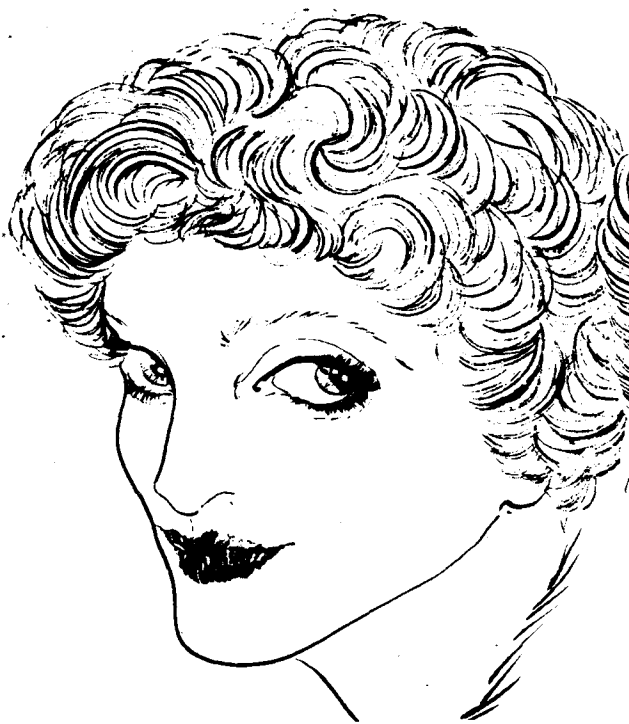
25 作短緣邊層修剪，電成全部鬢曲，是為短鬢髮型，平日梳理容易。 Short layered hair given pretty perm, and left to dry naturally.