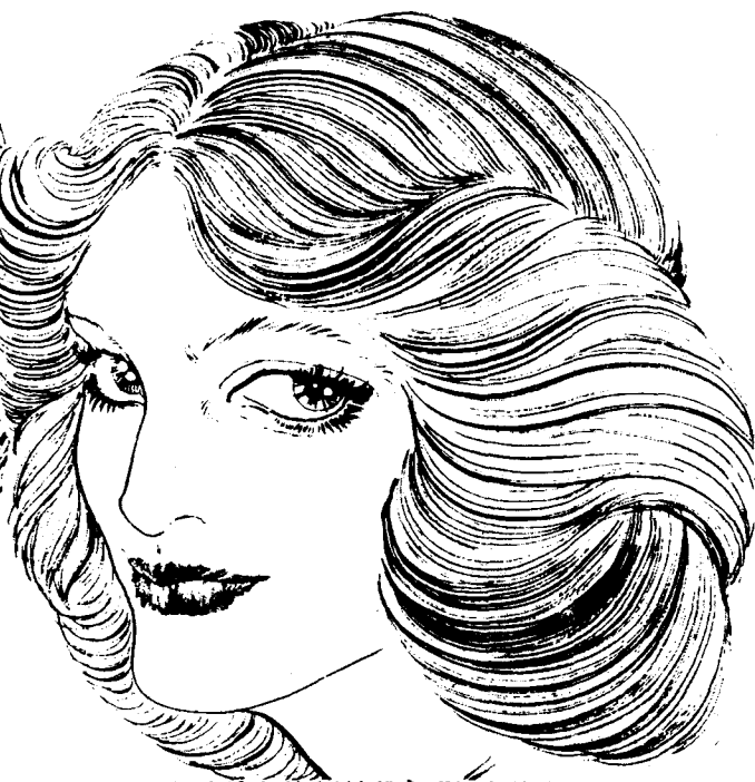
26 這是兩鬢向後側攙撥的鬢髮形狀，攙撥部分電作柔曲，柔軟輕盈。 Pretty flicked-back style is created on a bob shape.