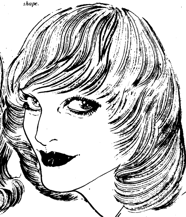
28 直髮的粗簾散髮型，作輕淺電曲，自然風乾後，全部刷向前方。 Coupe-Sauvage for medium-length. Hair has been lightly permed and left to dry naturally.