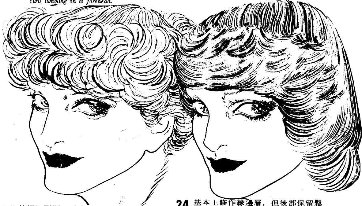
23 前額經兩鬢至後方，全部電髻曲，但頭頂部分，則作平順的姿態。 Pretty curls for soft halo, crown is keep smooth.