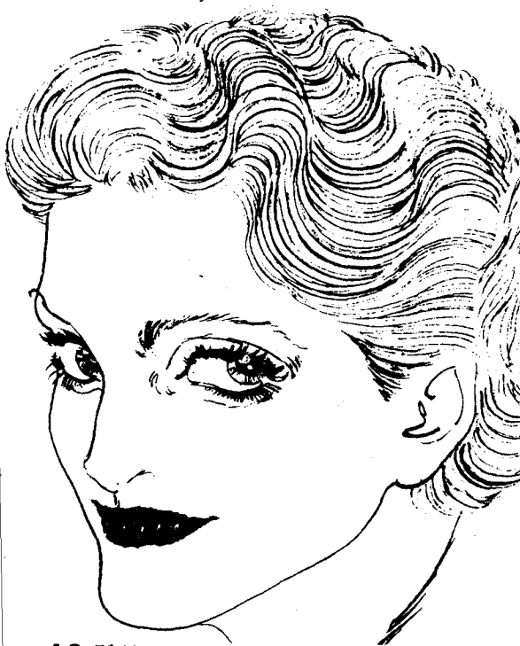
19 髮勢反覆髻曲，向後宛轉呈流波形態，柔美標致。 Chic hair style, waved-away from the face design.