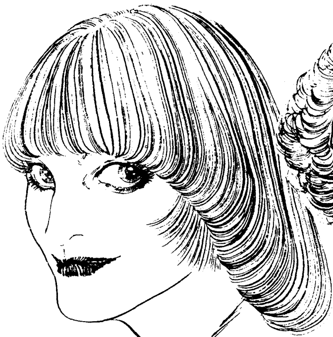
3 中長度侍童 (Page Boy) 型。髮 角一縷分束修剪, 增加魅力。 Beautiful page-boy with dramatic side- burns.