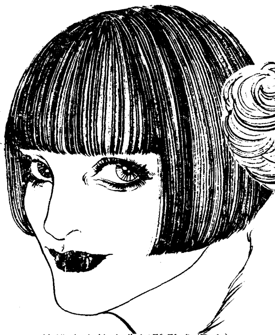
1 簡樸大方的古典短髮髻式 (Bob), 適合各種時代, 容易梳理。 Sleek classic short bob. Keeping popular, through all ages.