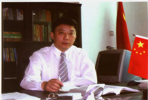
徐恒书记 Xu Heng, the secretary of the party committee