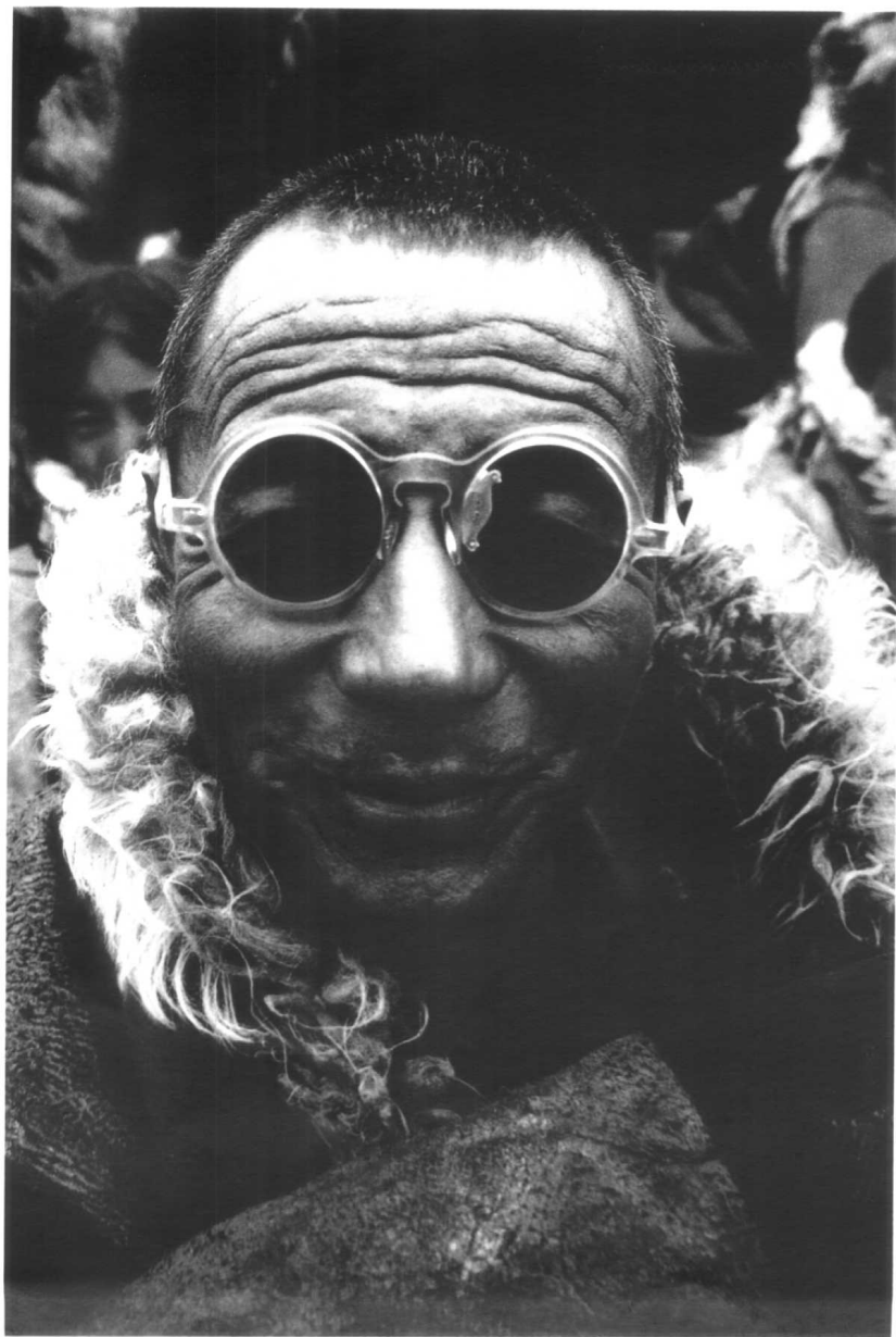
《注视》1986 EYES AND WRINKLES