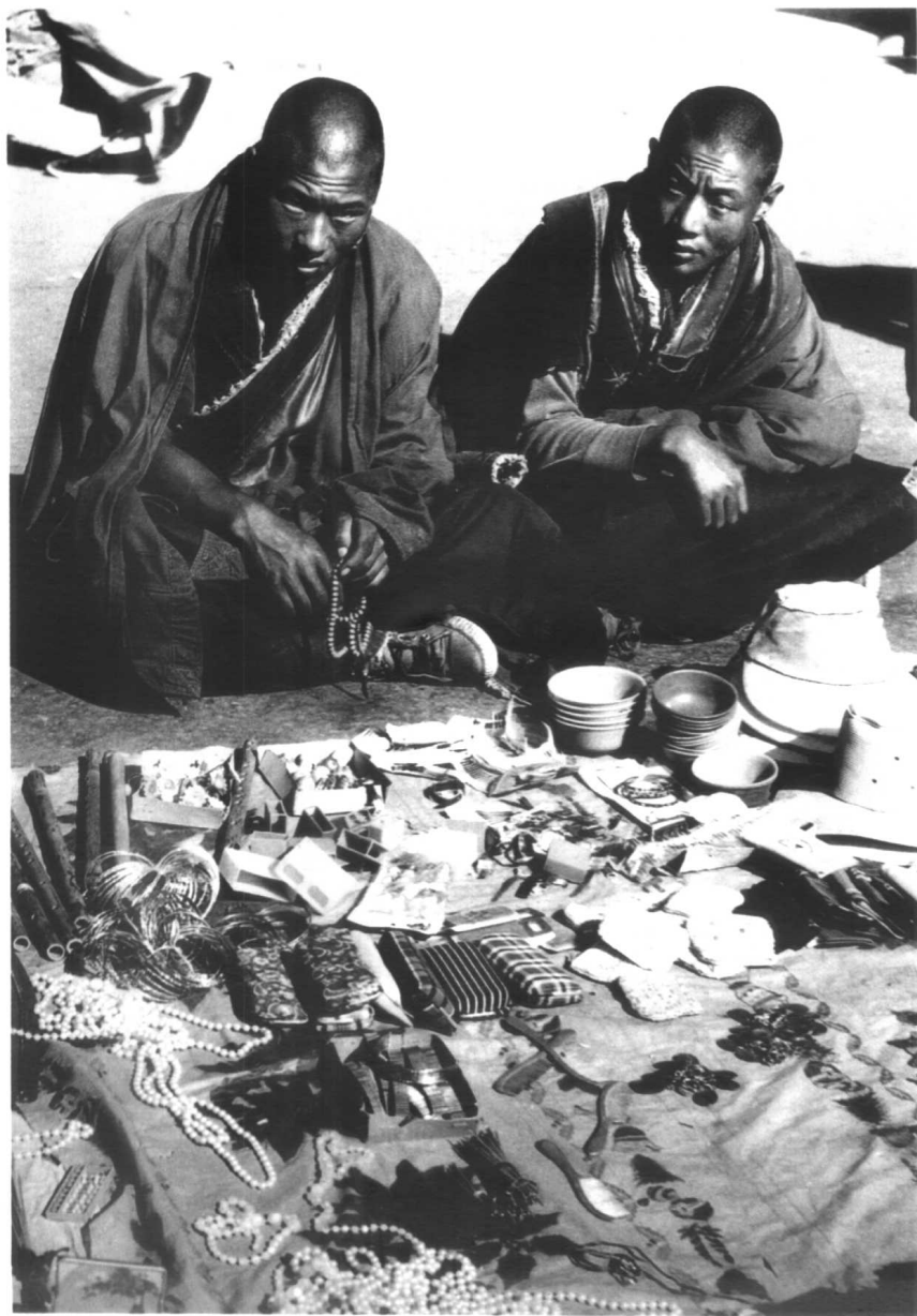
《小摊》1986 VENDORS AND STAND