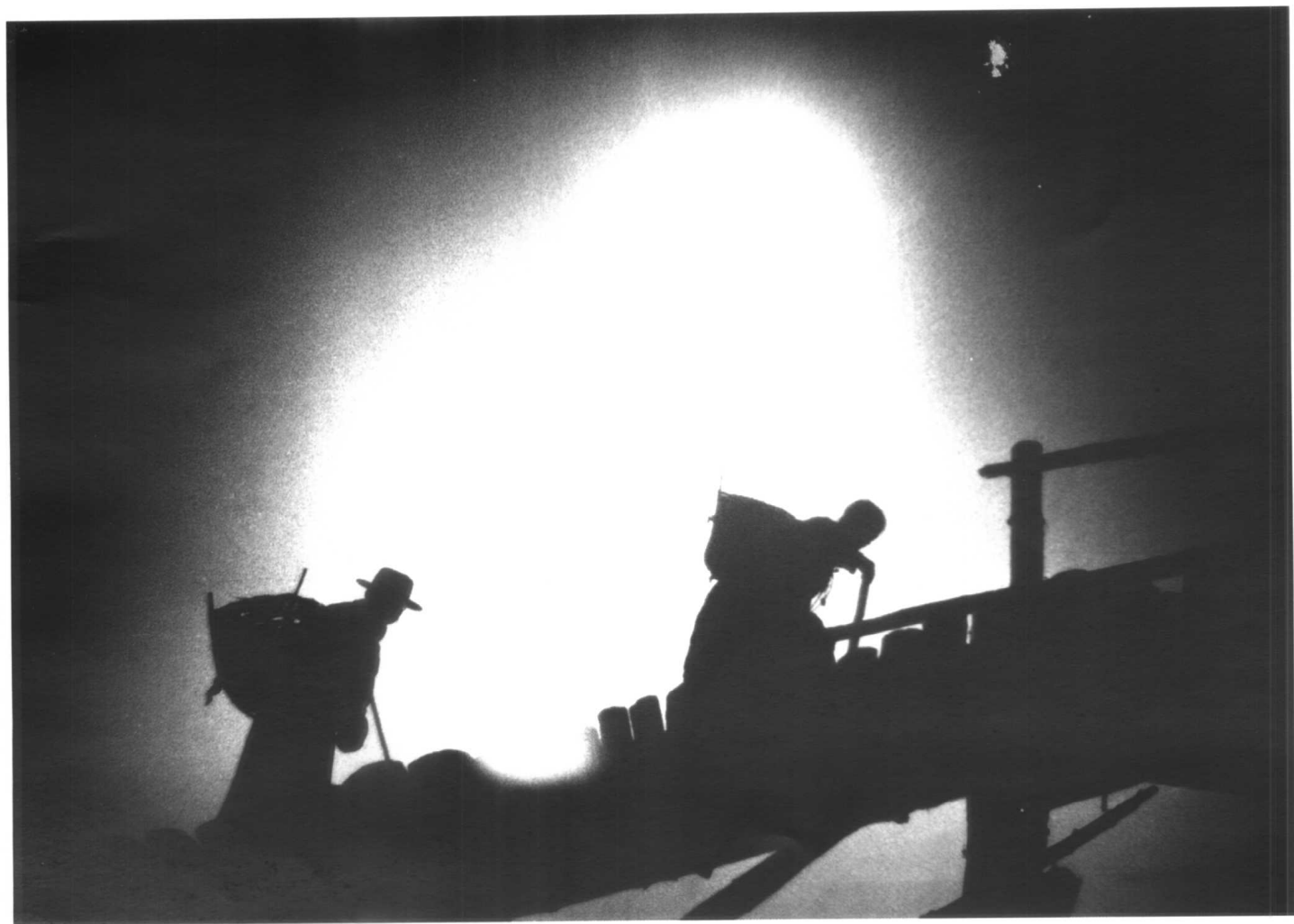
《高原之光》1986 LIGHT OF THE PLATEAU