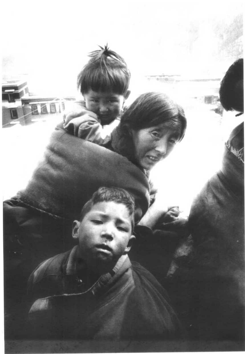
《母子》1986 MOTHER AND CHILD