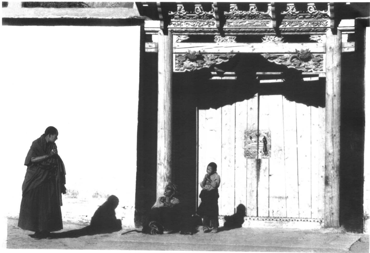
《阳光下》1986 SUNLIGHT AND SHADOW