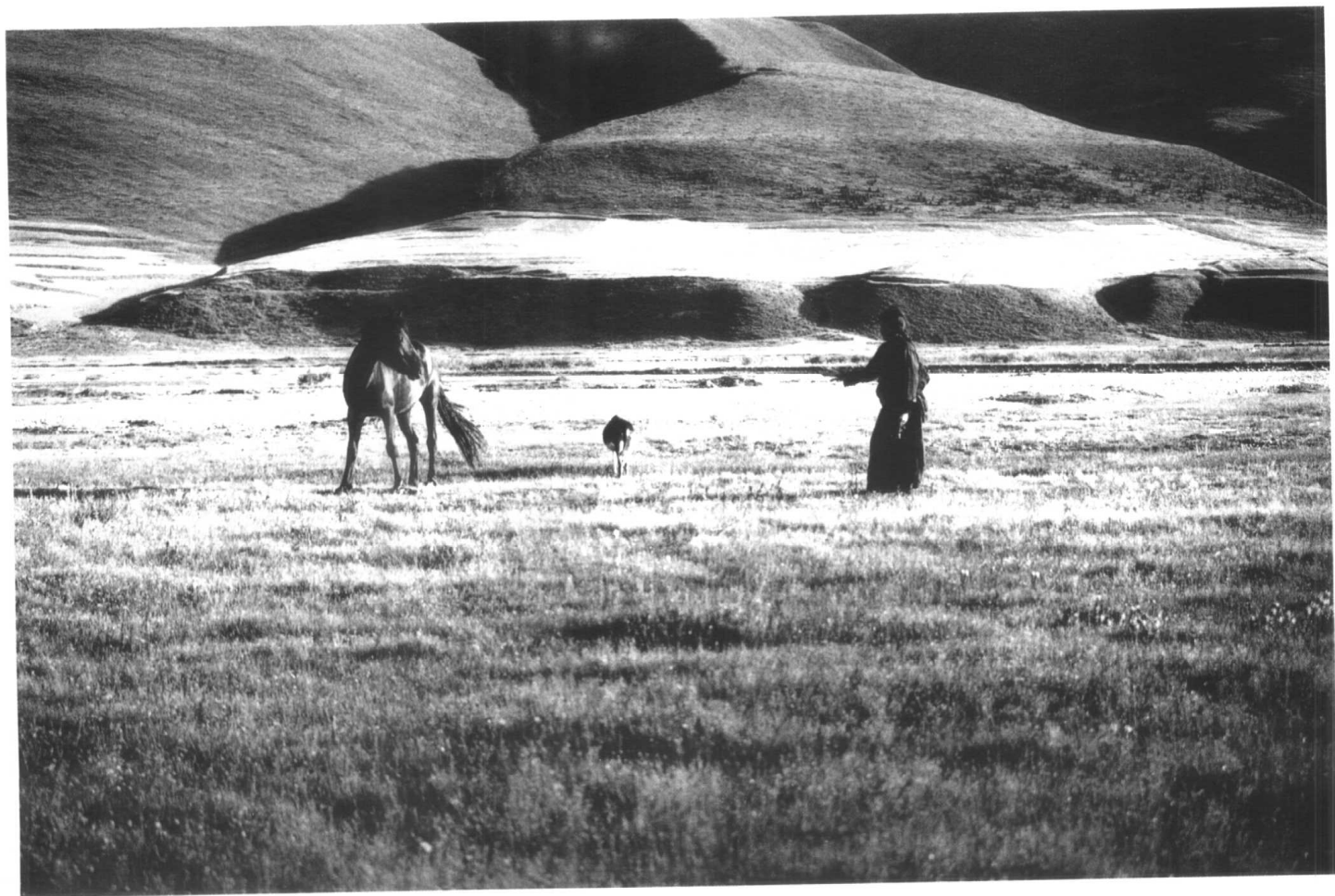
《高原牧民》1986 HERDSMAN ON THE PLATEAU