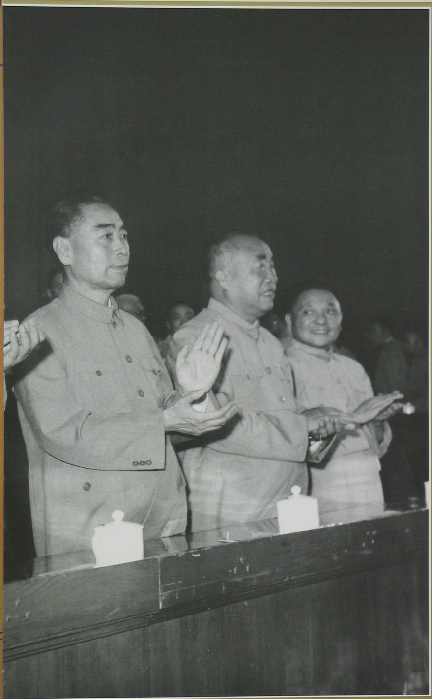
Mao Zedong, Liu Shaoqi, Zhou Enlai, Zhu De and Deng Xiaoping (from left) at the 9th National Congress of the Communist Youth League of China. (1964)