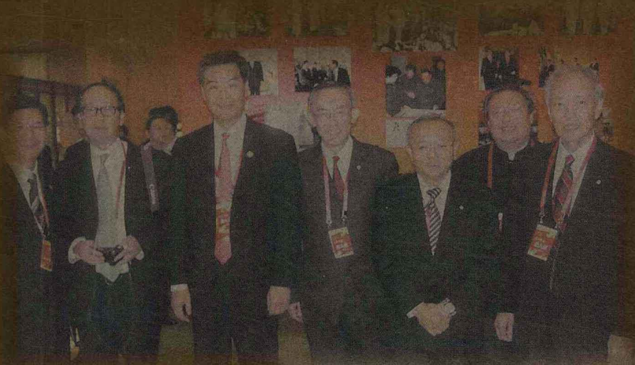
節日留影 Precious photo memories