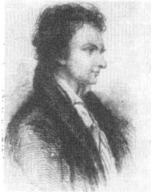
William Hazlitt, self-portrait, ca. 1802

fashion paralleling the course of Romantic poetry. Like the poets, the essayists are personal and subjective; their essays are often candidly autobiographical, reminiscent, self-analytic; the material is reflected in the temperament of the essayist. The subject matter of the essays, like that of poetry, exhibits an extension of range and sympathy for what is beyond the earlier limits of the leisure class and its fashionable concerns. The most important English essayists of this period are William Hazlitt 1 , Leigh Hunt, Thomas De Quincey 2 and Charles Lamb.