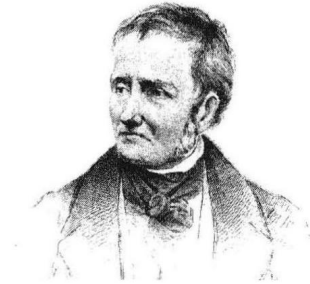
Thomas De Quincey