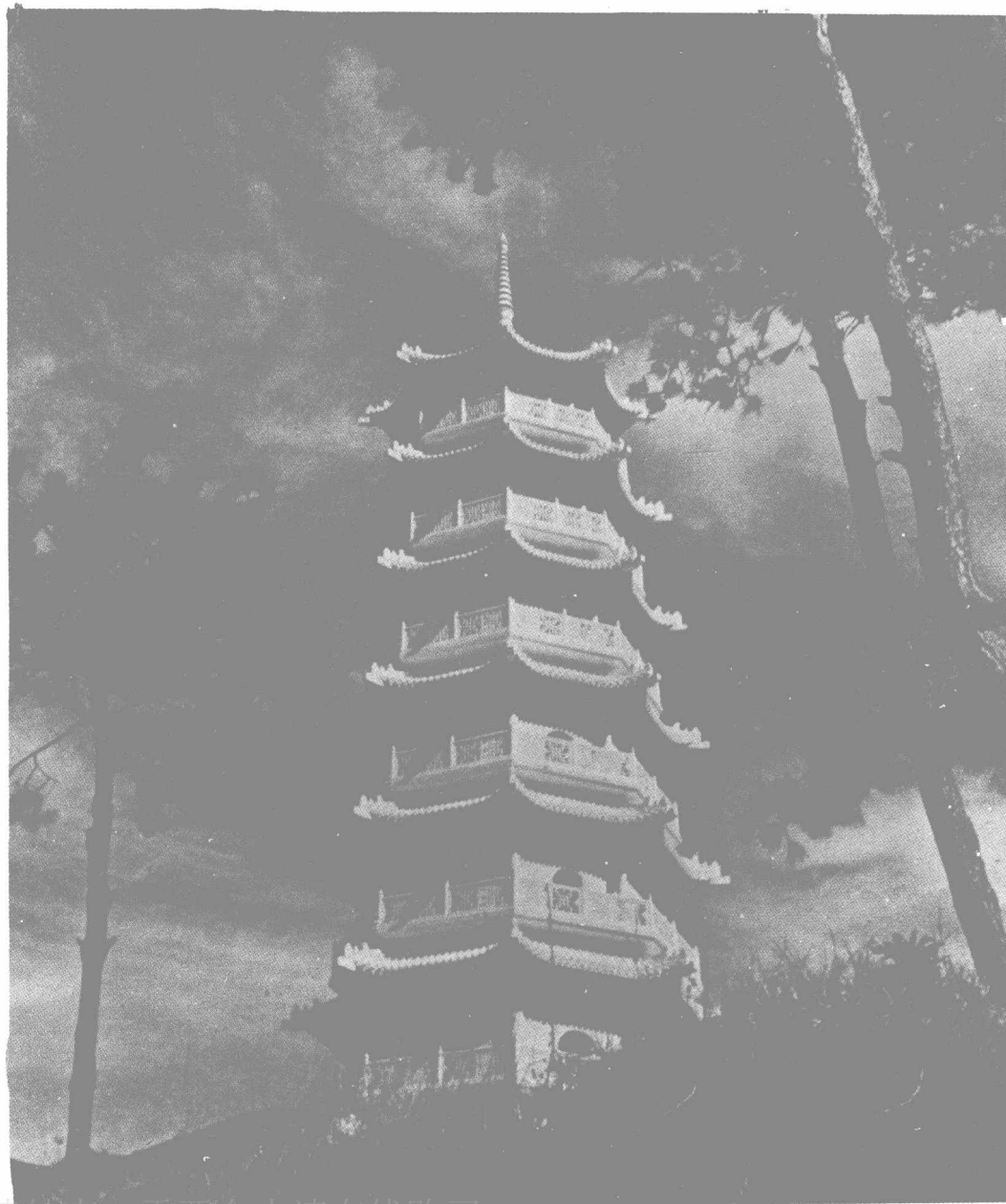
· 白 塔 (Pagoda)