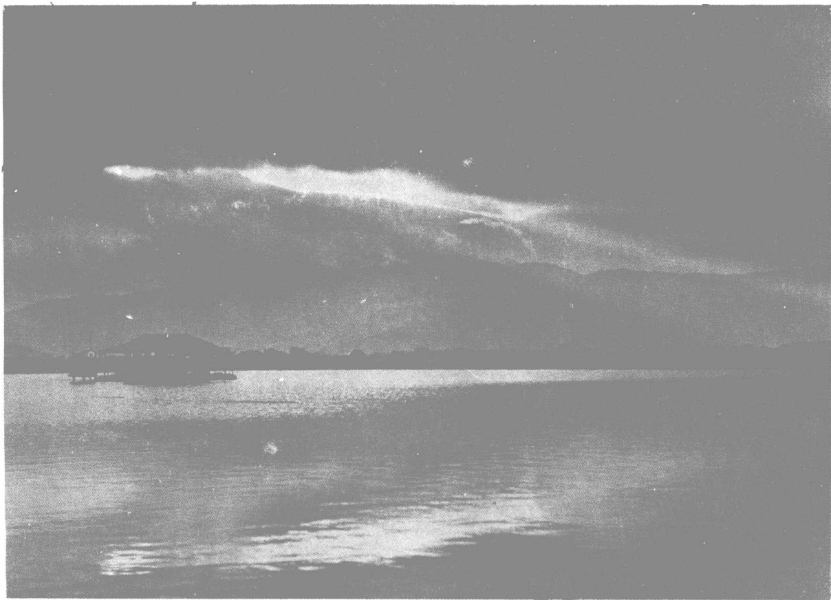
漁村初曉 ( The Break of Dawn )