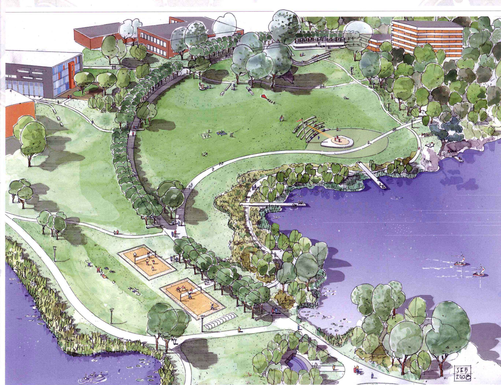
Rendering | 效果图