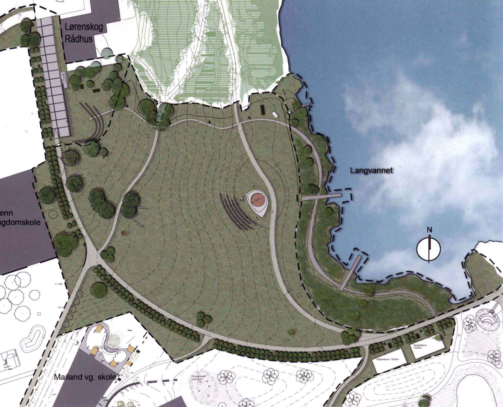
Site Plan | 平面图