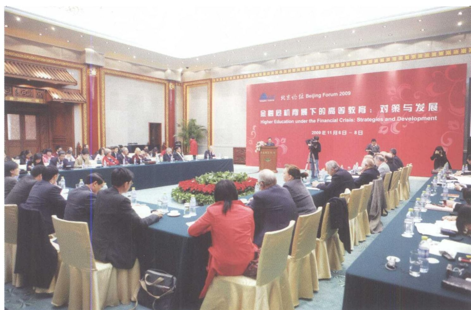
Panel Session on “Higher Education under the Financial Crisis: Strategies and Development”