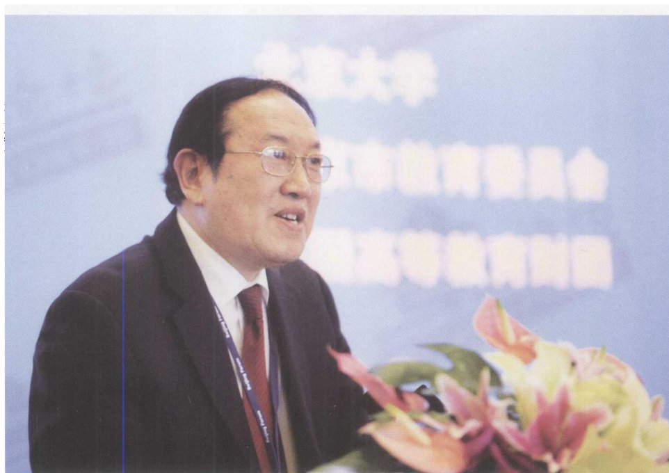
Mr. Jiang Shusheng, Vice Chairman of the Standing Committee of the National People's Congress of the P. R. China at the Opening Ceremony of Beijing Forum 2009