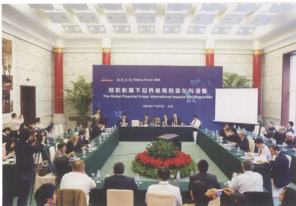
Panel Session on “The Global Financial Crisis: International Impacts and Responses”