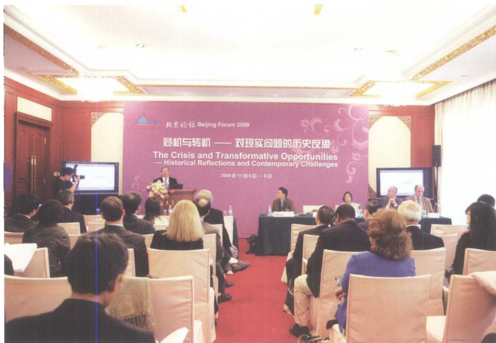
Panel Session on “The Crisis and Transformative Opportunities —Historical Reflections and Contemporary Challenges”