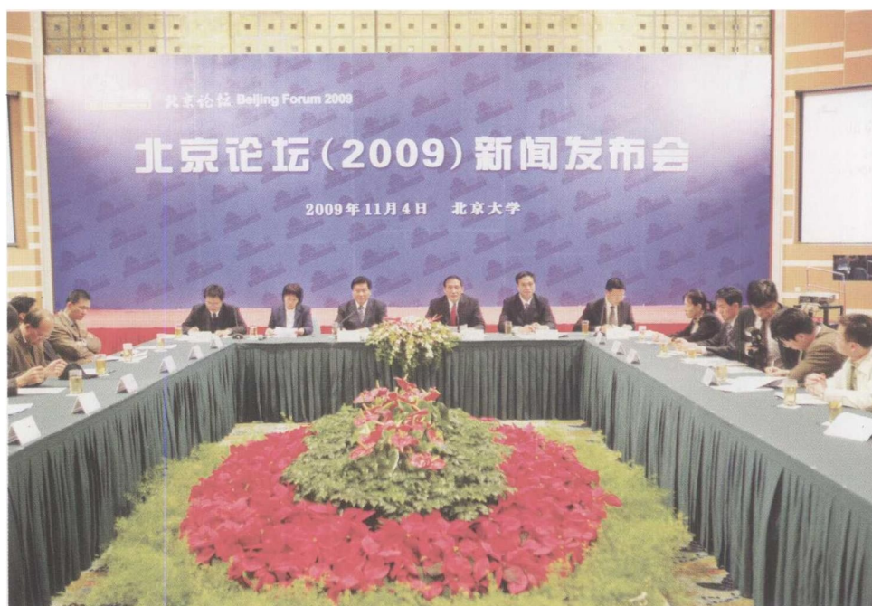
The Press Conference of Beijing Forum 2009