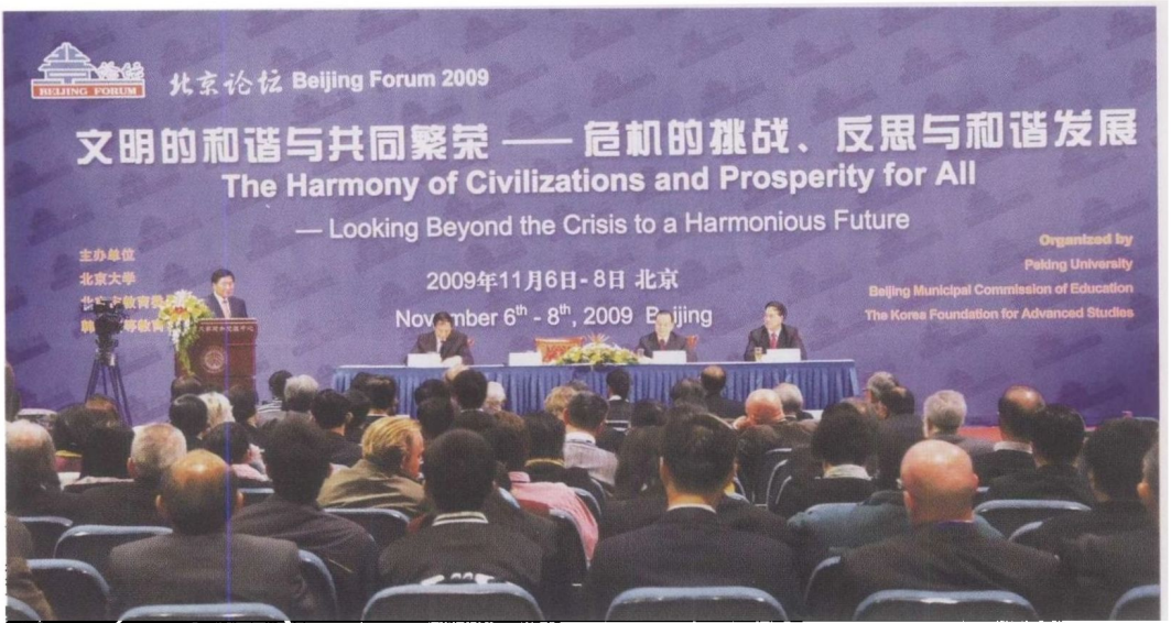
The Closing Ceremony of Beijing Forum 2009