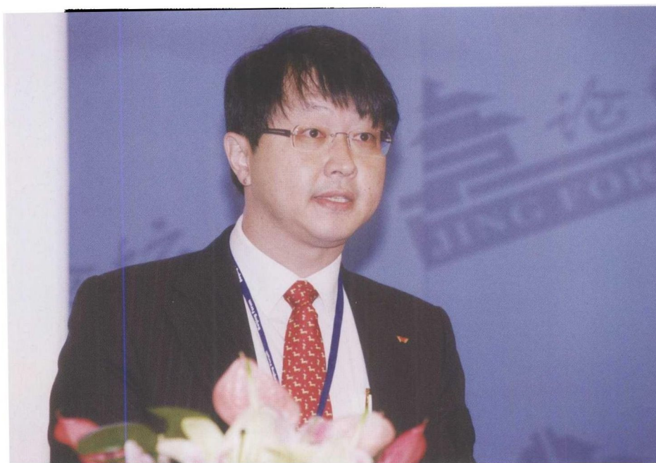
Mr. Chey Jae-won, Vice Chairman of SK Group at the Opening Ceremony of Beijing Forum 2009