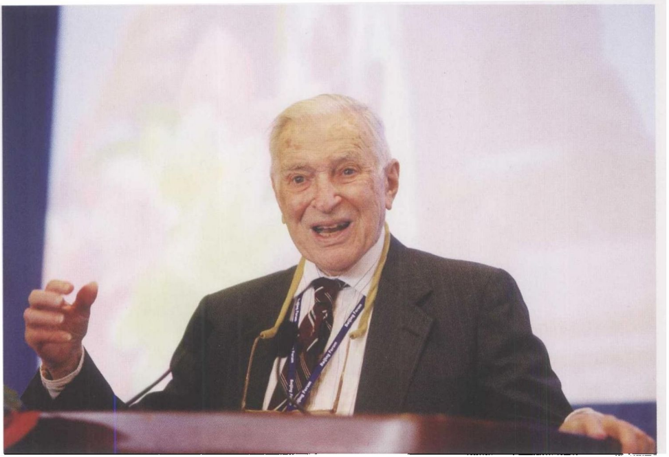
Nobel Prize Laureate Kenneth Joseph Arrow, Professor Emeritus of Stanford University at the Opening Ceremony of Beijing Forum 2009