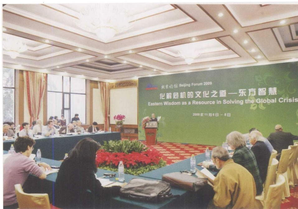
Panel Session on “Eastern Wisdom as a Resource in Solving the Global Crisis”