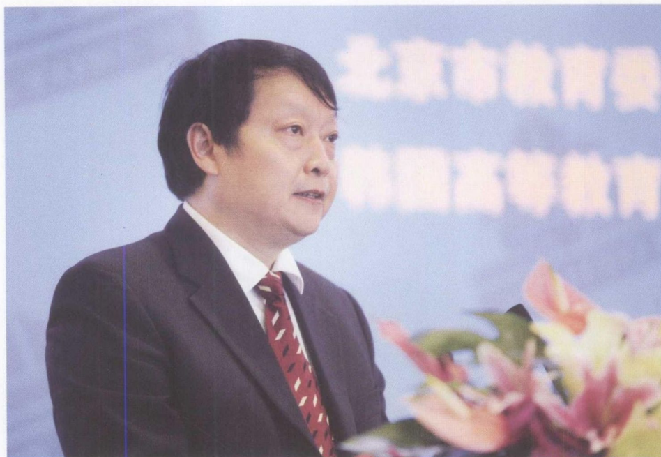
Mr. Huang Wei, Vice Mayor of Beijing Municipal Government at the Opening Ceremony of Beijing Forum 2009