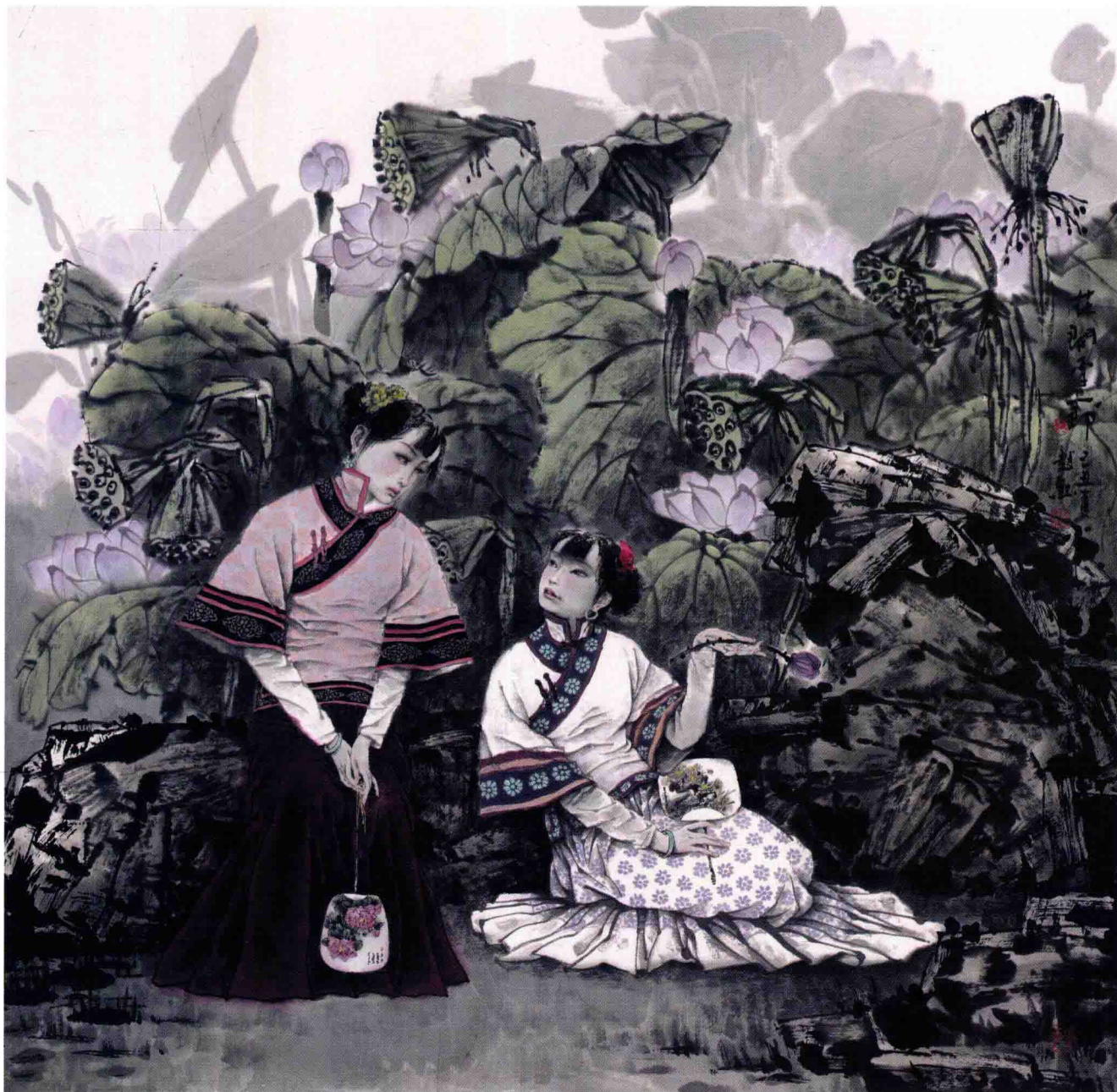
花开季节 90cm×90cm 赵勋 作 Flowering season 90cm × 90cm ZhaoXun