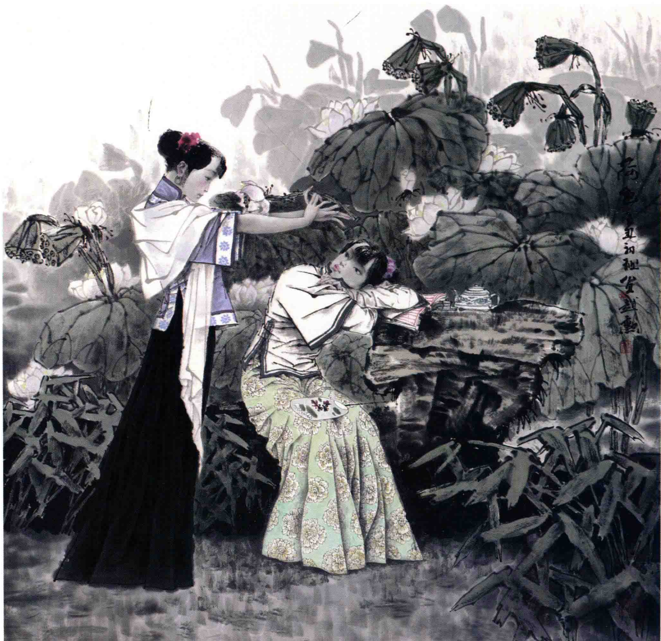
荷色 90cm×90cm 赵勋 作