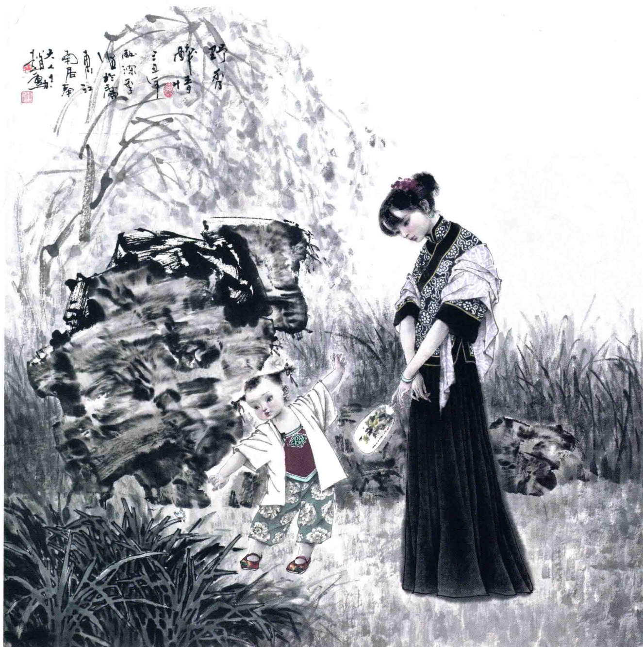
野香醉情 90cm×90cm 赵勋 作 Wild incense drunk feeling 90cm × 90cm ZhaoXun