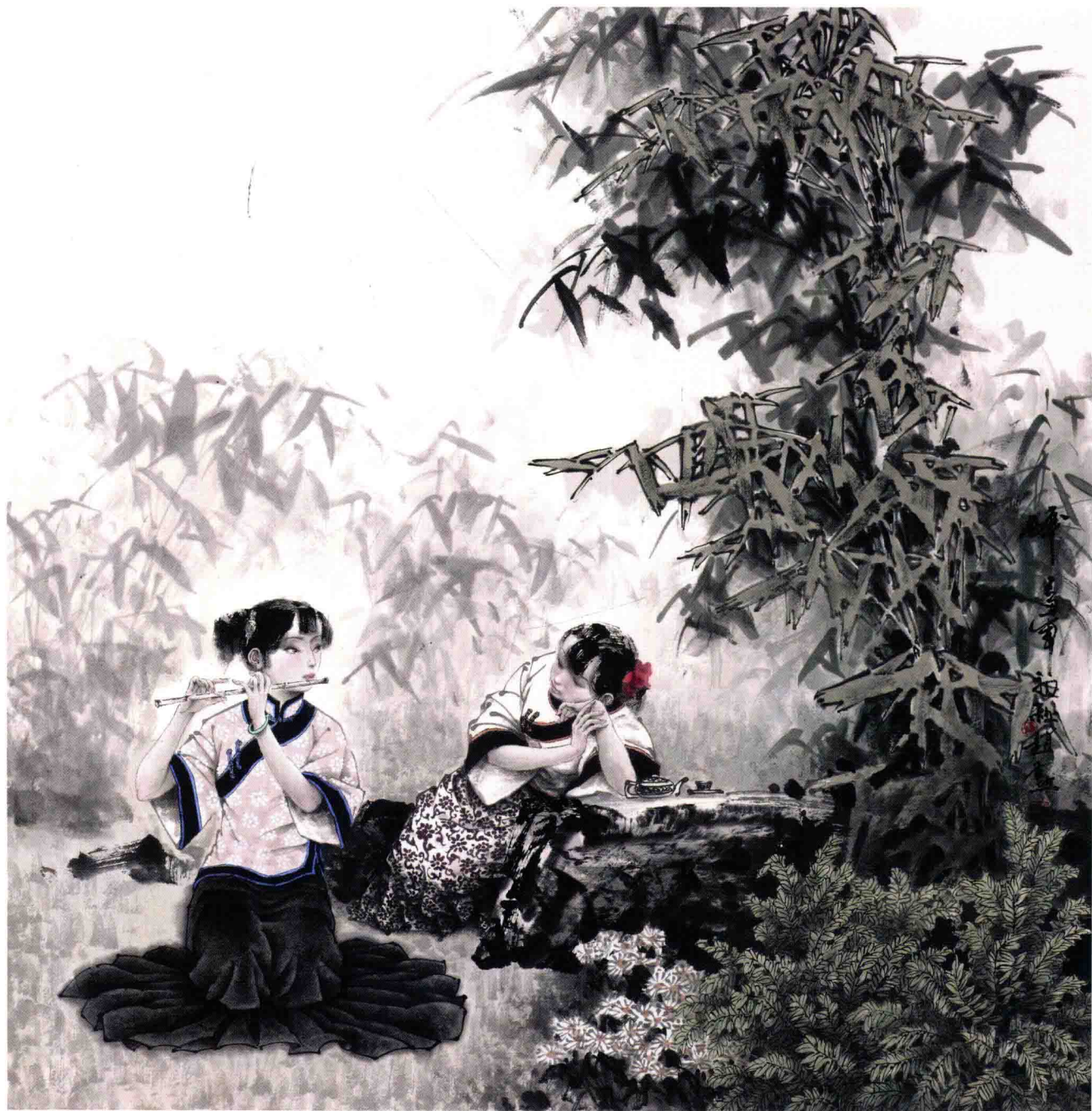
醉 90cm×90cm 赵勋 作