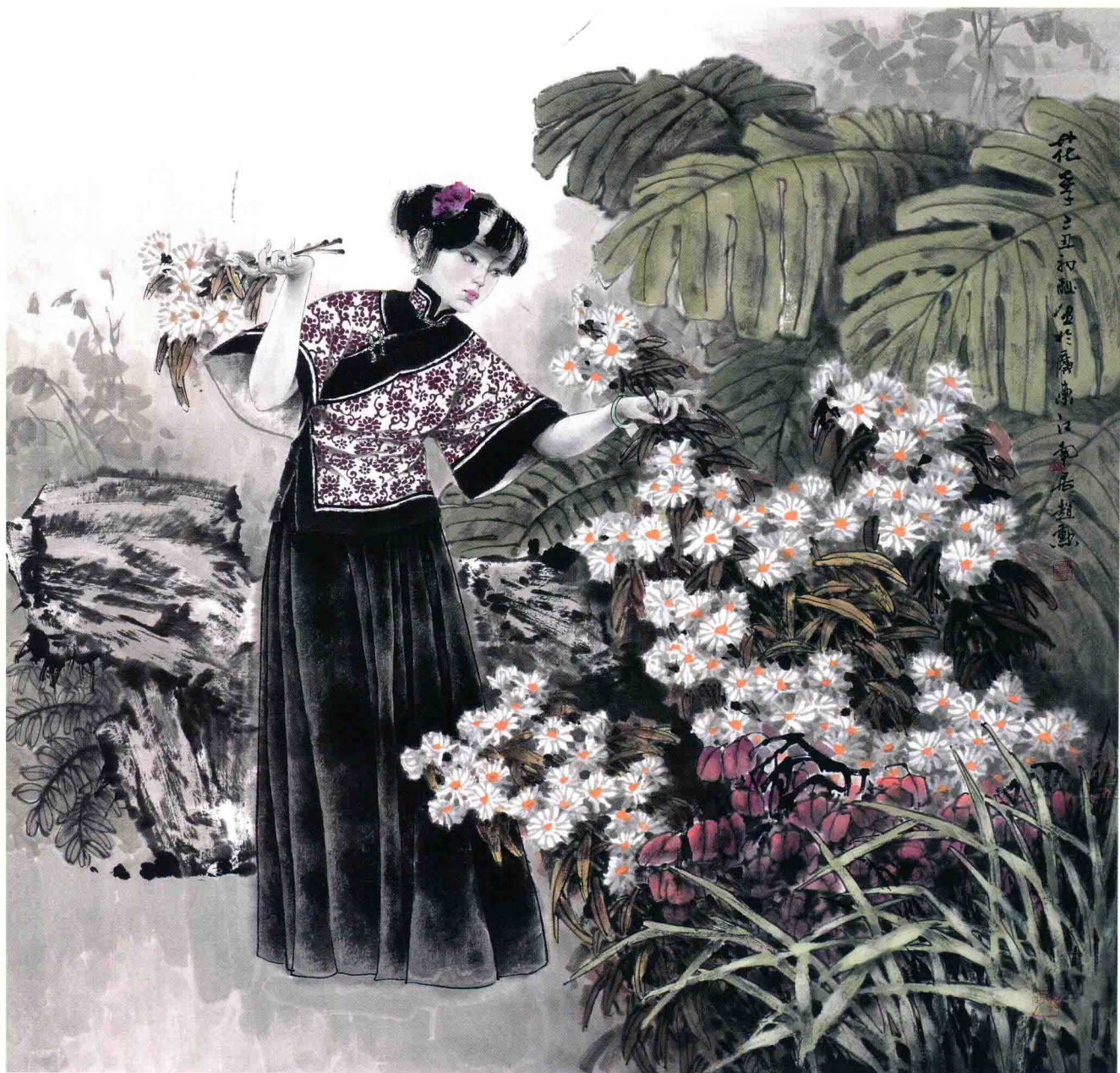
花季 90cm×90cm 赵勋 作