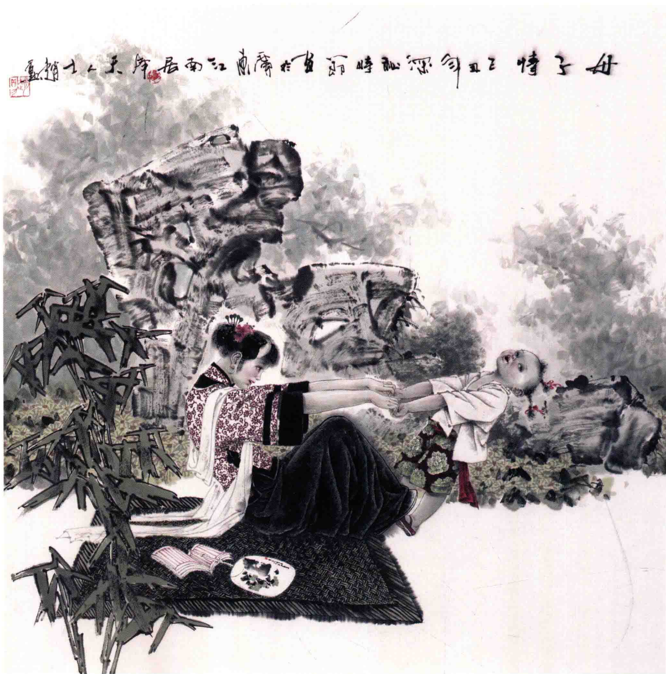
母子情 90cm×90cm 赵勋 作