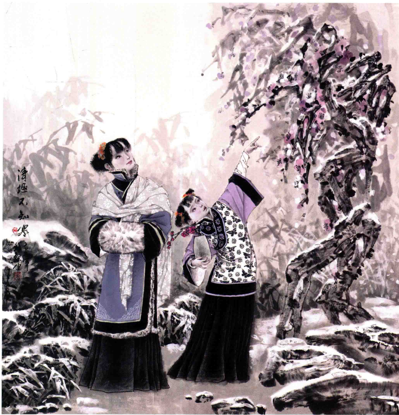
清趣不知寒 90cm×90cm 赵勋 作