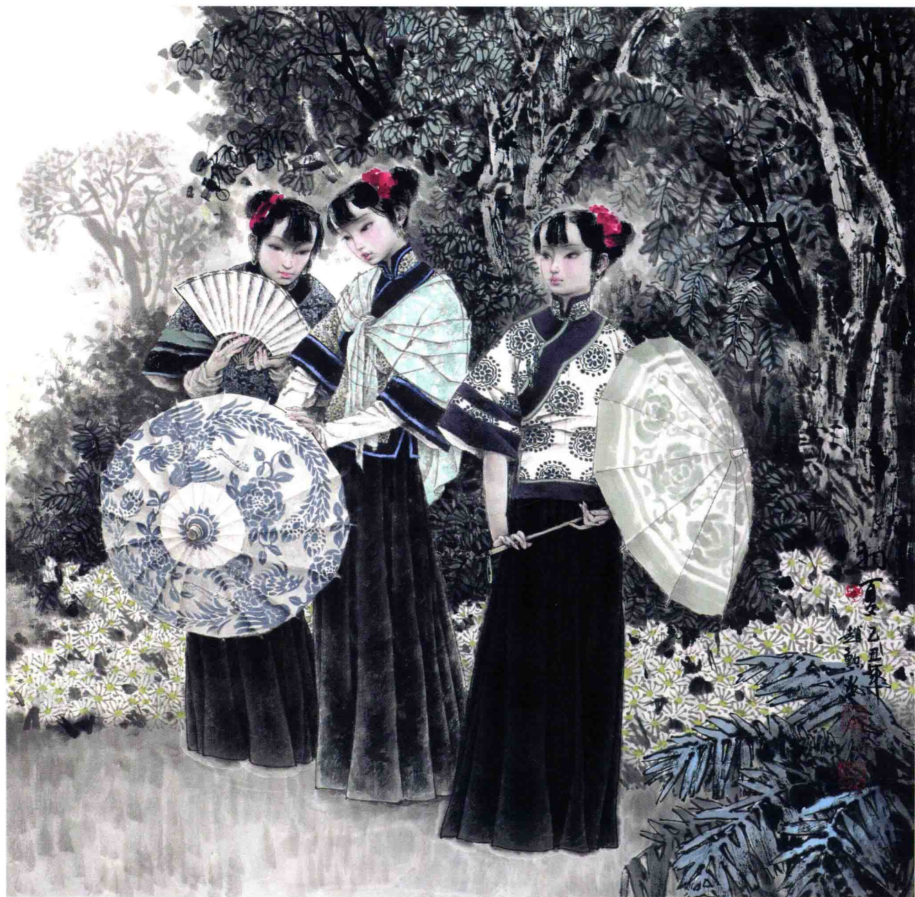
初夏 赵勋 作