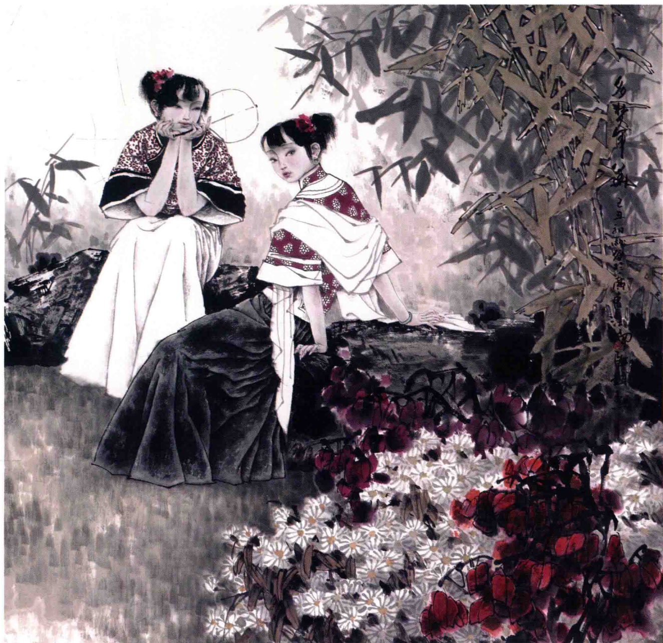
多梦年华 90cm×90cm 赵勋 作