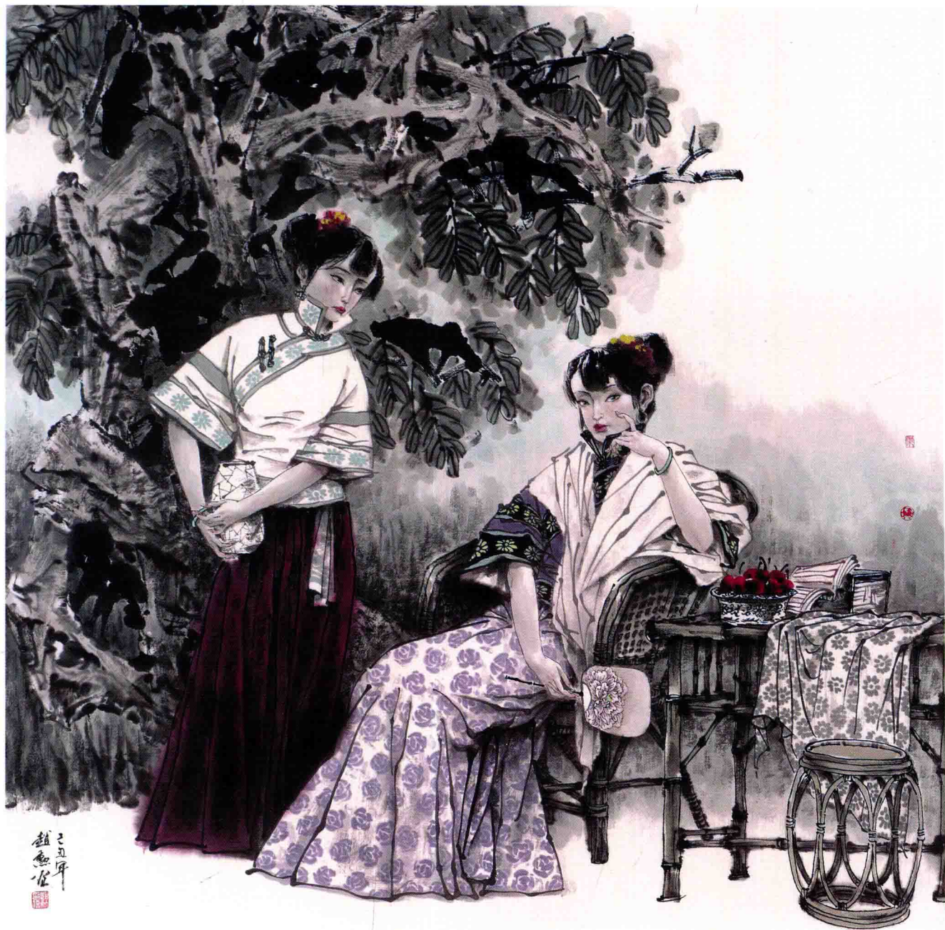
无题 90cm×90cm 赵勋 作 No problem 90cm × 90cm ZhaoXun