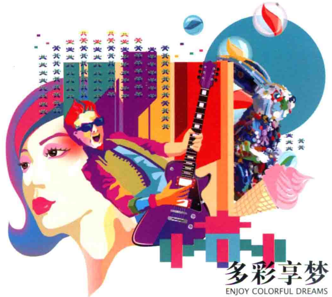
多彩享梦 ENJOY COLORFUL DREAMS 海派都市风格 SHANGHAI URBAN STYLE