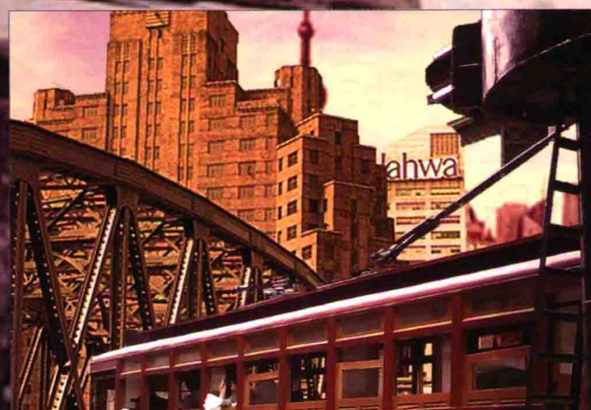
创新传统 INNOVATING TRADITIONS