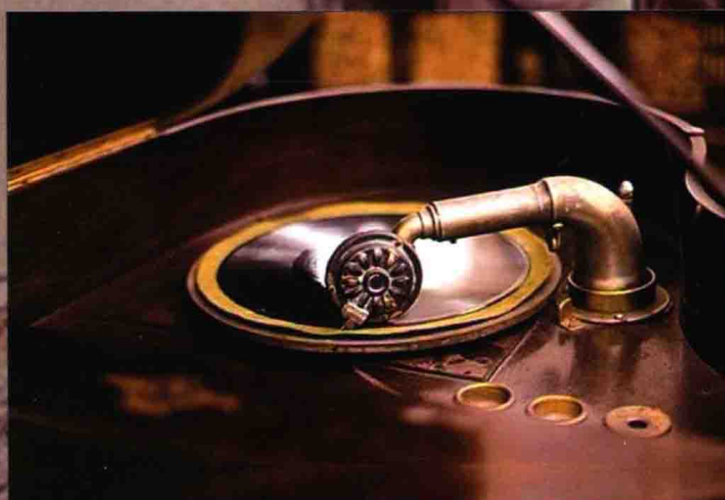
繁华时代 FLOURISHING ERA