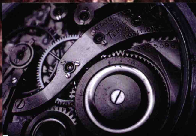
精细品质 EXQUISITE QUALITY