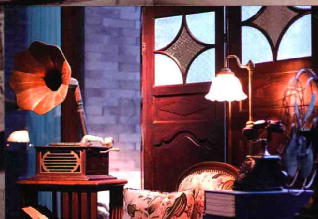
新贵气质 NOBLE TEMPERAMENT