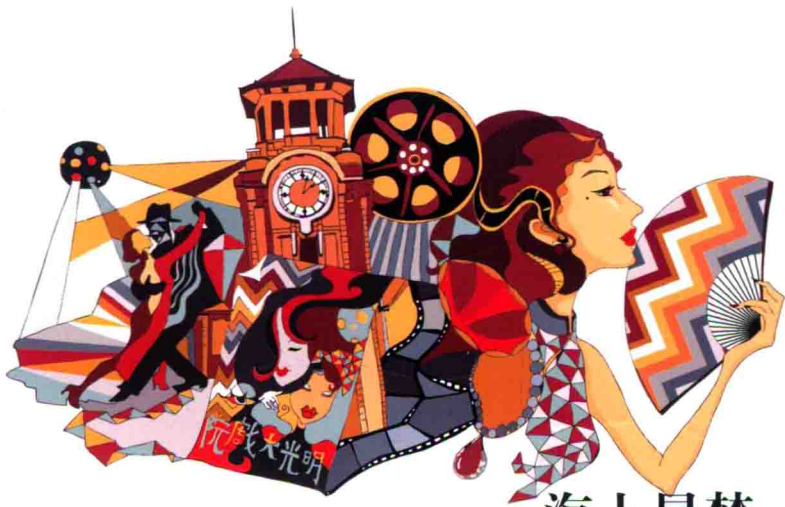
海上星梦 STAR DREAMS OVER THE SEA 海派经典风格 SHANGHAI CLASSICAL STYLE