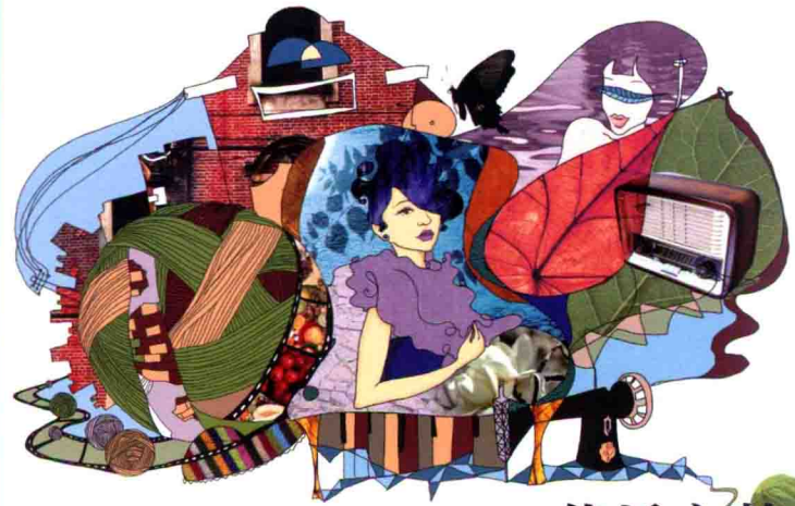
优活之梦 LIVING THE DREAM 海派自然风格 SHANGHAI NATURAL STYLE