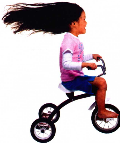
riding a tricycle