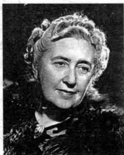
阿加莎·克里斯蒂 Agatha Christie (1890—1976)