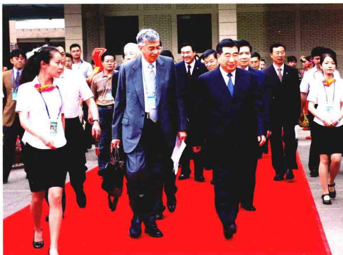
回良玉同志出席在我校举办的国际人类学与民族学联合会第16届大会 Hui Liangyu attending the 16 th World Congress of IUAES at Yunnan University

教育部部长袁贵仁出席滇西边境片区区域发展与扶贫攻坚启动会，要求我校全力配合教育部定点扶贫工作，积极服务滇西区域发展与扶贫攻坚