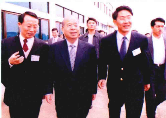
尉健行同志视察云南大学 Wei Jianxing inspecting Yunnan University