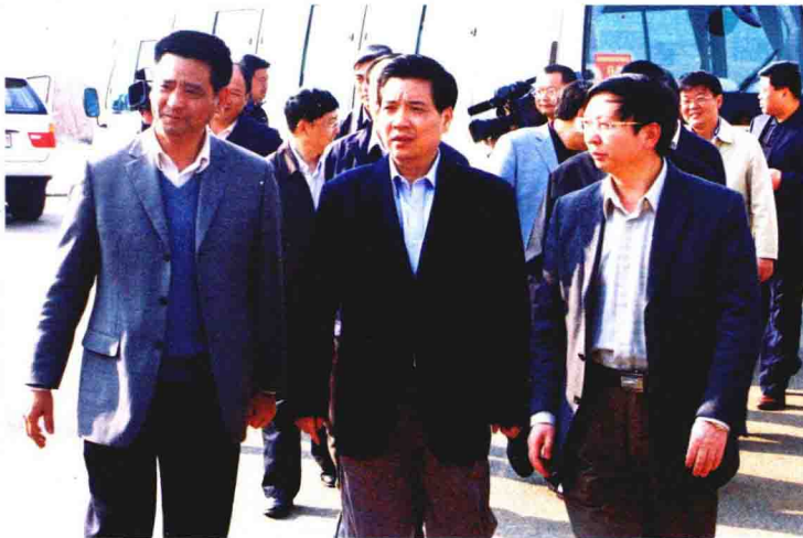
中共云南省委书记秦光荣（中）到学校视察指导工作 Qin Guangrong (middle), Secretary General of the CPC Yunnan Provincial Committee, inspecting Yunnan University