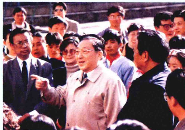
李岚清同志视察云南大学 Li Lanqing inspecting Yunnan University