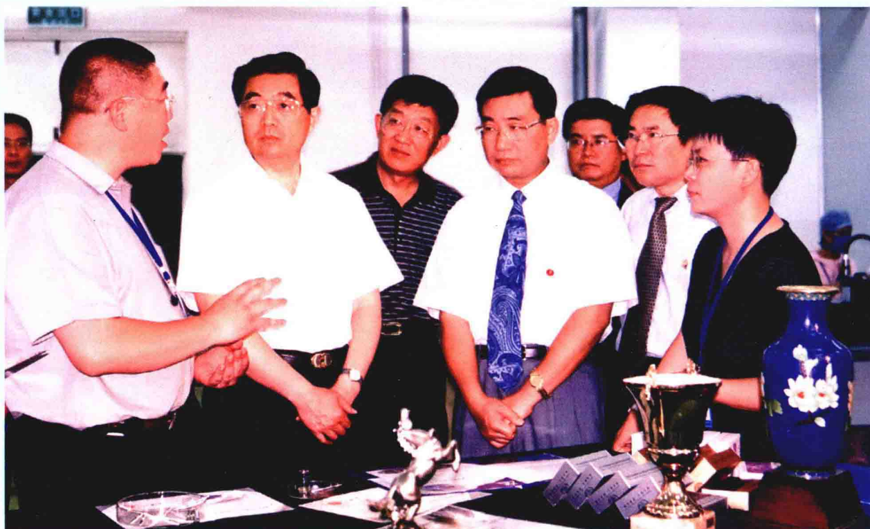
胡锦涛同志视察云南大学 Hu Jintao inspecting Yunnan University