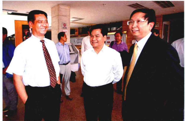
云南省省长李纪恒（中）到学校视察指导工作 Li Jiheng (middle), Governor of Yunnan Province, inspecting Yunnan University