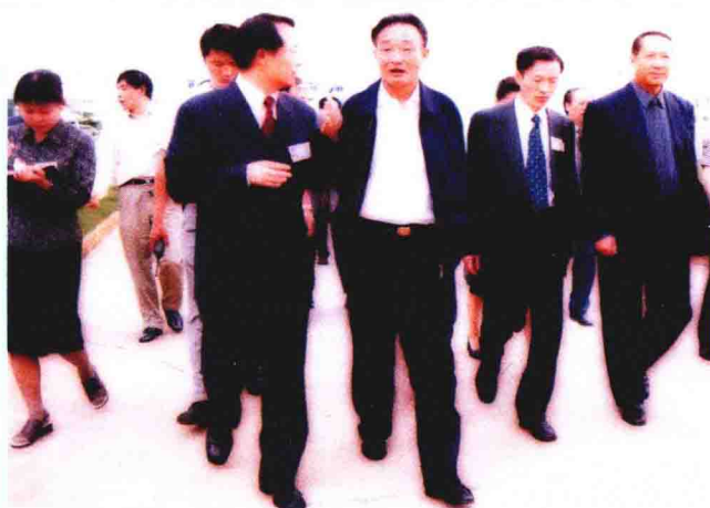
吴邦国同志视察云南大学 Wu Bangguo inspecting Yunnan University