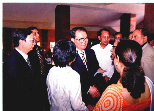
李长春同志视察我校孟加拉孔子学院 Li Changchun visiting Yunnan University's Confucius Institute in Bangladesh