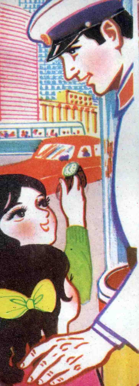
Two Young Pioneers