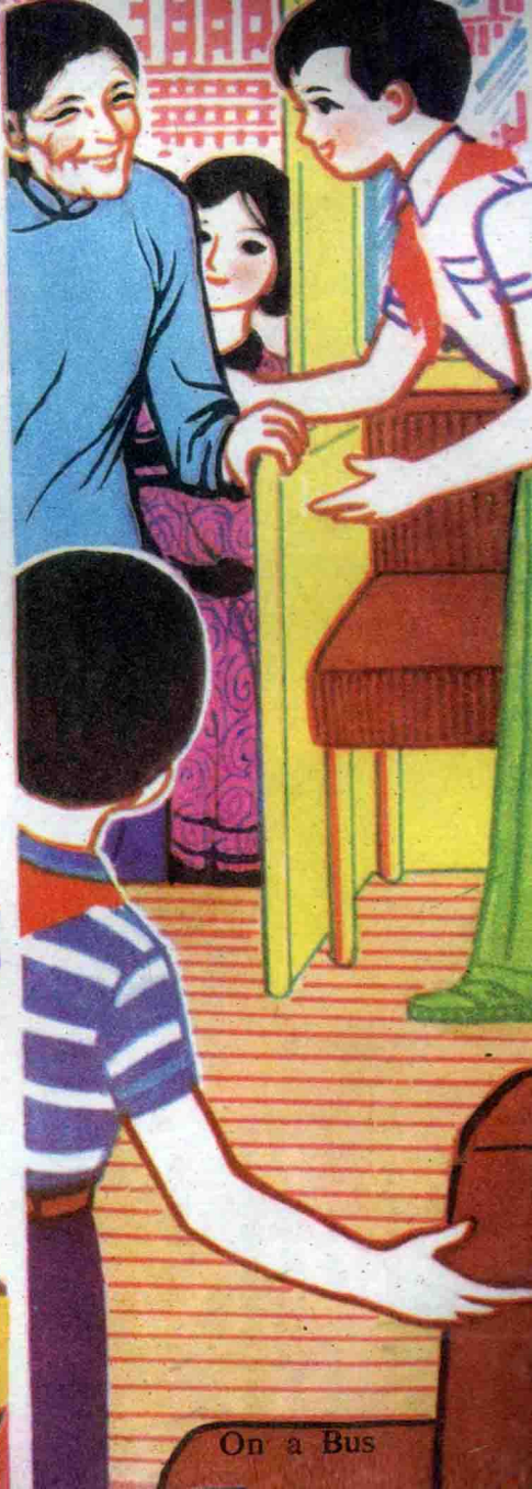
On a Bus