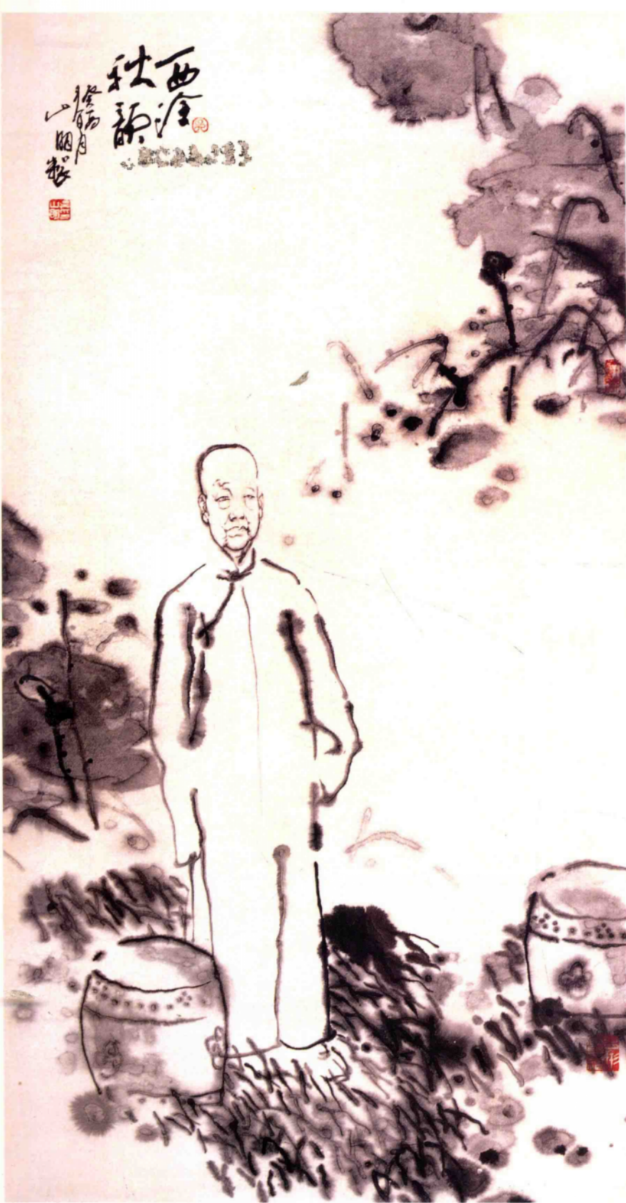
Mr. Wu Changshuo, Great Master of Chinese Painting 图 吴昌硕