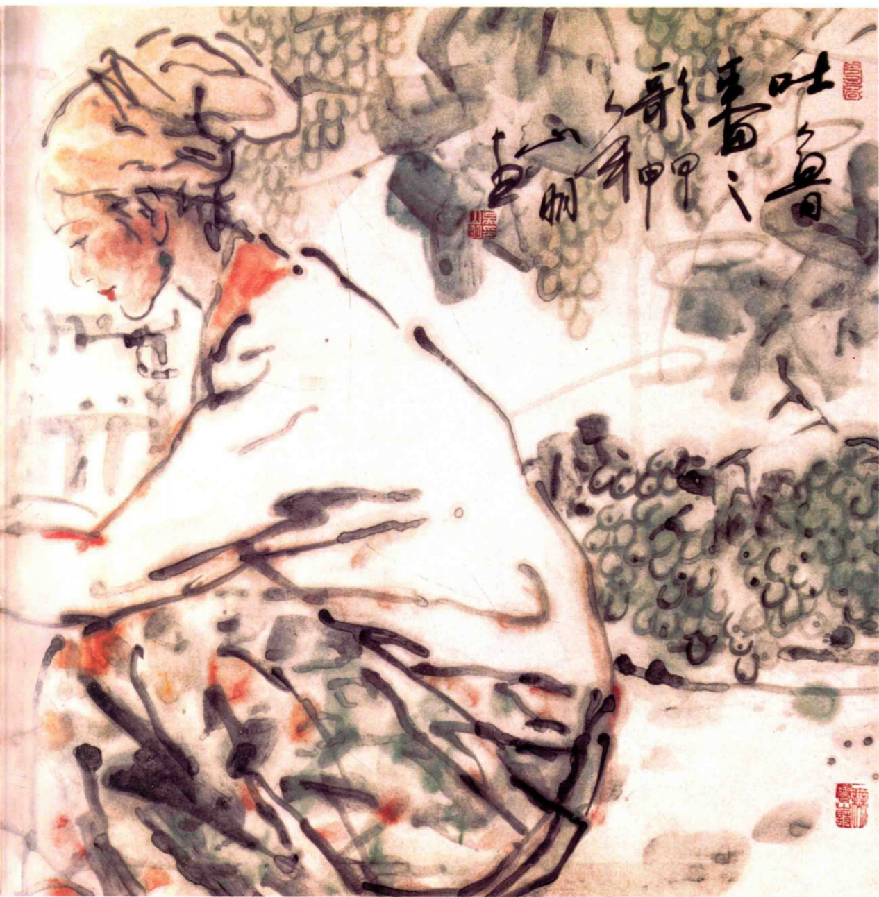
Mother of Turpan 吐鲁番之歌