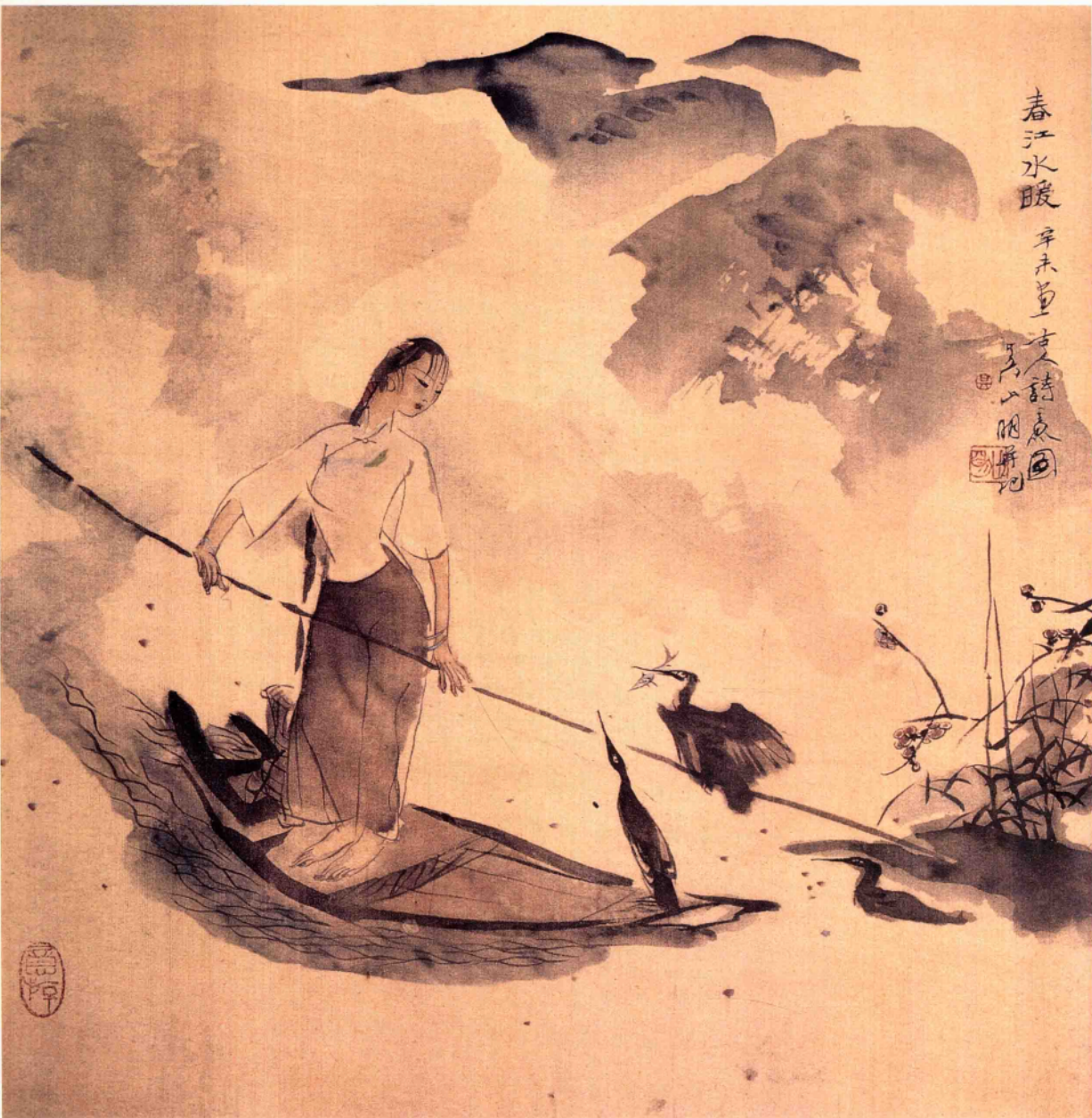
A Fishing Girl on the Lake 春江水暖