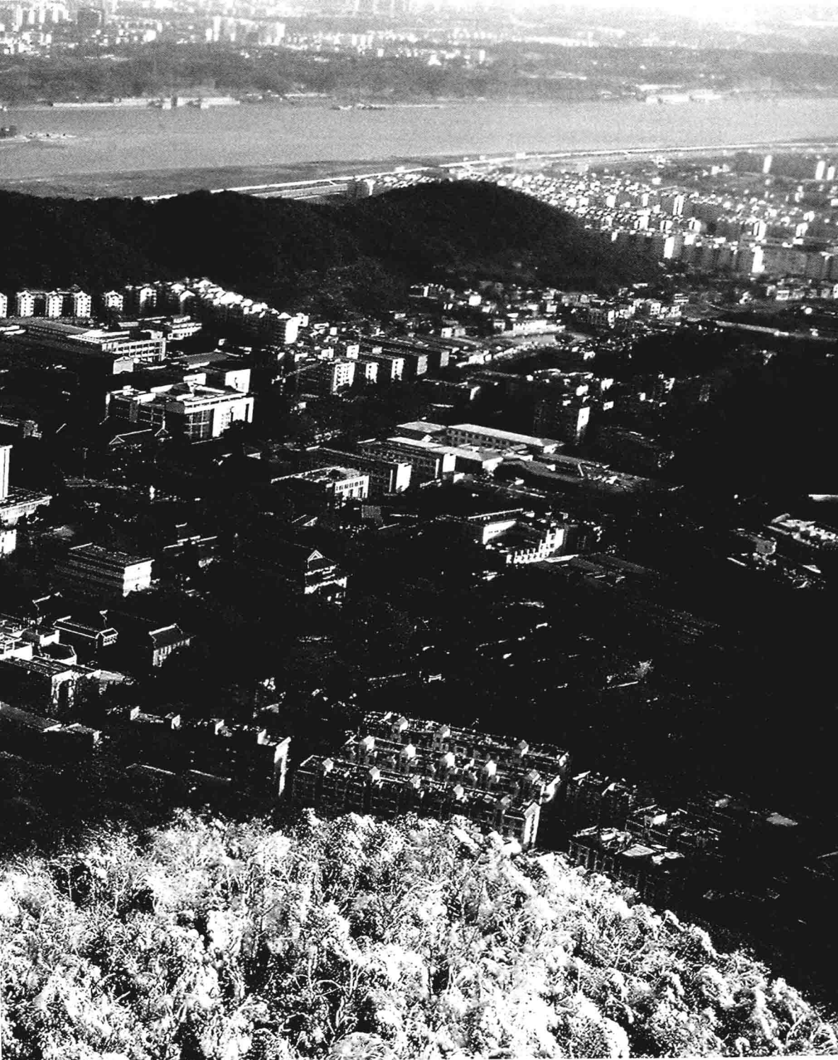
湖南大学校园 Bird's eye view, the campus of Hunan University