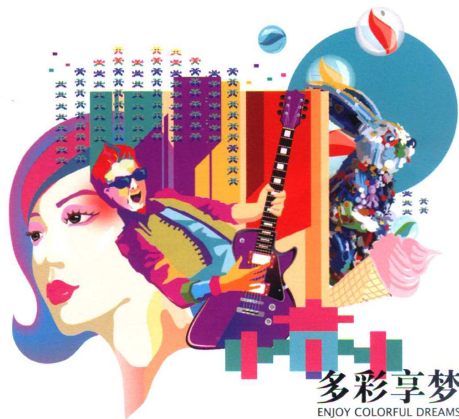
多彩享梦 ENJOY COLORFUL DREAMS 海派都市风格 SHANGHAI URBAN STYLE