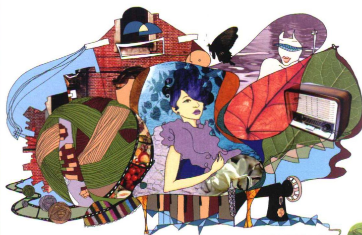
优活之梦 LIVING THE DREAM 海派自然风格 SHANGHAI NATURAL STYLE