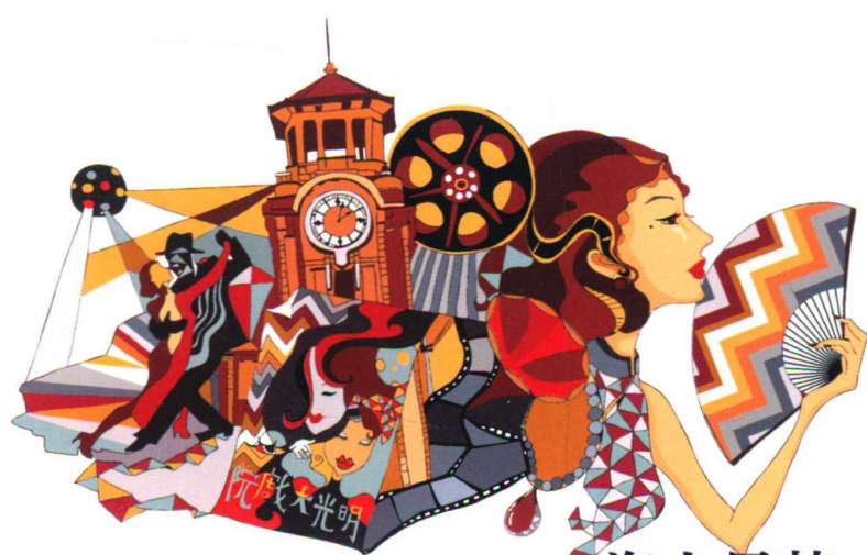
海上星梦 STAR DREAMS OVER THE SEA 海派经典风格 SHANGHAI CLASSICAL STYLE