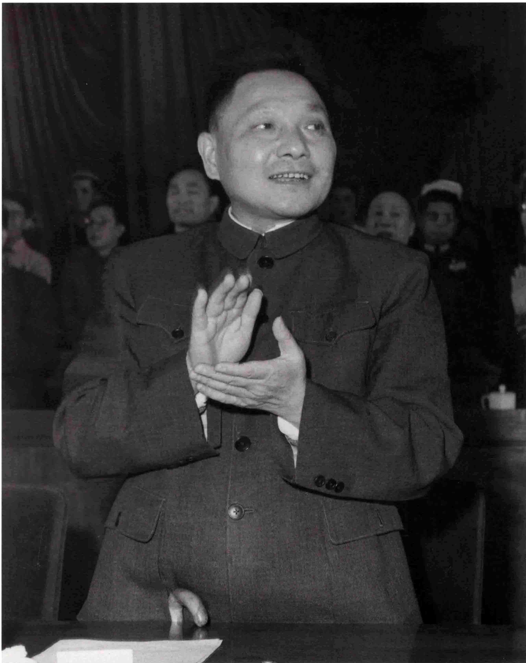
1960 年，邓小平出席在人民大会堂召开的全国民兵代表大会 Deng Xiaoping attending the National Congress of the People's Militia in the Great Hall of the People in 1960.