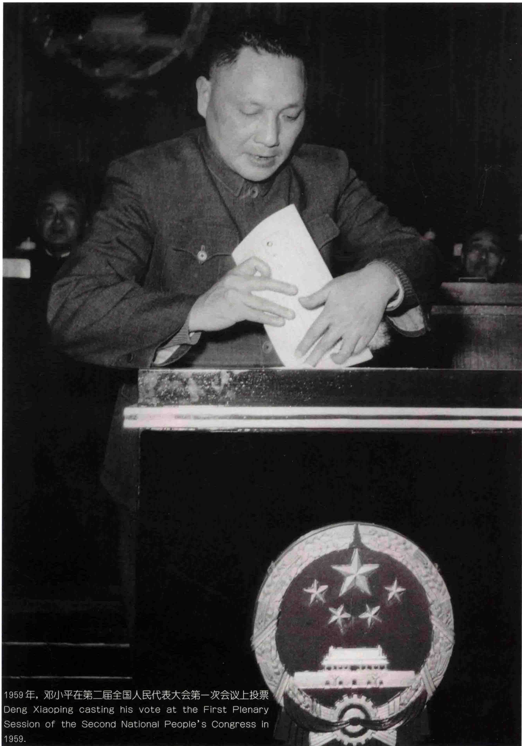
1959年，邓小平在第二届全国人民代表大会第一次会议上投票 Deng Xiaoping casting his vote at the First Plenary Session of the Second National People's Congress in 1959.