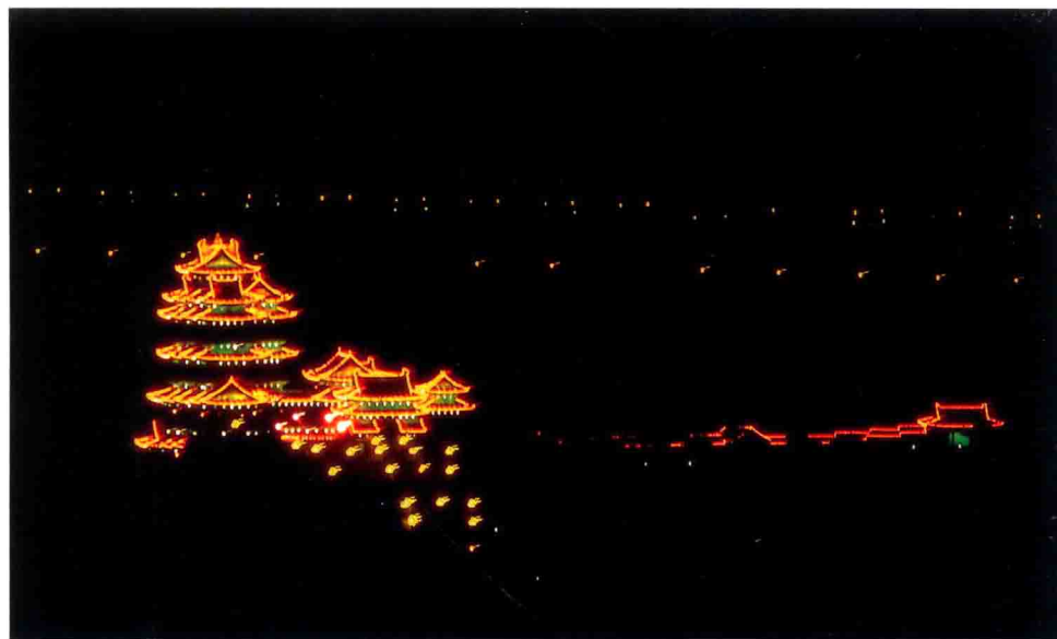
夜色中的阅江楼 Night View of the Riverview Tower

阅江楼，14世纪时朱元璋和宋濂就为它作《阅江楼记》，但直到21世纪开年之际，它才真实地矗立在人们的视野里。如今阅江楼已经是南京滨江景观带的标志性建筑。