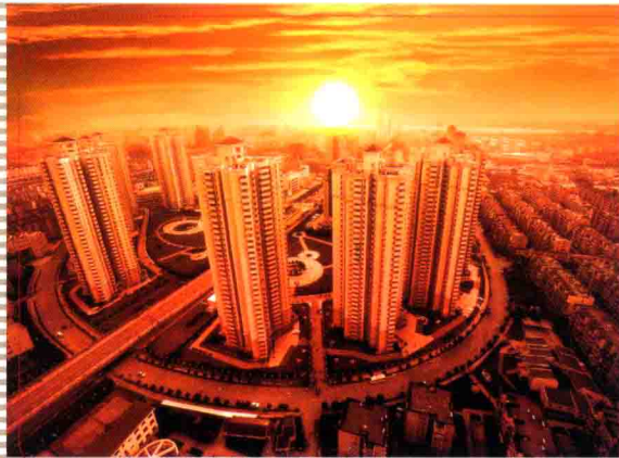
城市建设 Urban Construction