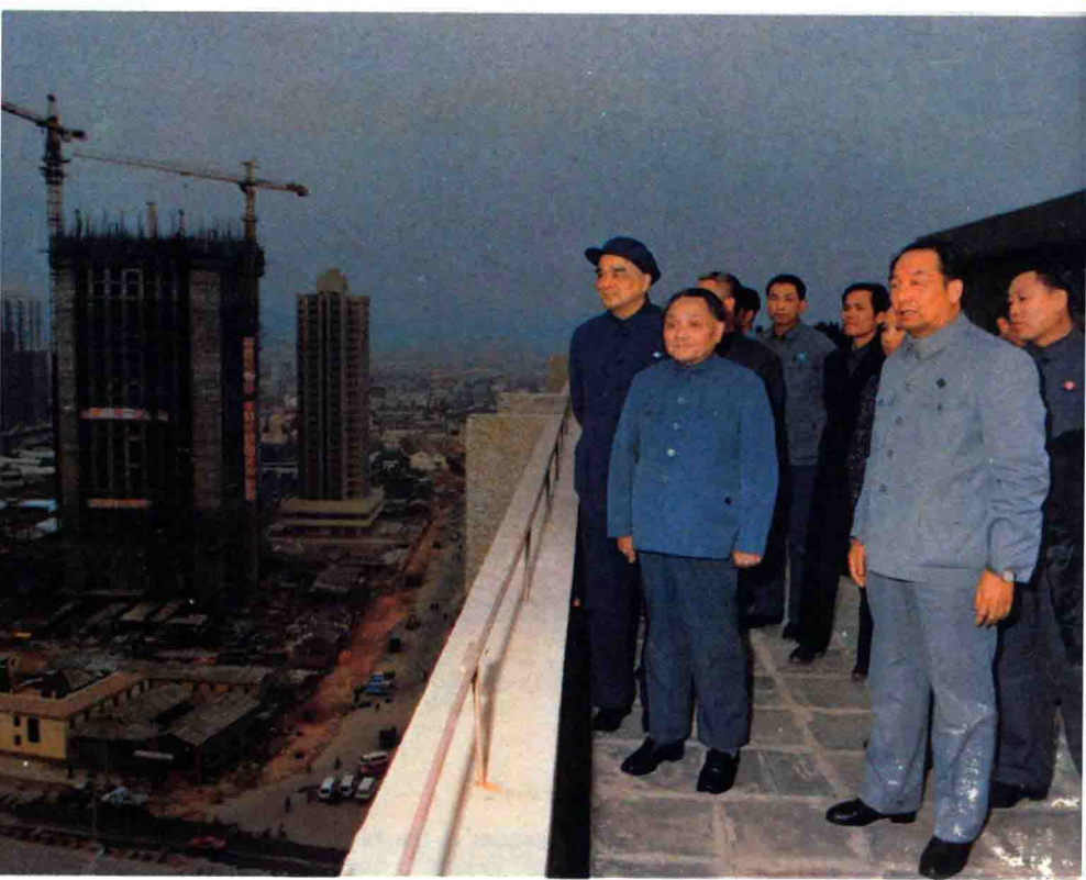
Deng on the roof of the Shenzhen International Commerce Building, overlooking a new area under construction in Luohu. (January 24, 1984)