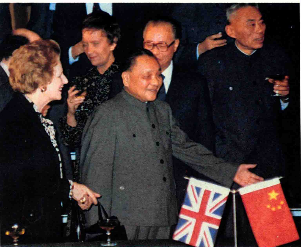
With Prime Minister Margaret Thatcher of the United Kingdom at the signing ceremony of the Sino-British Joint Declaration on the Question of Hongkong. (December 19, 1984)