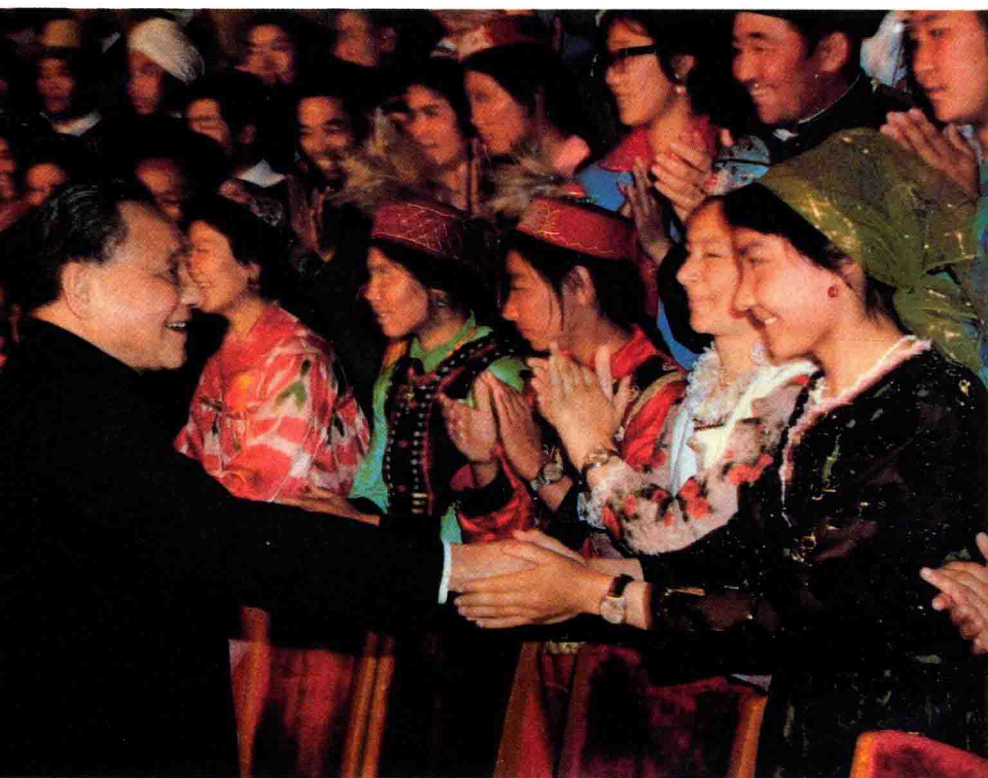
With a delegation of minority nationality youth from border regions visiting Beijing. (May 1, 1982)