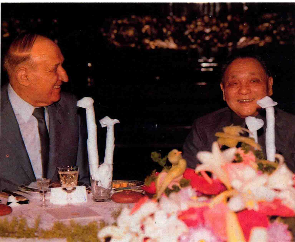
At a banquet in honour of Todor Zhivkov (left), General Secretary of the Central Committee of the Bulgarian Communist Party and President of the State Council of Bulgaria. (May 7, 1987)