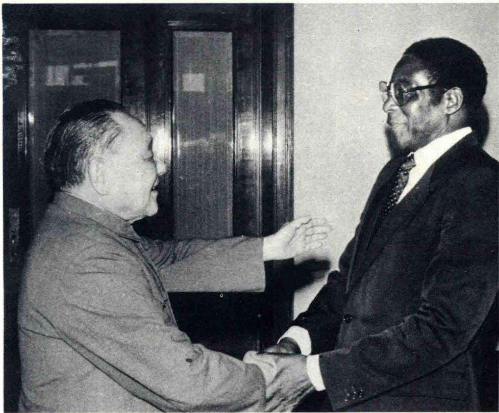
With Prime Minister Robert Mugabe of Zimbabwe. (January 20, 1987)