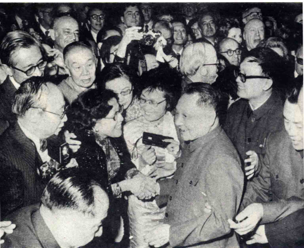
Deng welcomed by a group of American friends, overseas Chinese residing in the U.S. and Chinese-Americans in Washington. (January 1979)