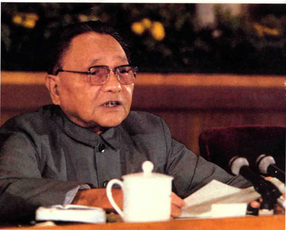
Deng speaking at the National Conference of the Chinese Communist Party held on September 23, 1985.