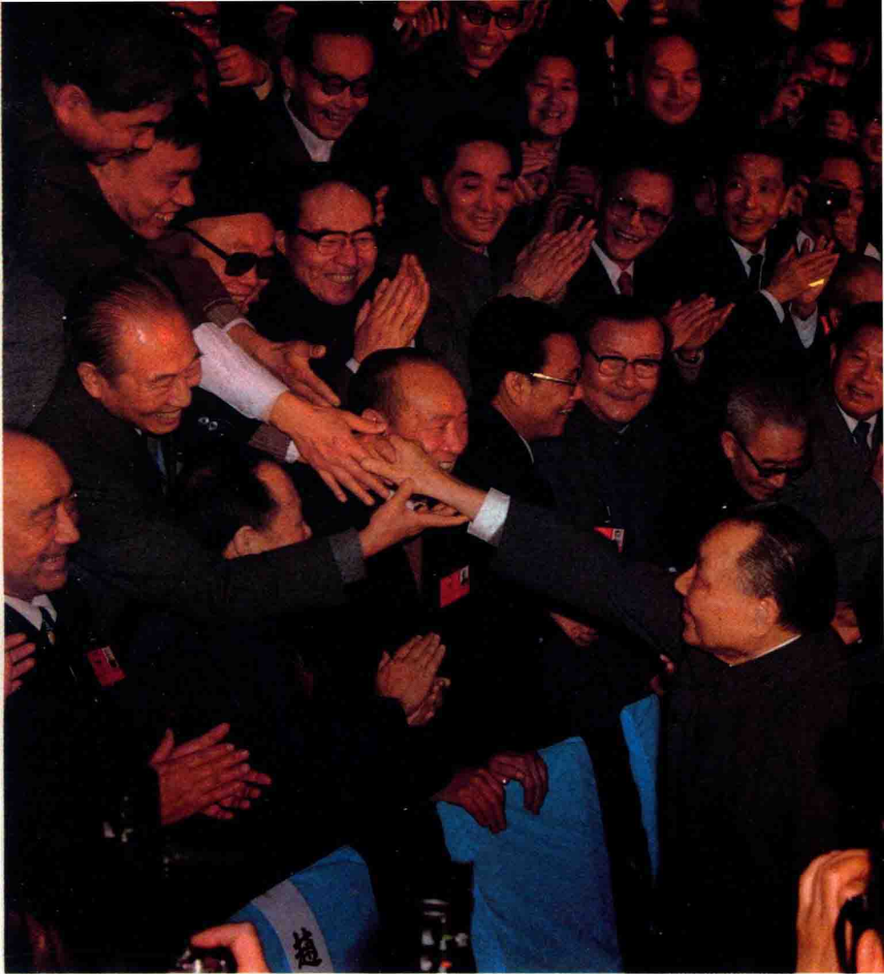
With deputies to the Fifth Session of the Sixth National People's Congress. (April 1987)