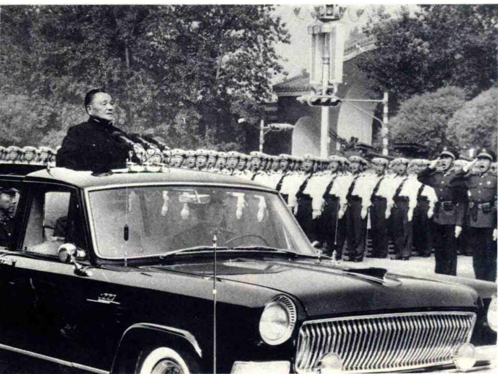
Deng reviewing the three services of the PLA on October 1, 1984, the 35th anniversary of the founding of the People's Republic.