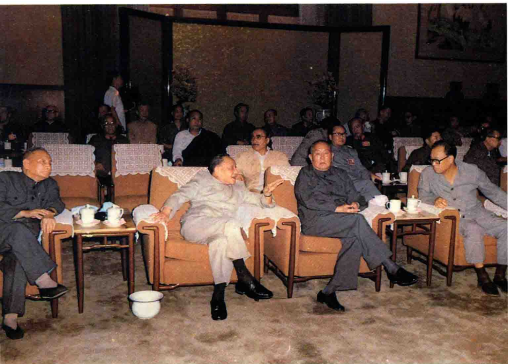
Deng Xiaoping talking with Chen Yun (left), Li Xiannian (second from right), and Zhao Ziyang (far right). (June 22, 1983)