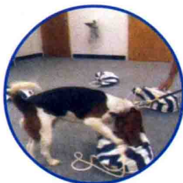
carry-ons and soft-sided bags