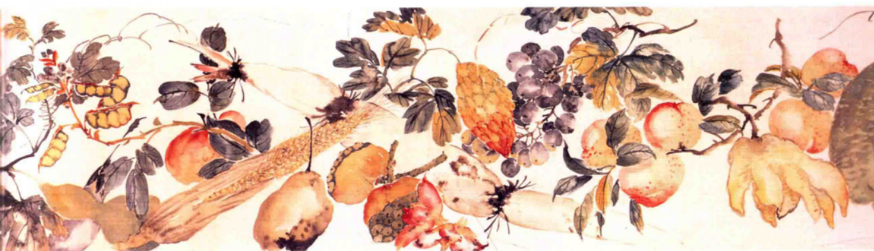
A Scroll of Painting on Vegetables and Fruits