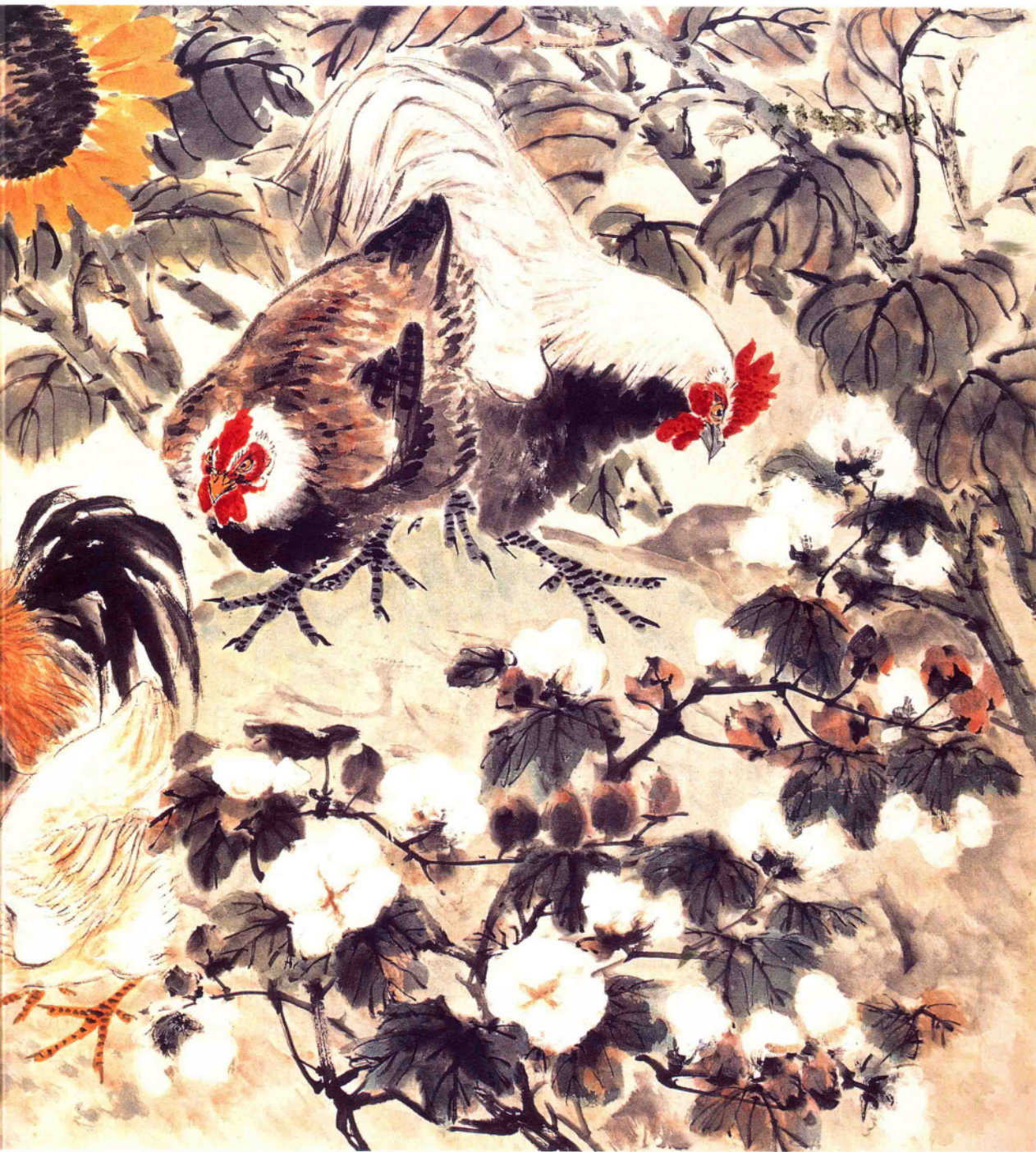
Sunflowers and Leisurely Fowls 大吉圖