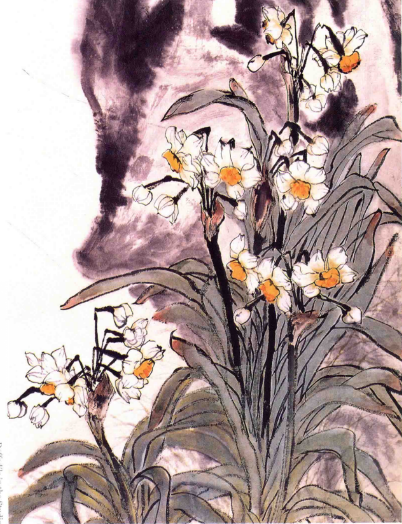
Daffodils in the Studio 水仙在室