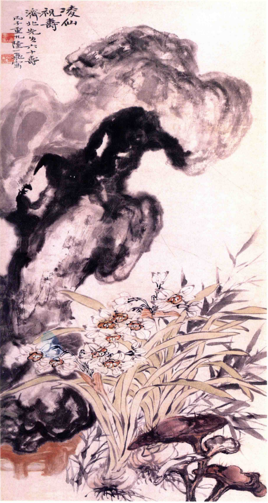
凌仙祝壽 Ganodermas, Daffodils and Rocks