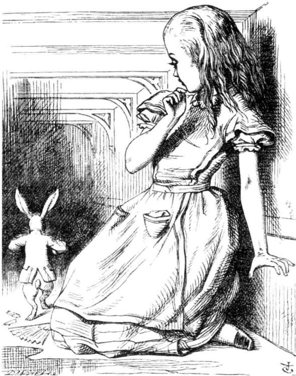
White Rabbit Running from Big Alice

Duchess, the Duchess! Oh!won't she be savage if I've kept her waiting!' Alice felt so desperate that she was ready to ask help of any one; so, when the Rabbit came near her, she began, in a low, timid voice, 'If you please, sir—' The Rabbit started violently, dropped the white kid gloves and the fan, and skurried away into the darkness as hard as he could go.