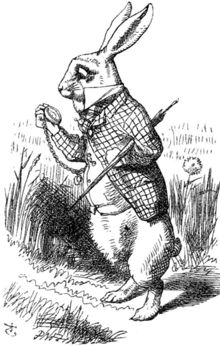
White Rabbit with Watch

plenty of time as she went down to look about her and to wonder what was going to happen next. First, she tried to look down and make out what she was coming to, but it was too dark to see anything; then she looked at the sides of the well, and noticed that they were filled with cupboards and book-shelves; here and there she saw maps and pictures hung upon pegs. She took down a jar from one of the shelves as she passed; it was labelled 'ORANGE MARMALADE', but to her great disappointment it was empty: she did not like to drop the jar for fear of killing somebody, so managed to put it into one of the cupboards as she fell past it.