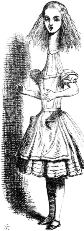
Alice with Long Neck

‘ C URIUSER and curiuser!’ cried Alice (she was so much surprised, that for the moment she quite forgot how to speak good English); ‘now I’m opening out like the largest telescope that ever was! Good-bye, feet!’ (for when