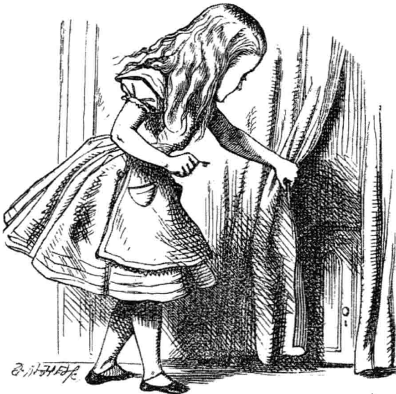
Alice Looking Behind the Curtain

There were doors all round the hall, but they were all locked; and when Alice had been all the way down one side and up the other, trying every door, she walked sadly down the middle, wondering how she was ever to get out again.