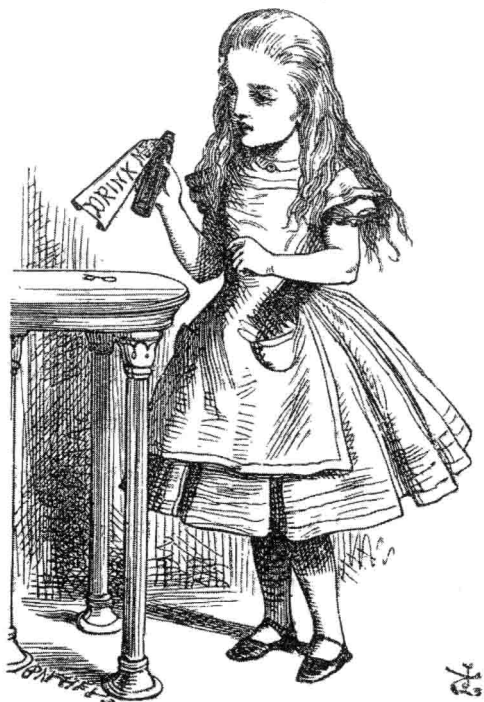
Alice with Bottle marked 'Drink Me'

and she had never forgotten that, if you drink much from a bottle marked 'poison,' it is almost certain to disagree with you, sooner or later.