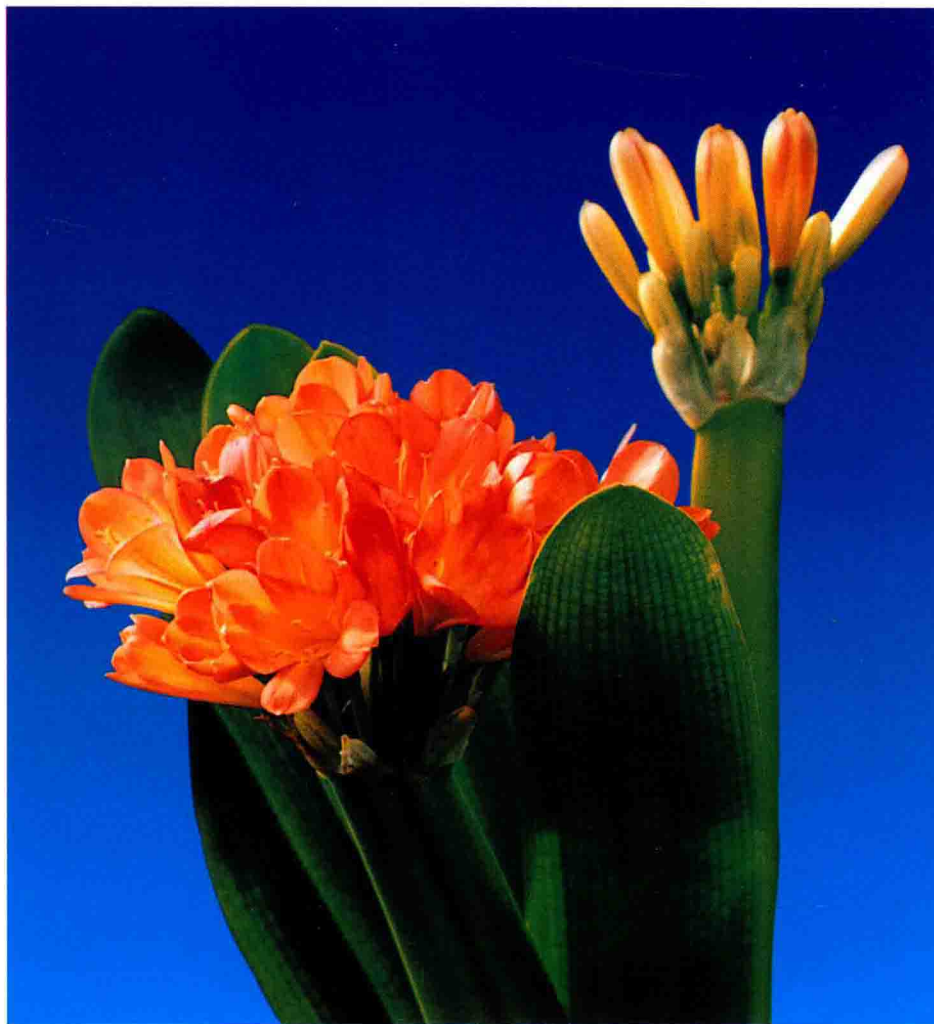
长春市市花 —— 君子兰

Municipal Flower of Changchun —— Greentip Karfirlily