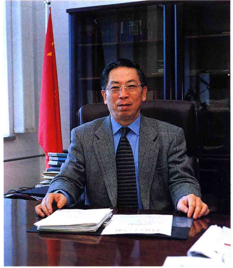
长春市市长:李述 Changchun Mayor: Li Shu