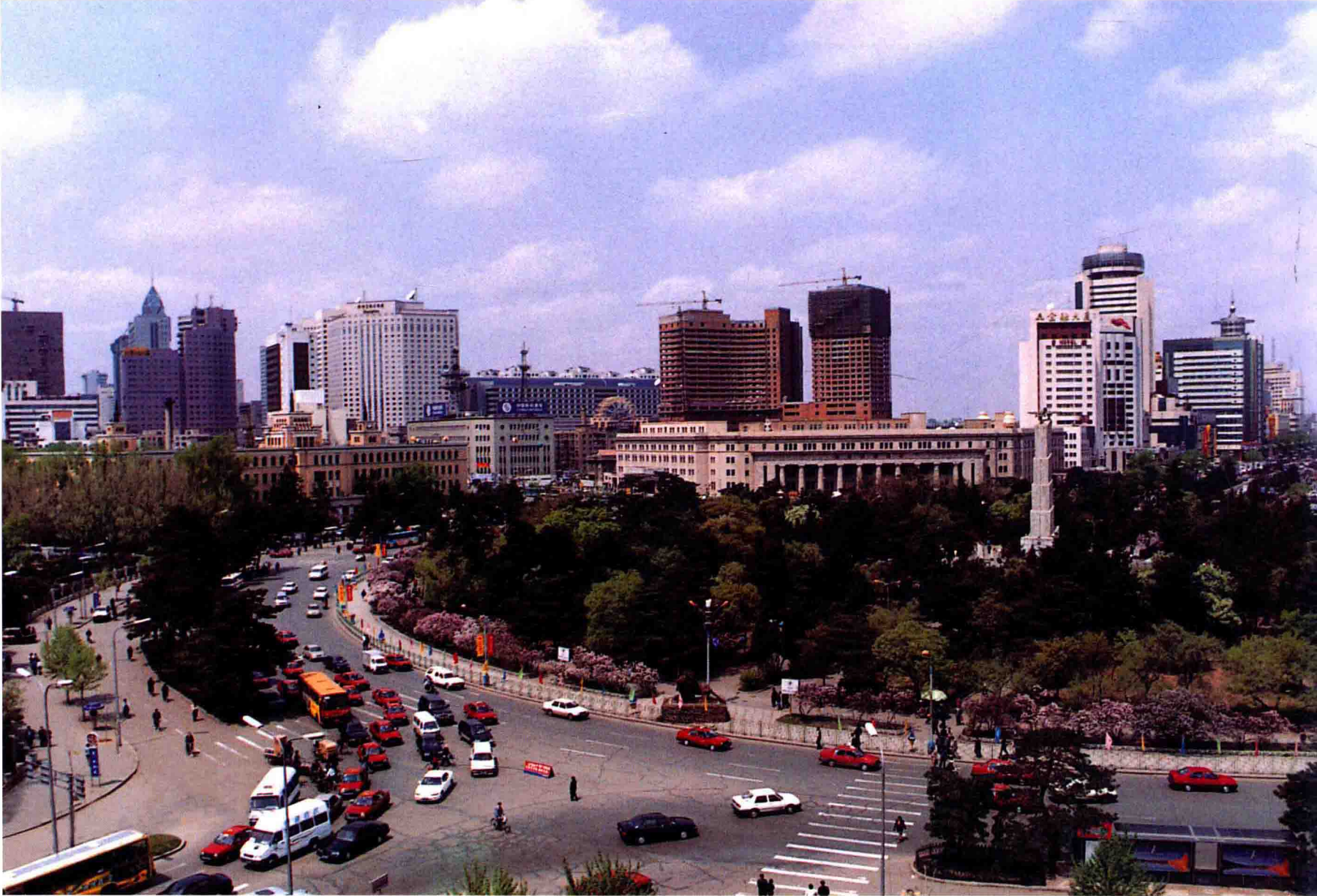
人民广场 People's Square