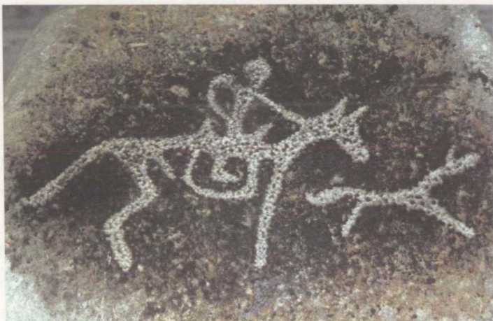
• 古代岩画 Ancient Mural Painting

技中的口技是人用口部等发声器官来模仿各种声音的一种技巧，其起源同样可以追溯至远古时代。人们模仿鸟兽的叫声来诱捕猎物，或以恐吓的吼声驱赶野兽。