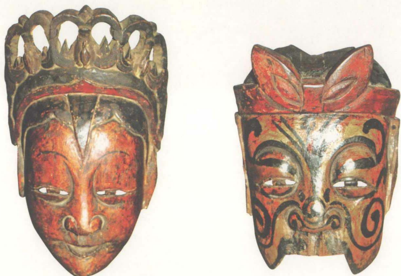
• 少数民族的傩舞面具 Nuo Dance Mask of Ethnic Minorities

Various primitive sacrificial ceremonies also promoted the formation of acrobatics. In the deity entertainment activities, people usually disguised themselves into animals and spirits in the performance named Nuo. Later, more and more recreational functions were added into this activity. So stilt walk, steel fork play and other kinds of acrobatic programs originated from Nuo dance at that time.