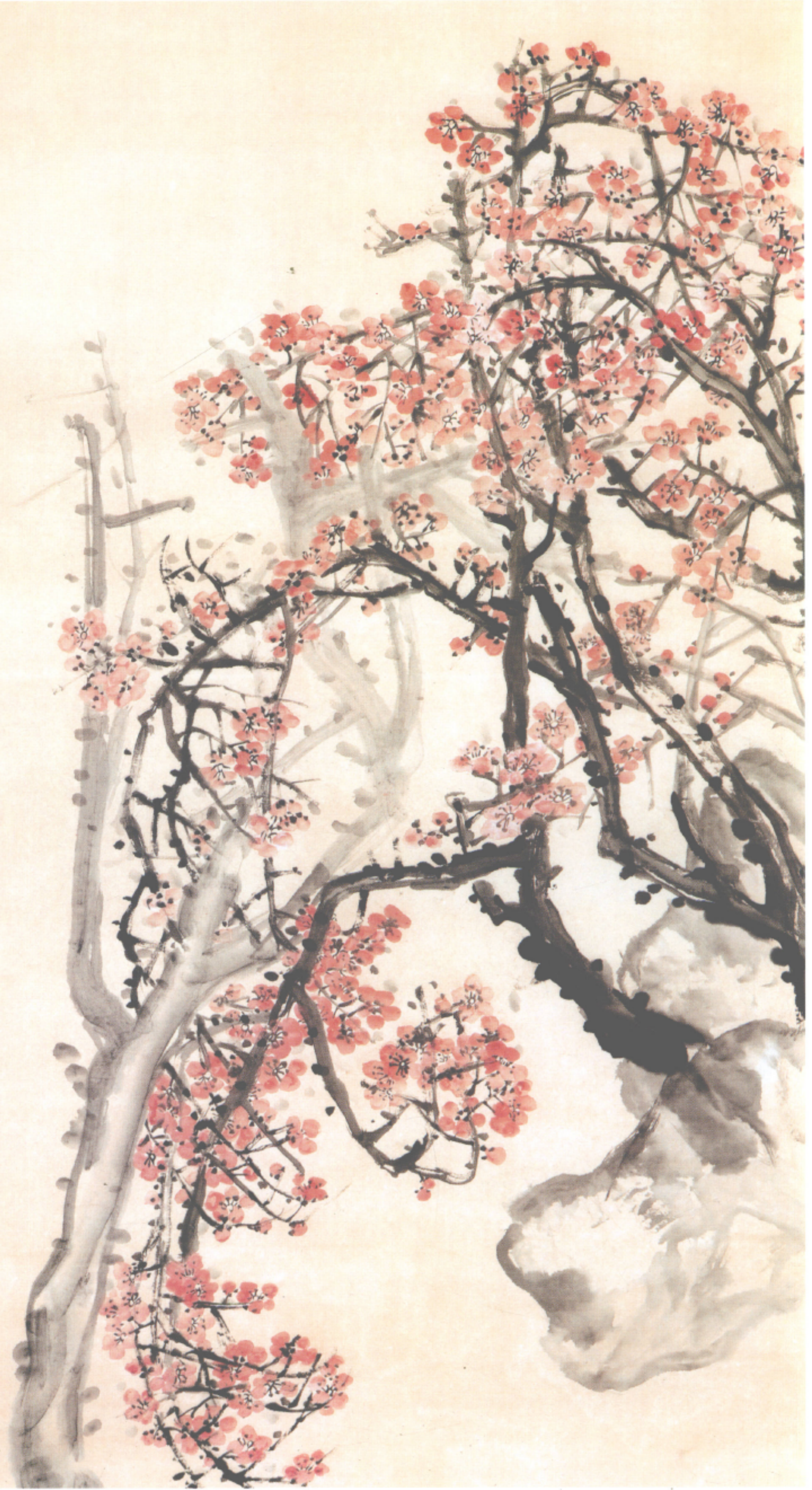
Plum Blossoms (Detail of painting on next page)