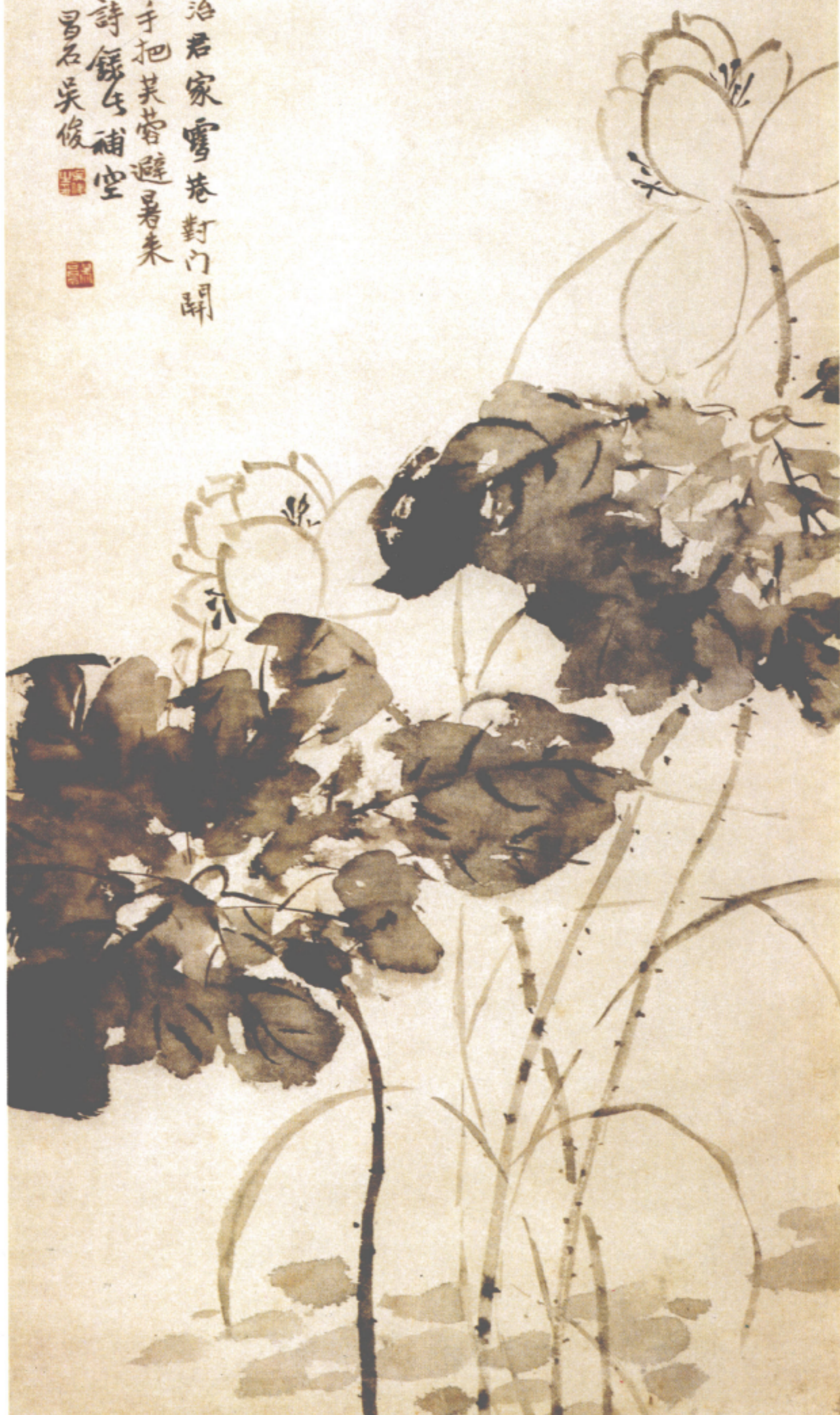
Lotus in Black Ink