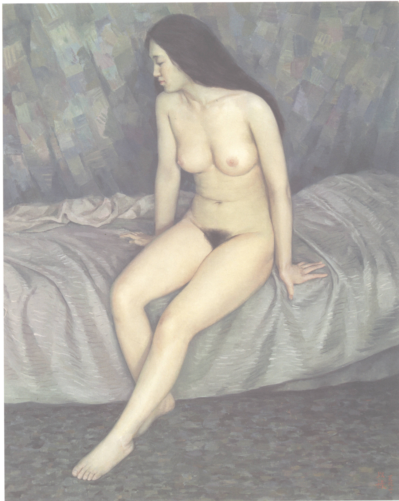
女人體(一) (100cm × 81cm) 布上油畫