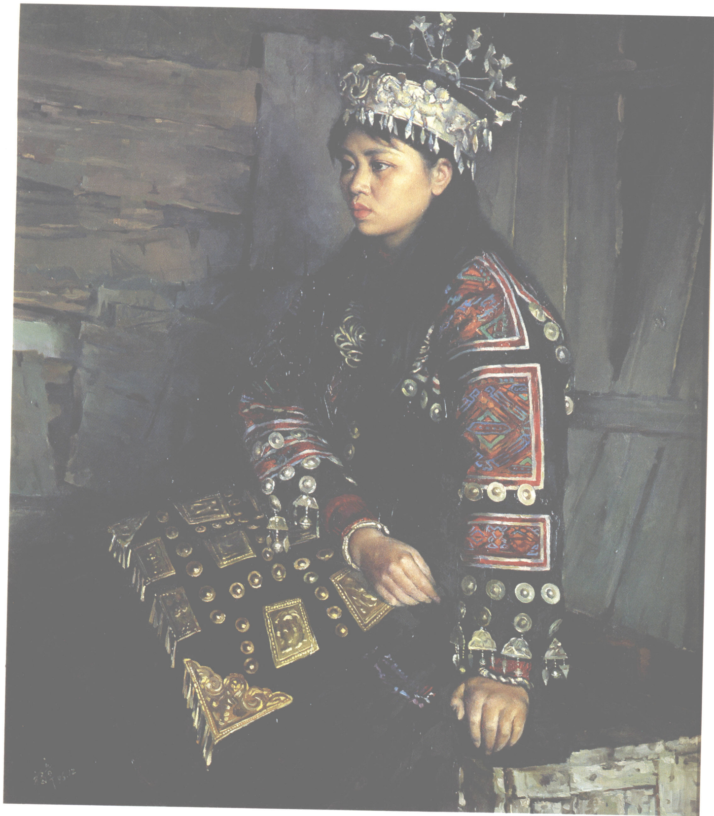
苗女 (120cm×90cm)布上油畫 董福章