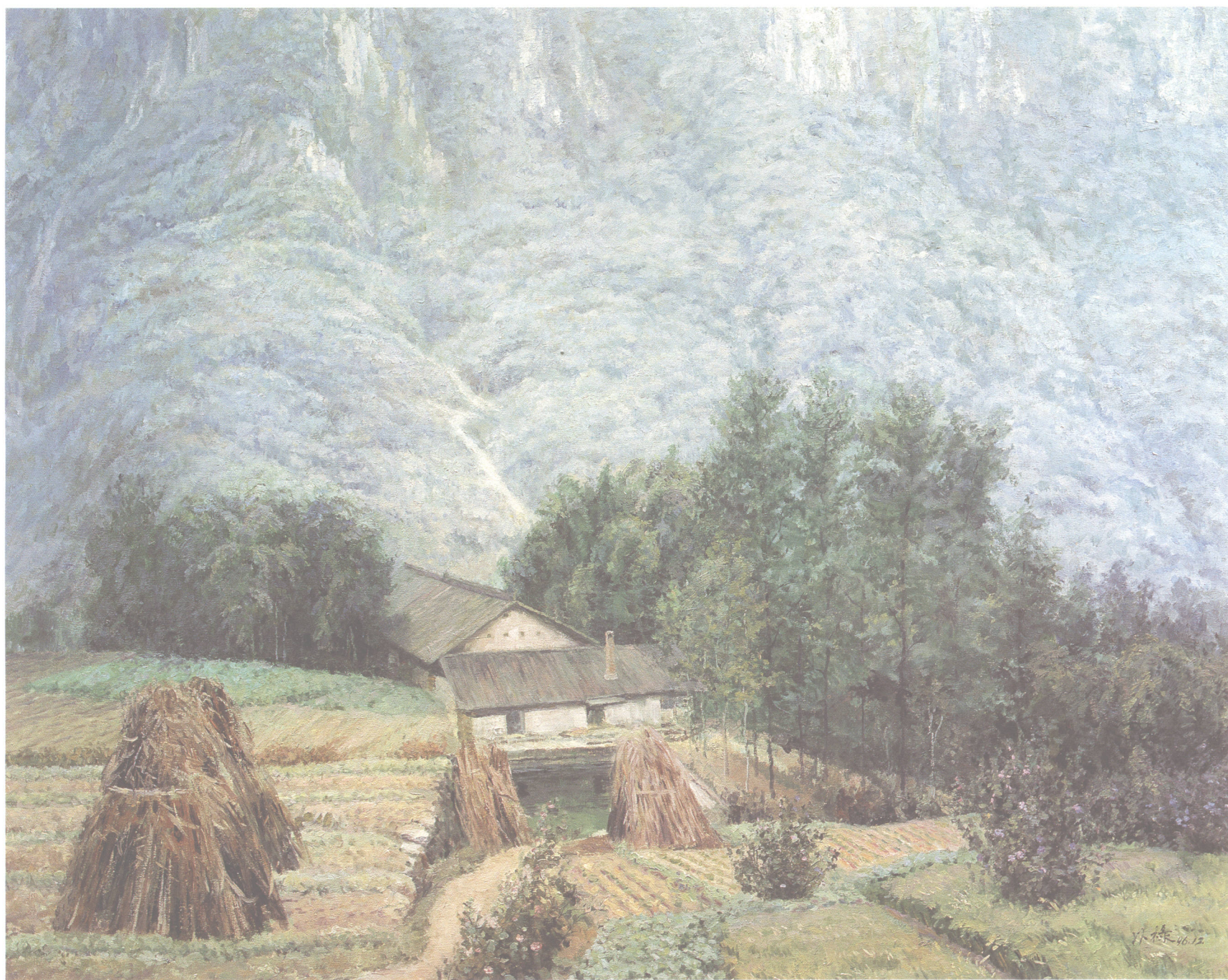
山裏的風景 (81cm×100cm)布上油畫 陳以祿 Mountain View oil on canvas Yilu Chen