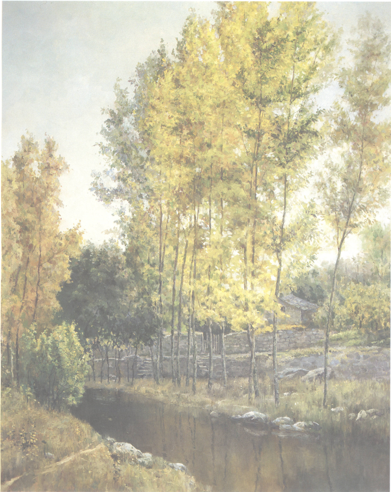
山村夕陽 (150cm × 120cm) 布上油畫 陳以祿

Sunset Over Mountain Village oil on canvas