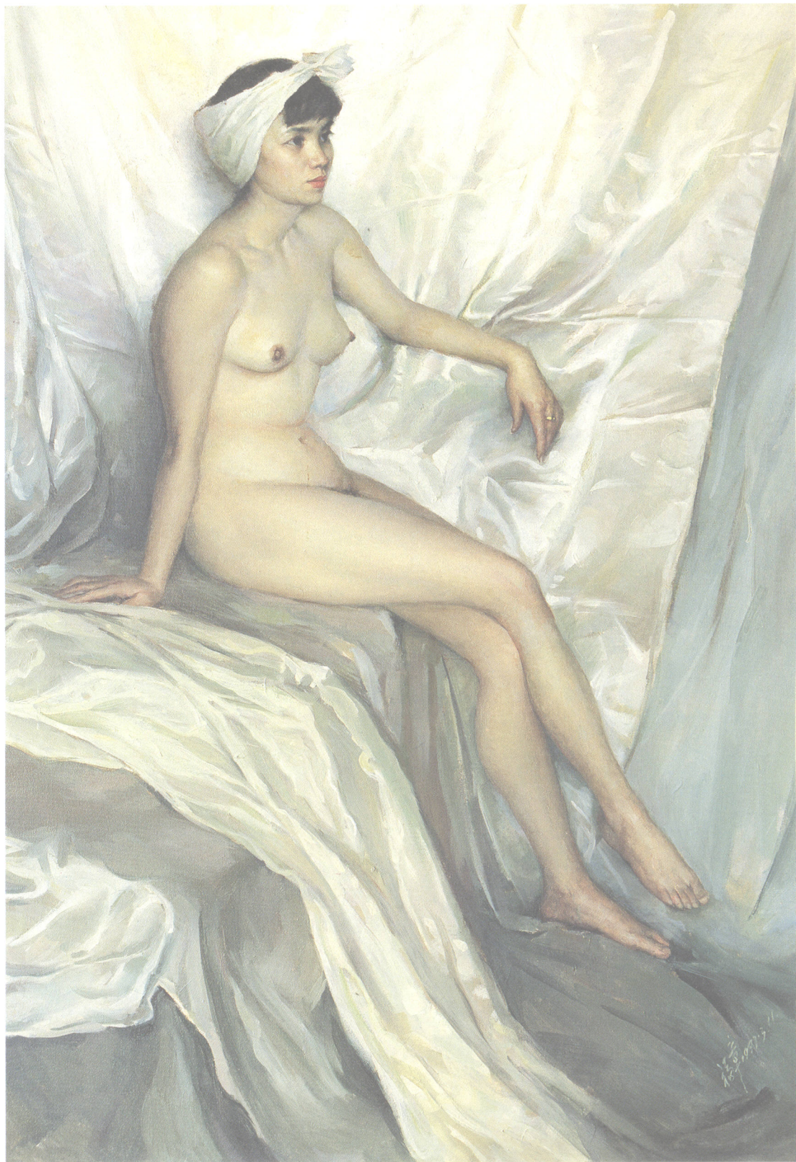
浴後 (90cm × 120cm) 布上油畫 董福章 After Bathing oil on canvas Fuzhang Dong