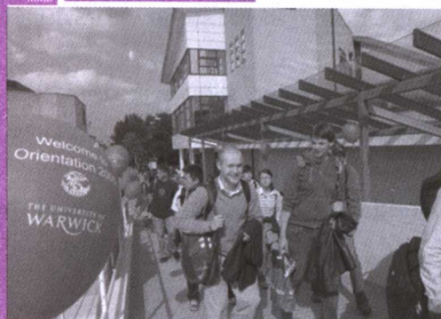
NEW INTERNATIONAL STUDENTS ARRIVED AT WARWICK UNIVERSITY.2003

classes your college offers. When I opened the catalog, it seemed like there were millions of choices! I would have never been able to make the right decisions on my own. I made an appointment to talk to an advisor and have him explain to me exactly what I was doing. I was then able to make a knowledgeable decision about what classes I needed to take.