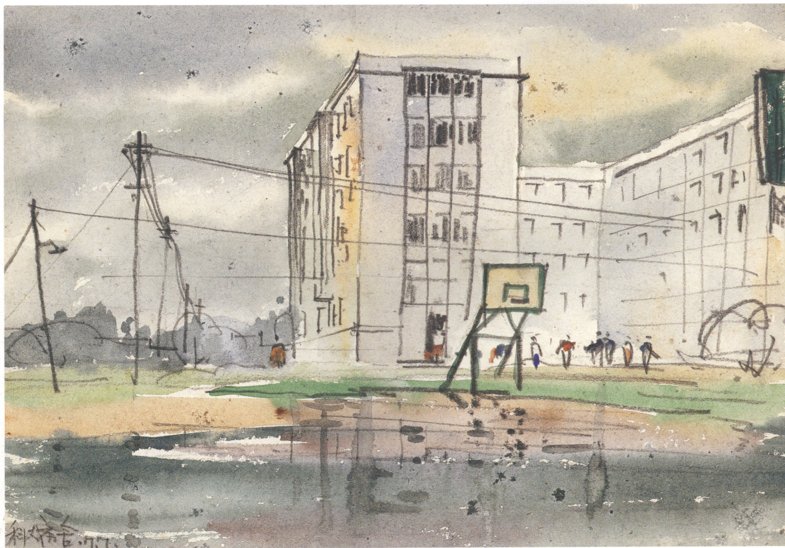
雨后的科大宿舍 碳笔淡彩 (1962 上海嘉定)