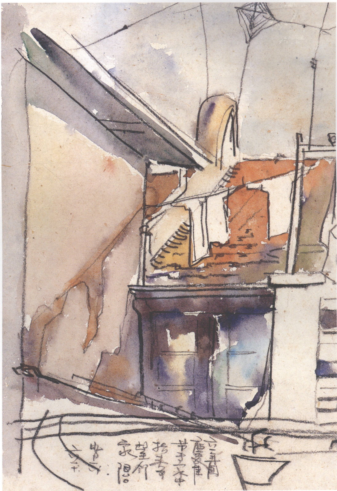
老宅 碳笔淡彩 (1961)

消逝的老宅，永久的回忆。我长期居住在石库门老宅，是单开间二层楼加亭子间的旧式里弄，原应一户独用，后为三户合用。此画为南窗即景，图中窗扇是南北穿堂风的关键，右侧为亭子间上的北晒台。