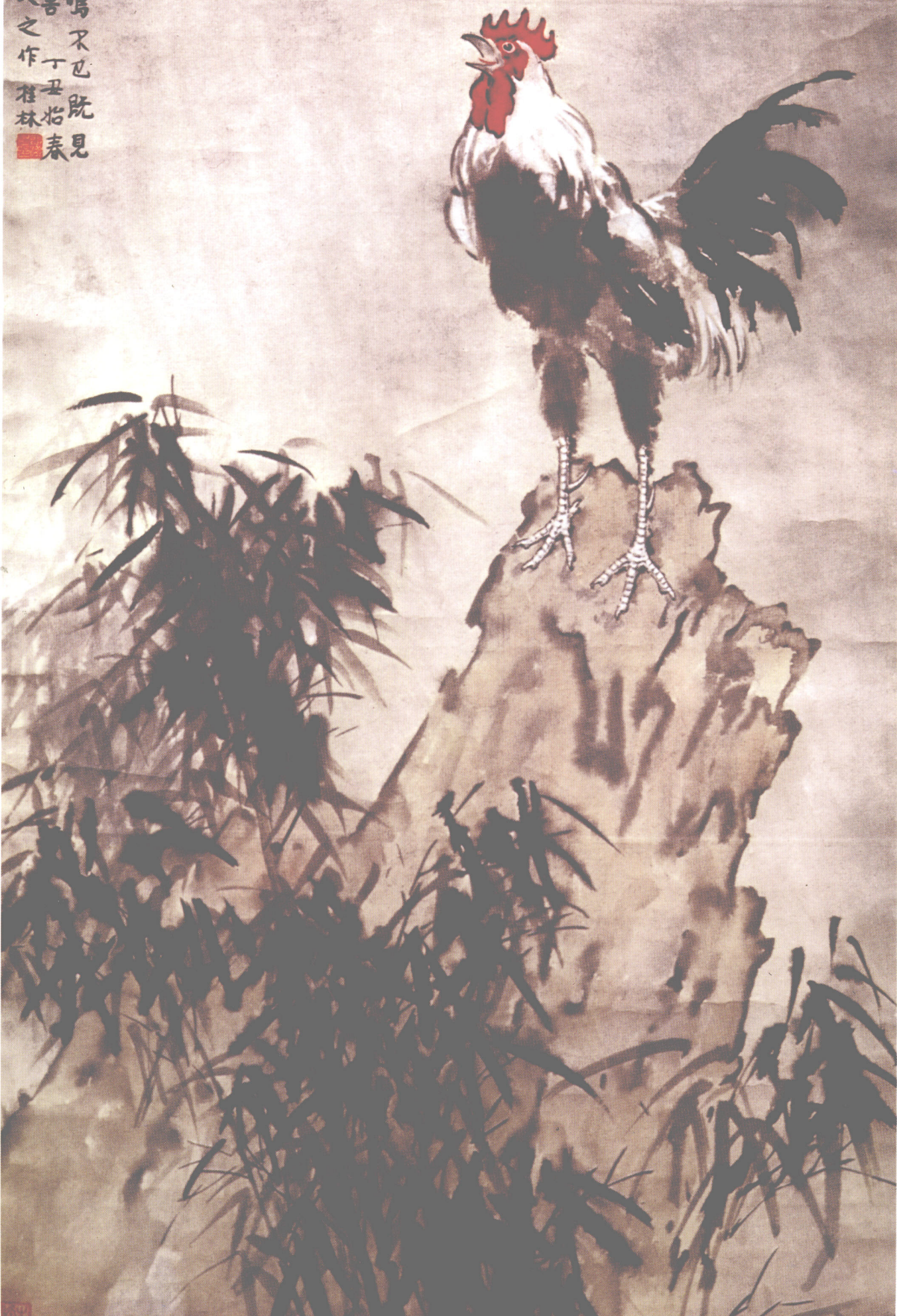
風雨鷄鳴 (局部見下頁) Rooster Crowing in the Rain (Detail of painting on next page)