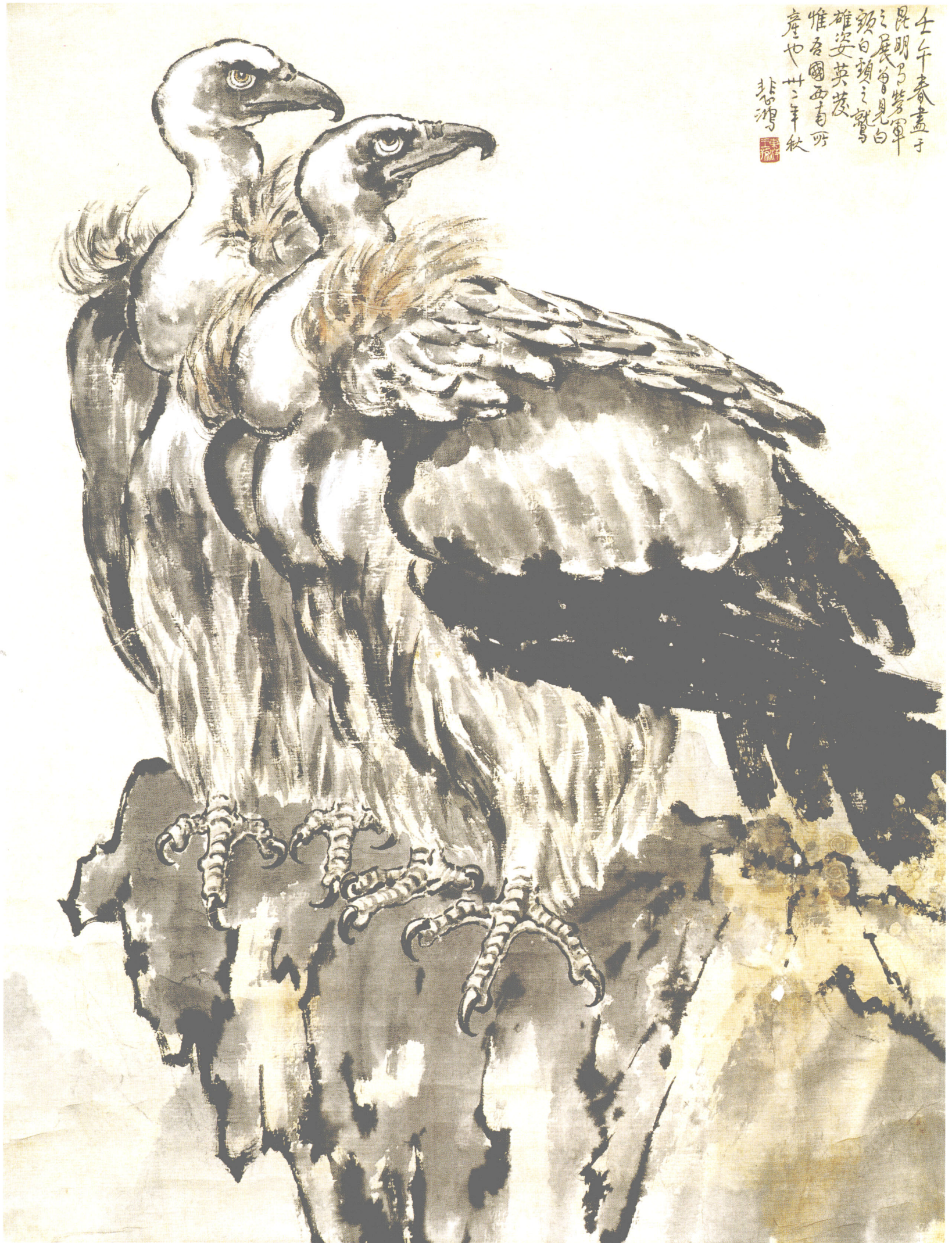
Two Vultures 雙鷲