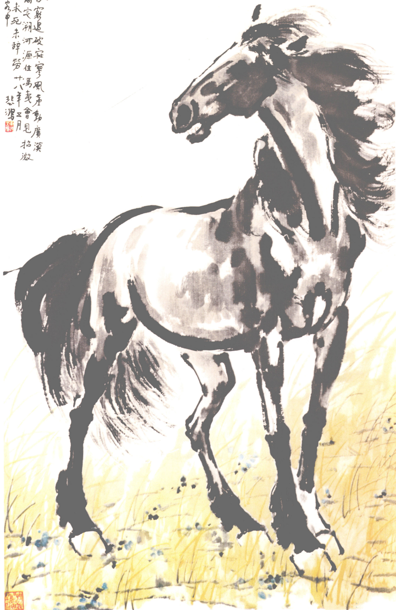
Horse in Autumn 楊文愛妻秋高

楊文愛妻在 伏檻寧終古窮追破寂寥風塵動廣漠 霜州歲秋高定朔河源佳馬夷會見招激 能奔之耳未死未辟勞 星沙客中 悲鴻