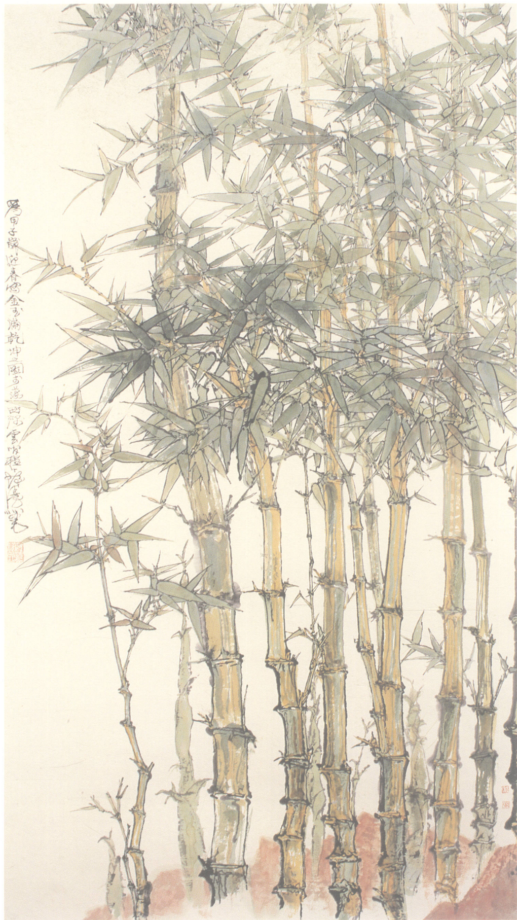
4. 金玉滿乾坤 Prosperity in the universe