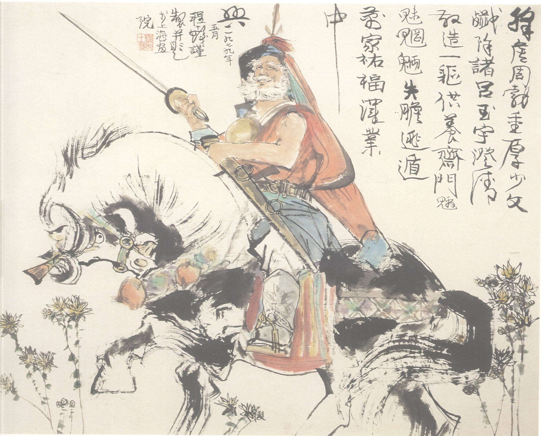
9. 周勃 General Zhou Bo