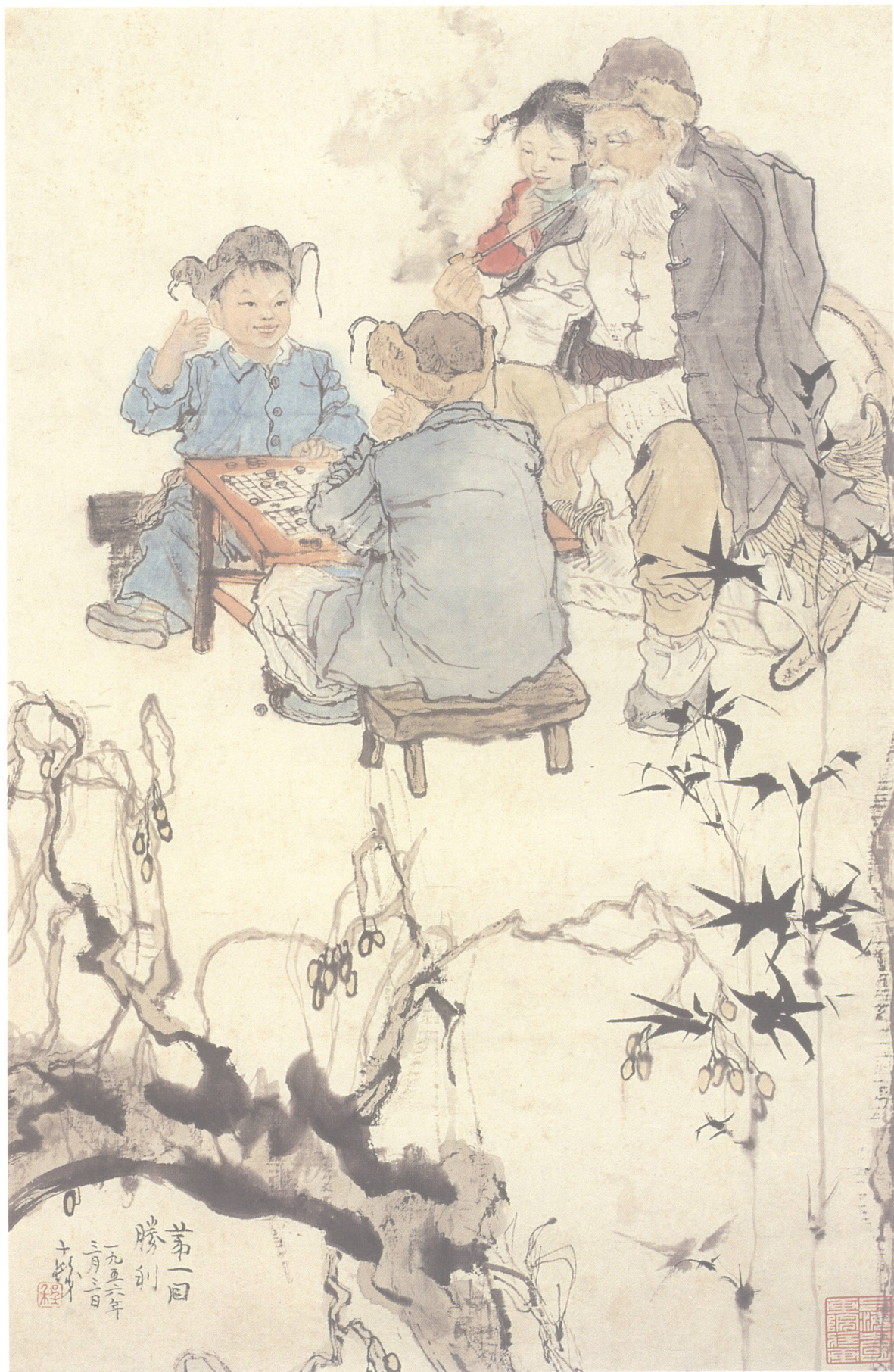
2. 第一回勝利 The first victory