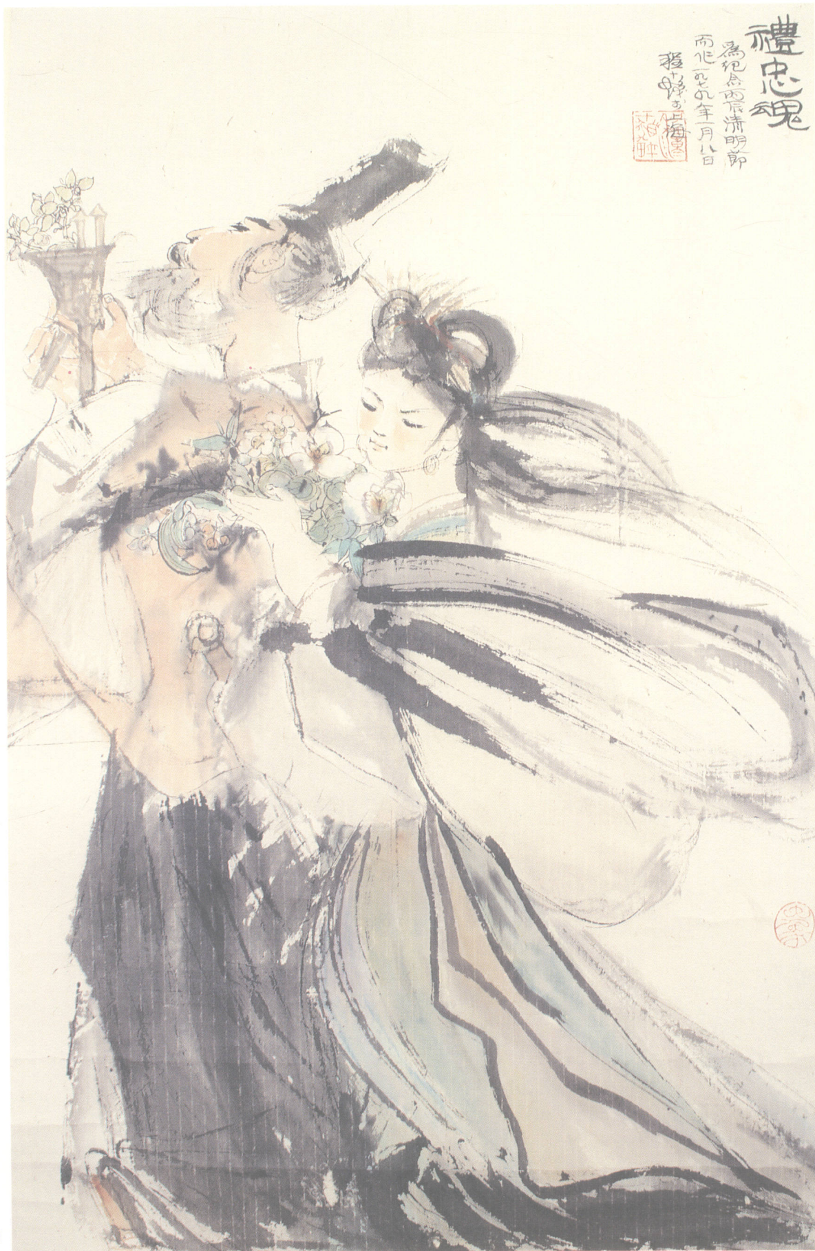
1. 禮忠魂 Homage to devoted soul