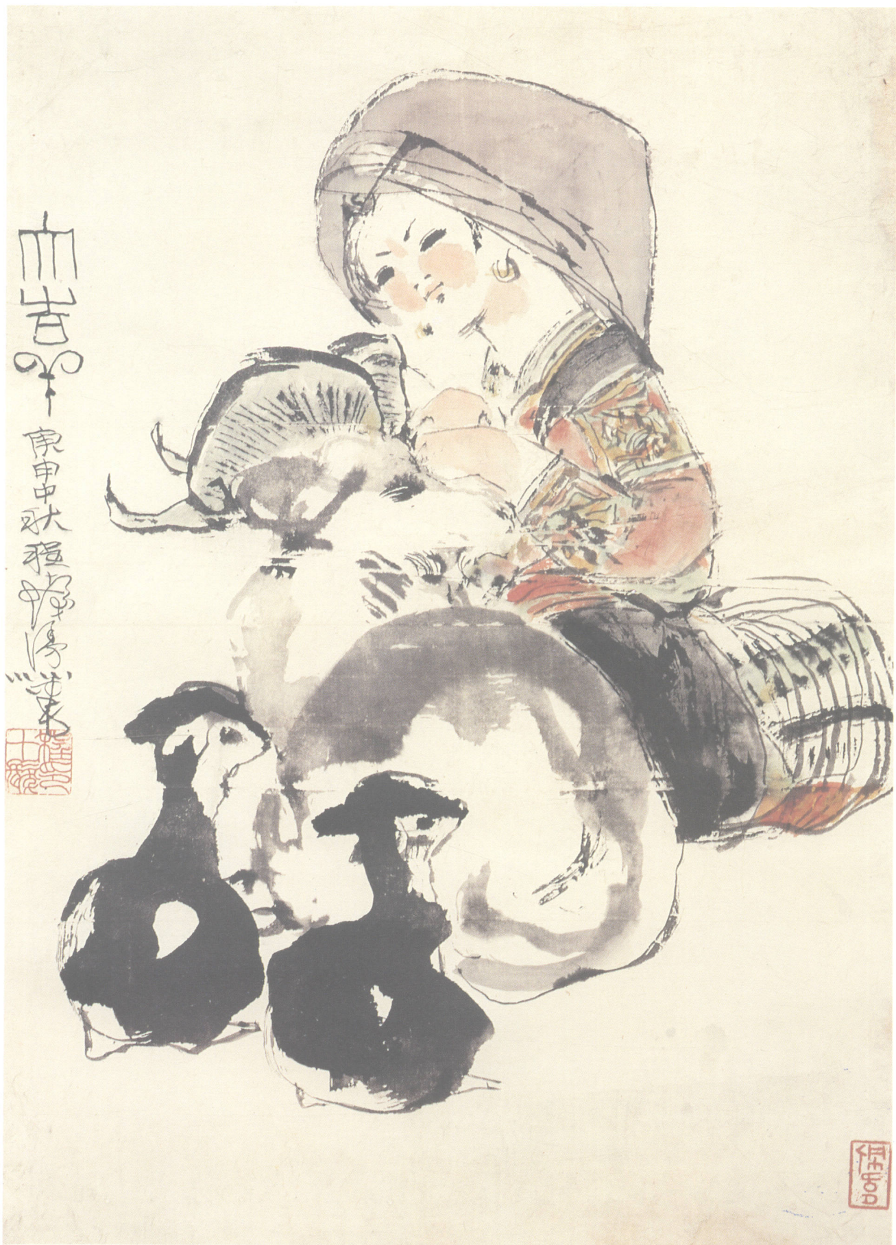
7. 大吉羊 Good luck