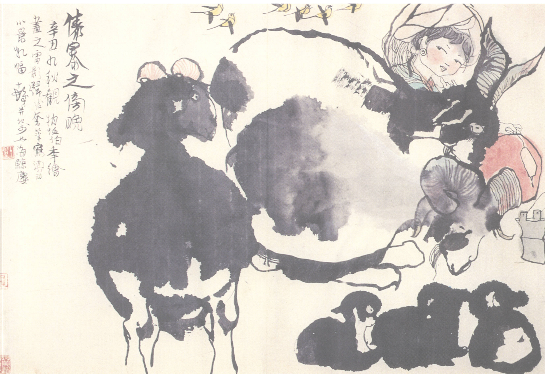
3. 傣家之傍晚 Dai households at dusk