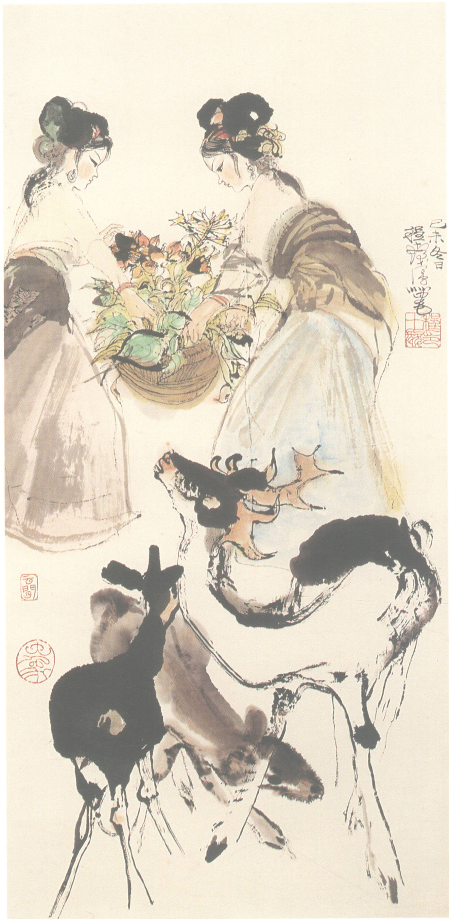
8. 採藥 Picking medicinal herbs