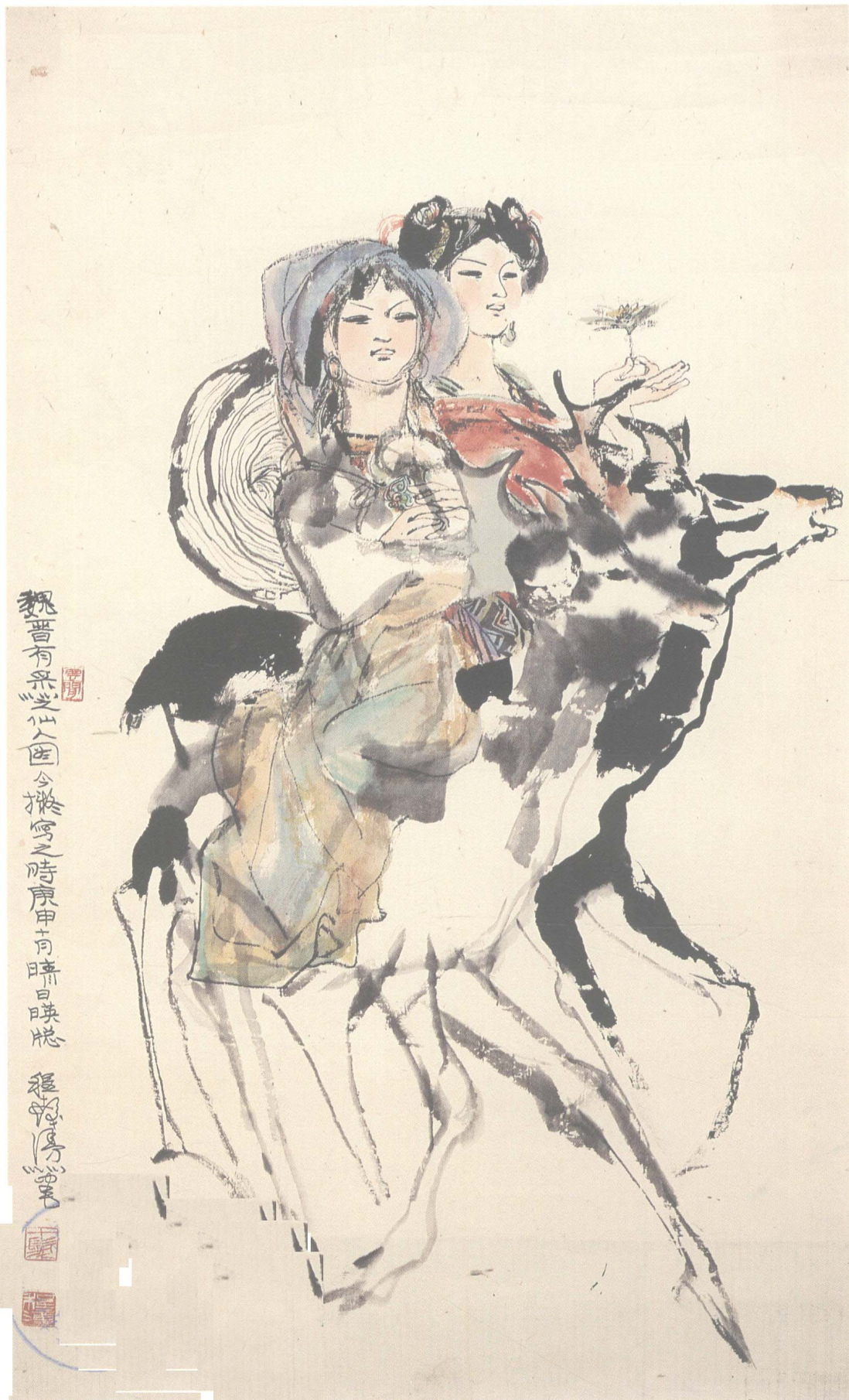
6. 採芝仙人 Immortal picker of glossy ganoderma