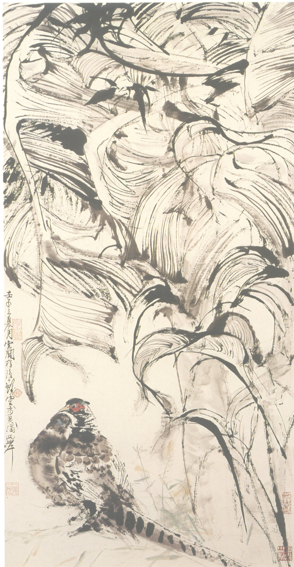
5. 芭蕉錦鷄 Gold pheasant under palm leaves