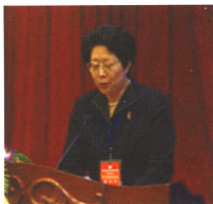
王昕副省长致欢迎辞 WANG Xin