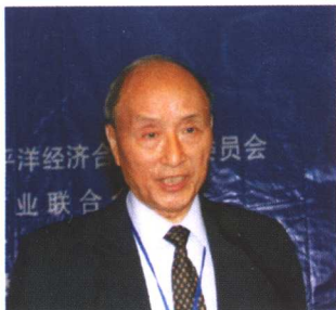
主持人 江承宗大使 Moderator JIANG Chengzong