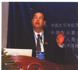
发言人 吉姆·朗多 Hon. Jim Rondeau