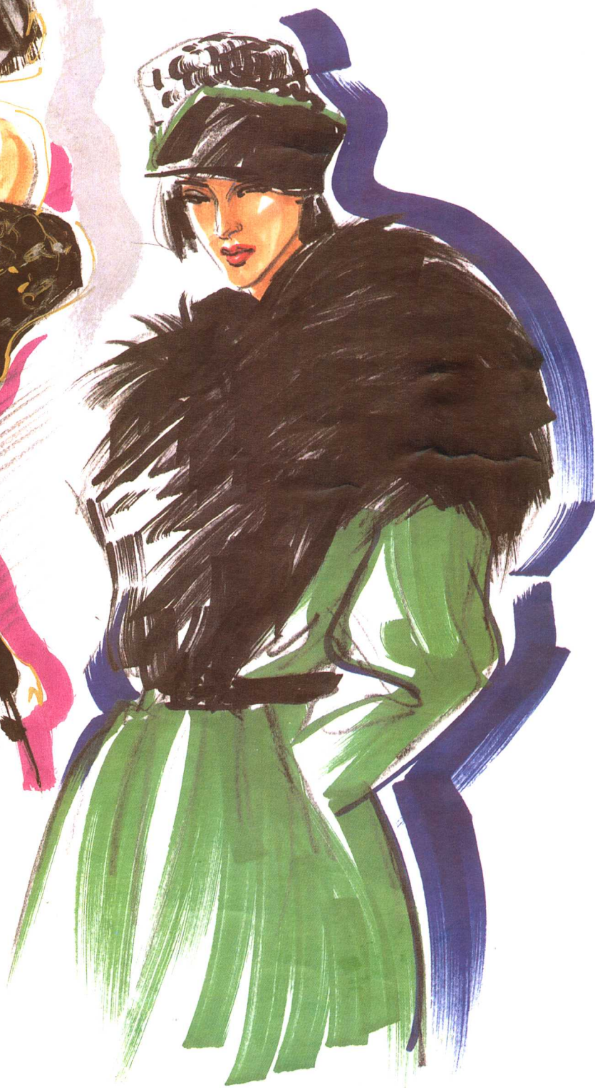
上等纸+乌木铅笔+麦克笔+漆笔+墨 Wood-free paper + ebony pencil + magic marker + paint marker + sumi (Japanese ink)