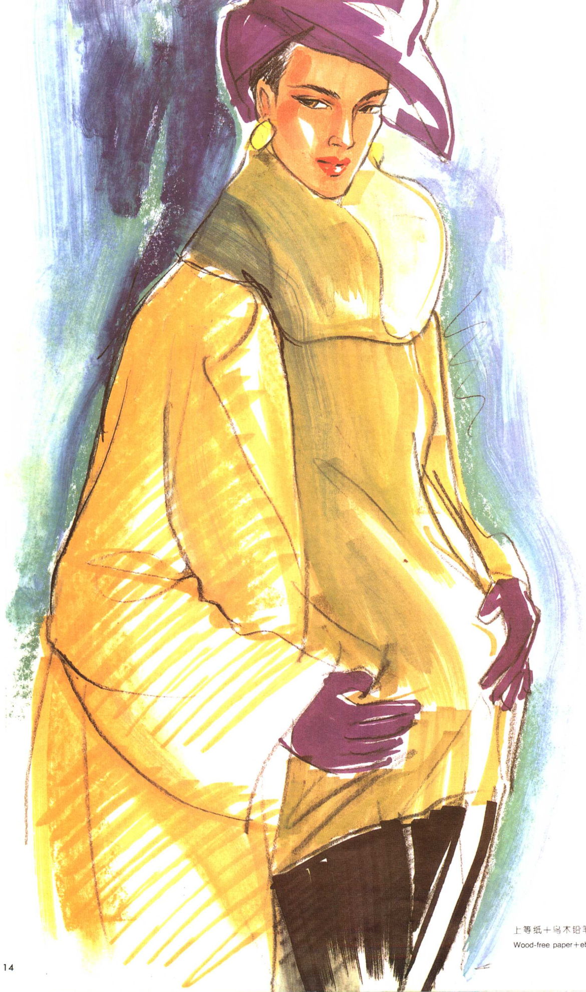
上等纸+乌木铅笔+油质彩笔+麦克笔 Wood-free paper+ebony pencil+oil pastel+magic marker