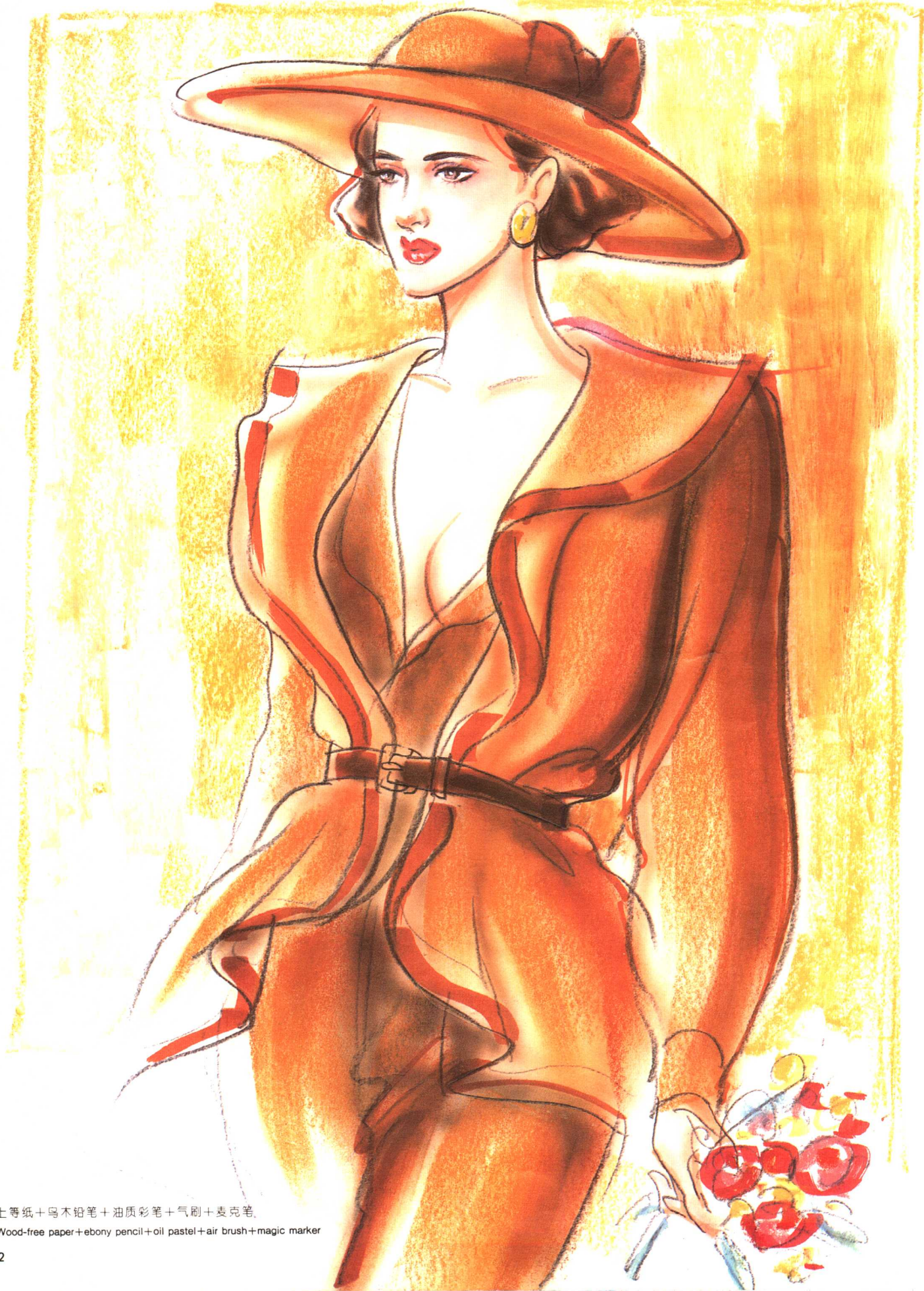
上等纸+乌木铅笔+油质彩笔+气刷+麦克笔。 Wood-free paper+ebony pencil+oil pastel+air brush+magic marker