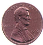
a penny one cent $.01