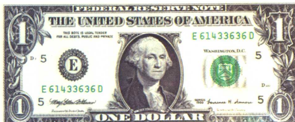
a dollar $1.00