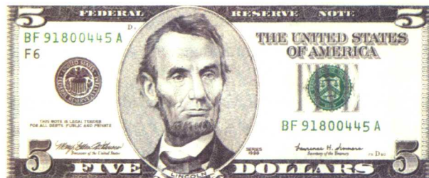
five dollars $5.00