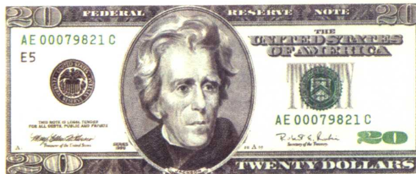
twenty dollars $20.00