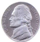
a nickel five cents $.05