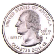
a quarter twenty-five cents $.25