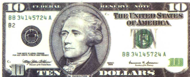
ten dollars $10.00