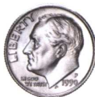
a dime ten cents $.10