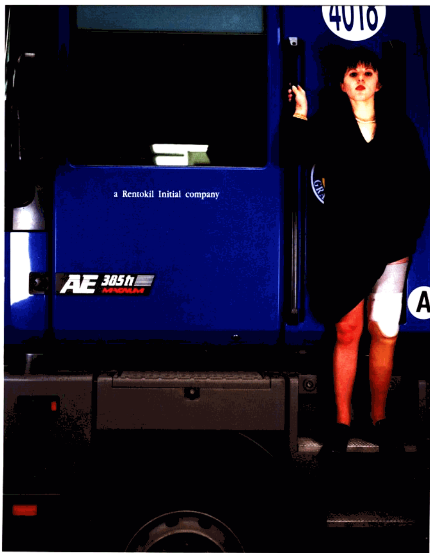
展览 《事故发生以后》 杨·莫万 (法国)