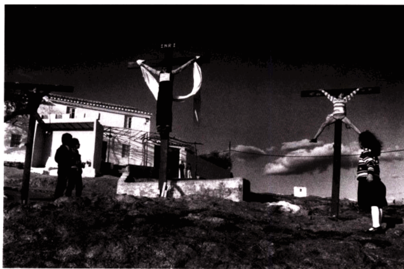
展览 《被遗忘的西班牙》 克里斯蒂娜·罗德罗 (西班牙)