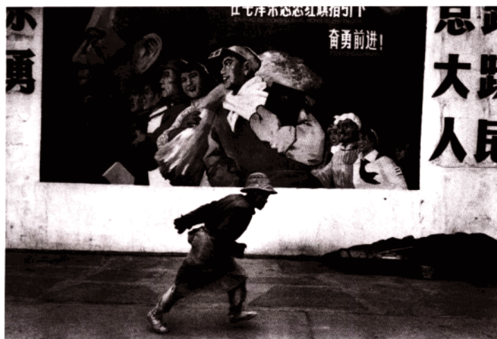
展览 《上海人》 马克·吕布 (法国)