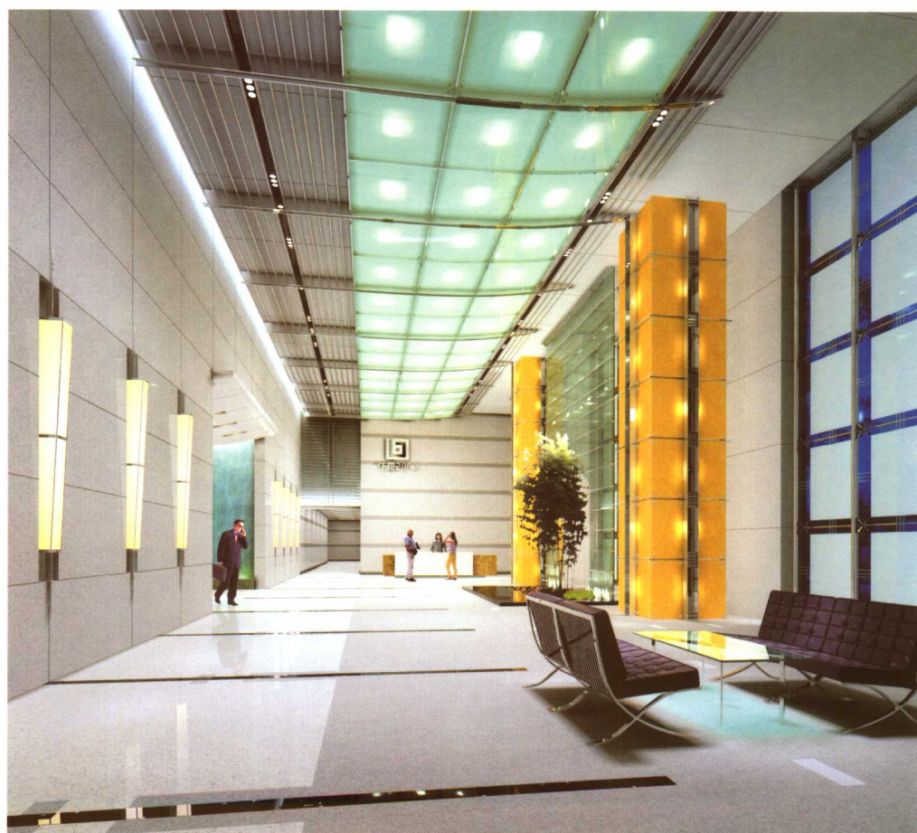
左: 北京住邦 2000 大堂方案一 Left: Lobby (Plan #1), Zhubang 2000, Beijing 右上: 北京住邦 2000 大堂方案二 (日景) Top Right: Lobby (Plan #2, Daytime), Zhubang 2000, Beijing 右下: 北京住邦 2000 大堂方案二 (夜景) Bottom Right: Lobby (Plan #2, Nighttime), Zhubang 2000, Beijing