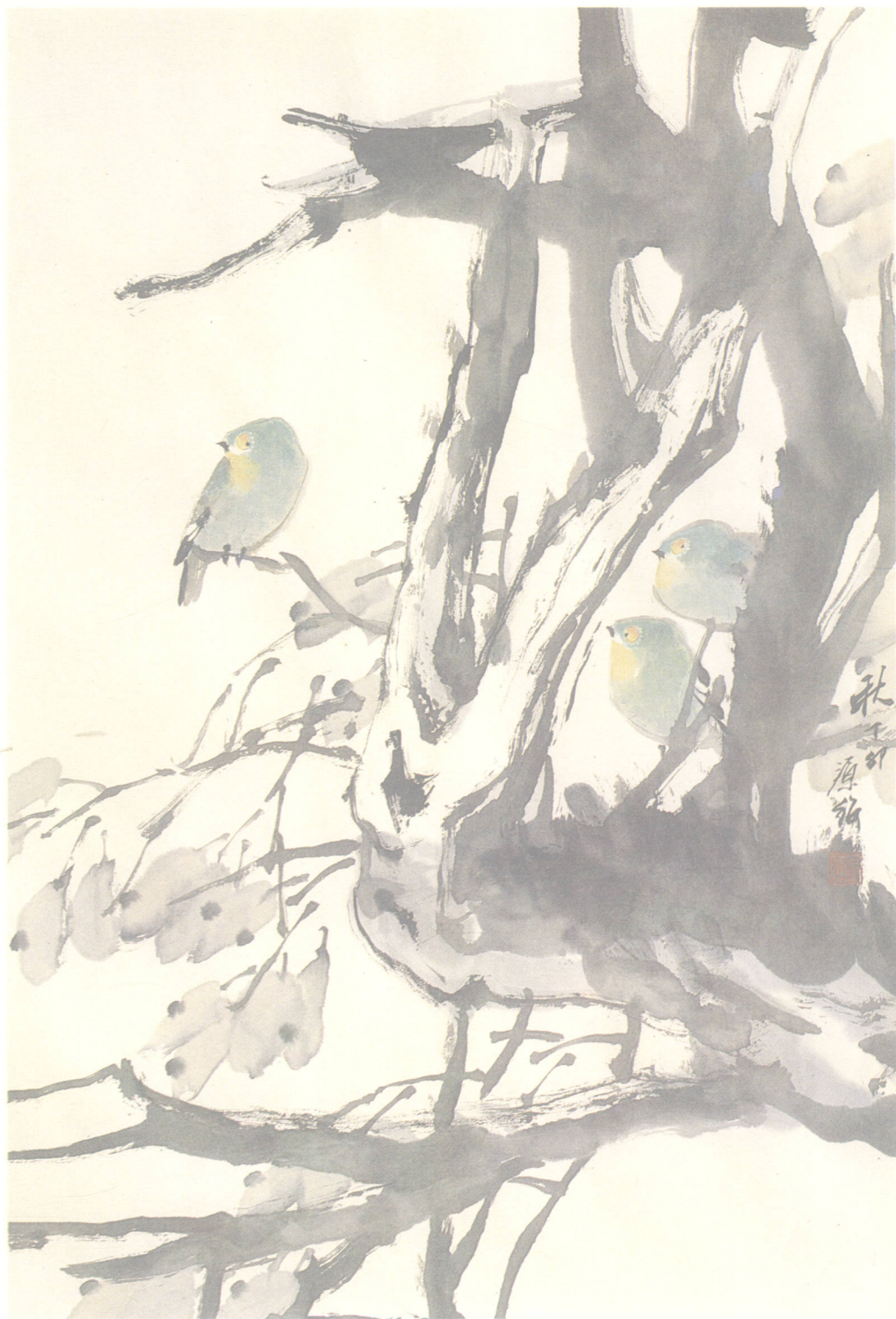
秋语 Autumn Words