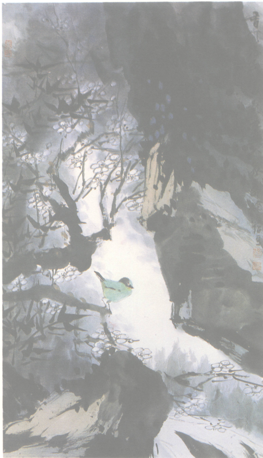
暗香 Faint Fragrance