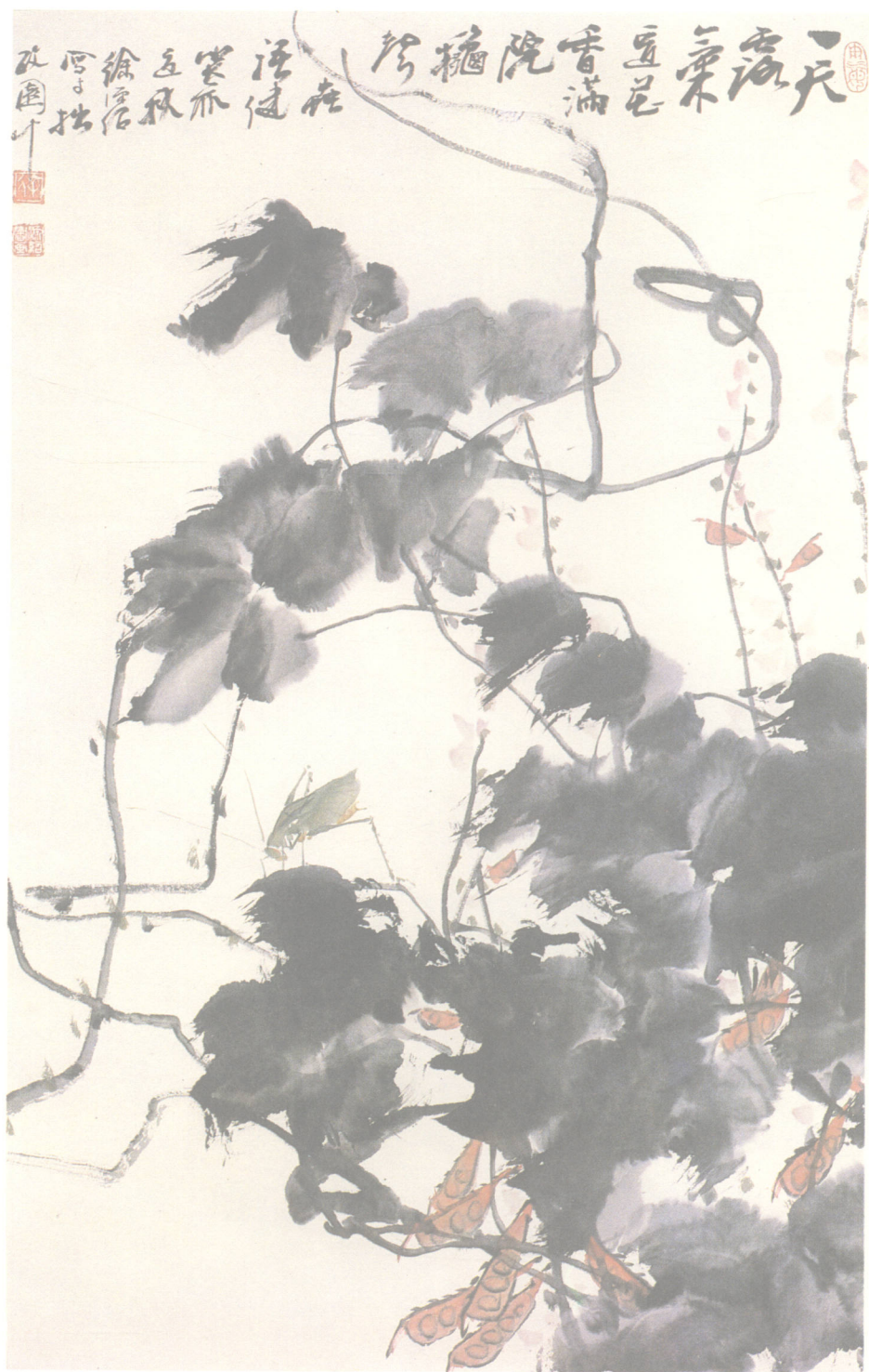
秋声 Autumn Noise