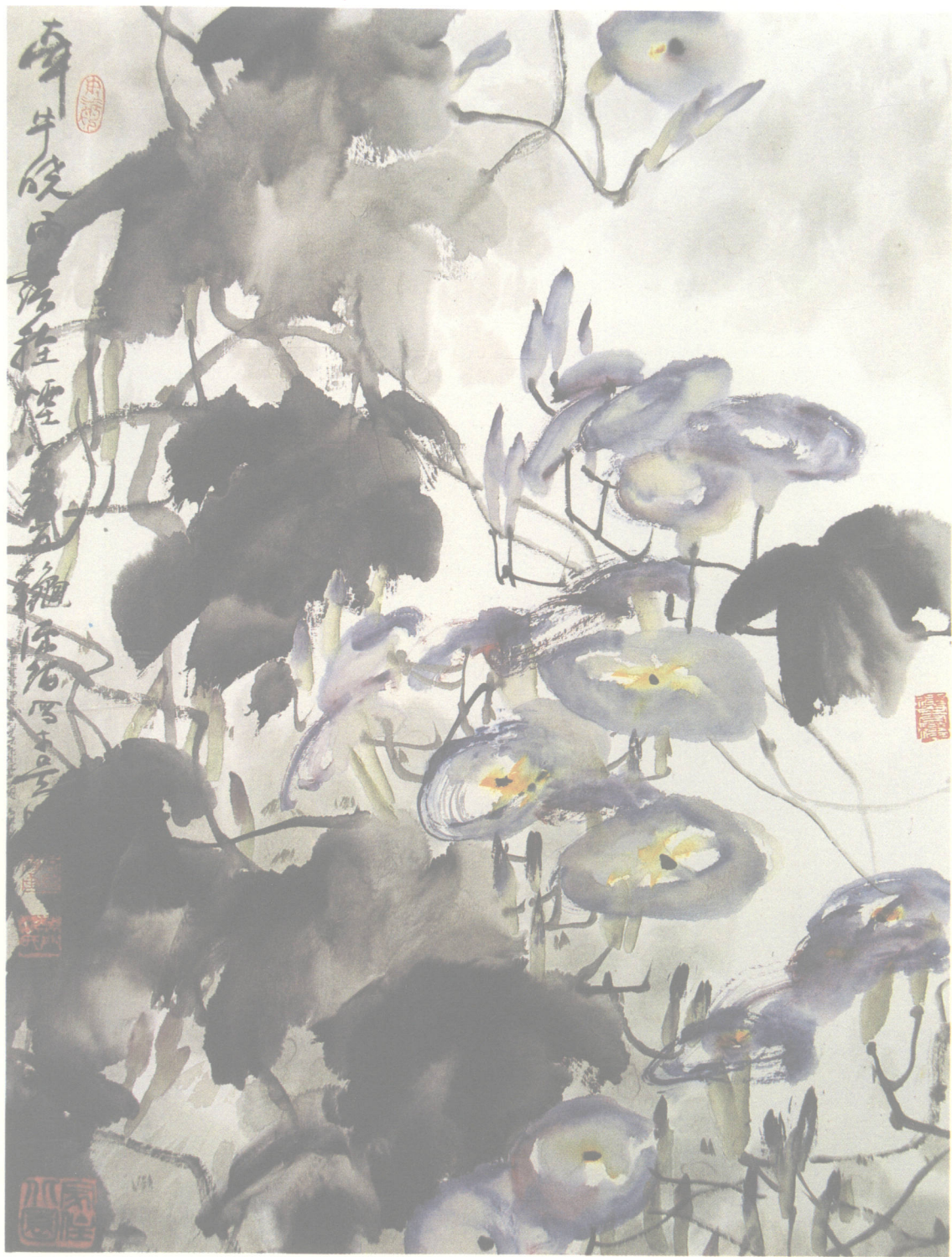
牵牛花 Morning Glories