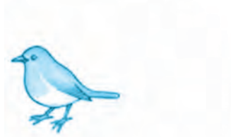
A. European Robin

4. Which of the following is the national bird of the USA?