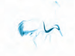
B. Red-crowned Crane