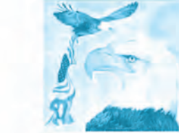
D. Bald Eagle

5. Form groups of three or four students. Try to find, on the Internet or in the library, more information about the USA which interests you. Prepare a 5-minute classroom presentation.