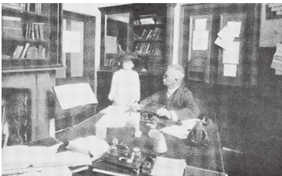
“I WANT YOU TO GIVE THIS TO CAPTAIN WOOLCOT.”

He took a bunch of keys from his pocket.