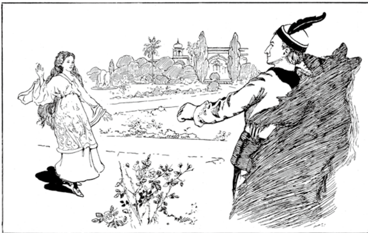
" FROM THE TORN SKIN STEPPED A HANDSOME YOUTH."

6. Hardly had she spoken before a great change took place. The bear's skin grew loose upon him; there was a sound of tearing, and forth from the torn skin stepped a handsome youth.