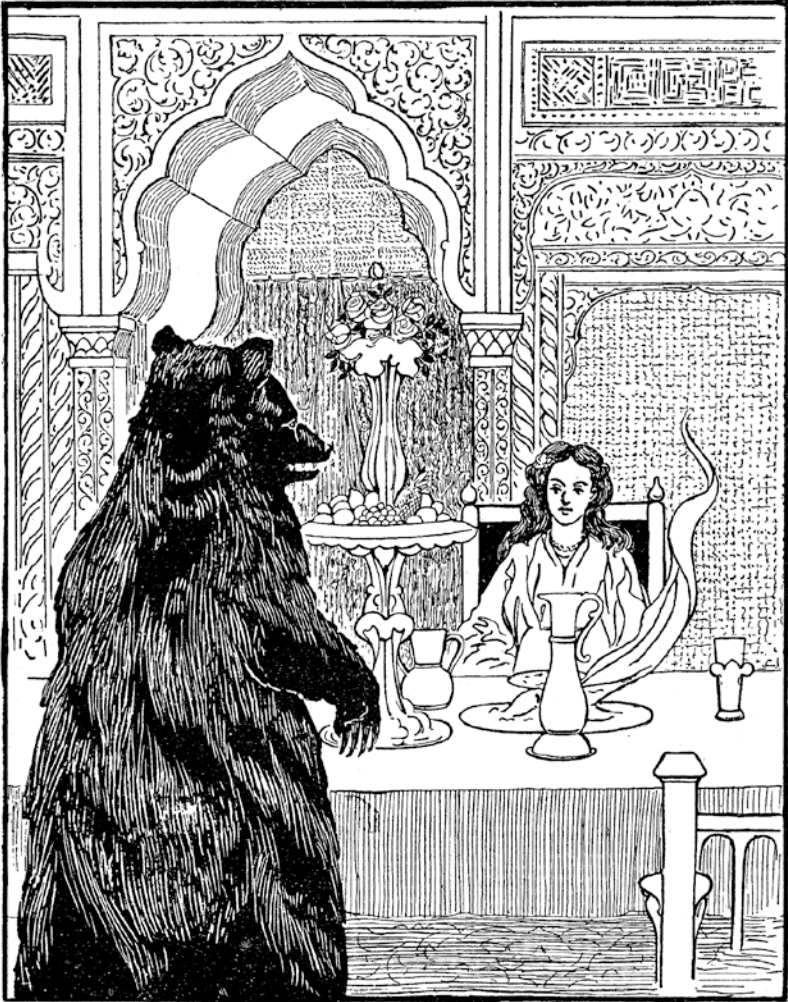
“ THE FOOD WAS OF THE DAINTIEST KIND.”

at table, the food was of the daintiest 1 kind, and the sound of sweet music filled the air.